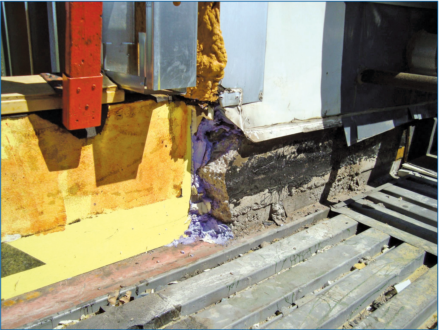
When it comes to roof, wall, and parapet detail, how does one transition and detail the vapor retarder, air barrier, insulation, and waterproofing? Expectations of roof solutions = zero air and energy loss with zero moisture infiltration.

Modern design thoughts are evolving to concentrate more on the difficulty of installing roofs (the art) to meet with our raised