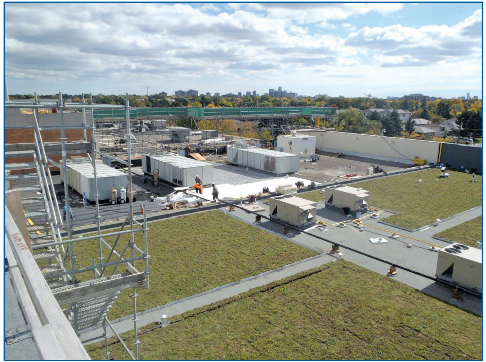
Shown here is a roof replacement design incorporating green technologies, including a permanent insulation system, resurfaceable roof membrane, water retention capabilities, and rooftop landscaping. Complexities of rooftop safety and access are overcome with extensive scaffolding and walkways.

Today's roofing contractors have, for the most part, adapted to the modern ways of roofing. They send their crews to project sites armed with material safety data sheets, safety and rescue equipment and plans, shop drawings for scaffolding and hoarding, building and road closure permits, and tapered insulation drawings. Today's roofing technicians/mechanics are trained in how to install multiple types of roof membranes and how to incorporate them with insulation in a variety of roof system configurations. How they incorpo-