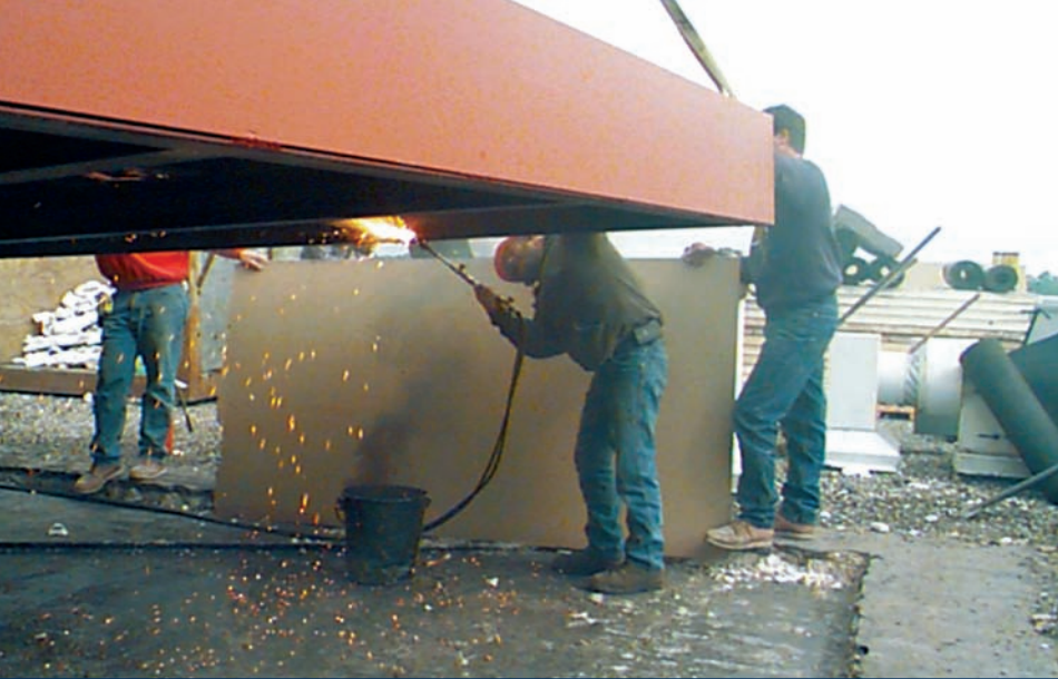
Small fire contained in bucket.

ic/asphalt built-up roof membrane. Reportedly, the existing roof assembly represented original construction and was 16 years old with no history of performance problems.