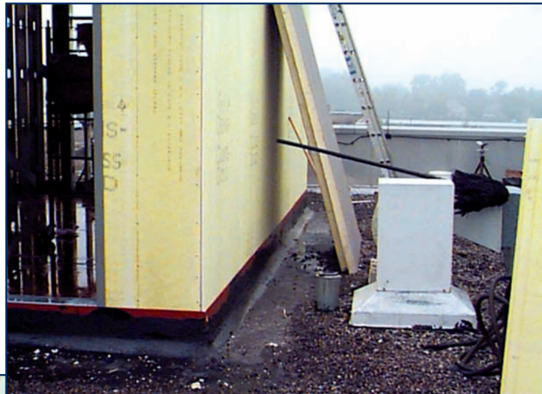
Below: Revised proper flashing conditions with required wood blocking.