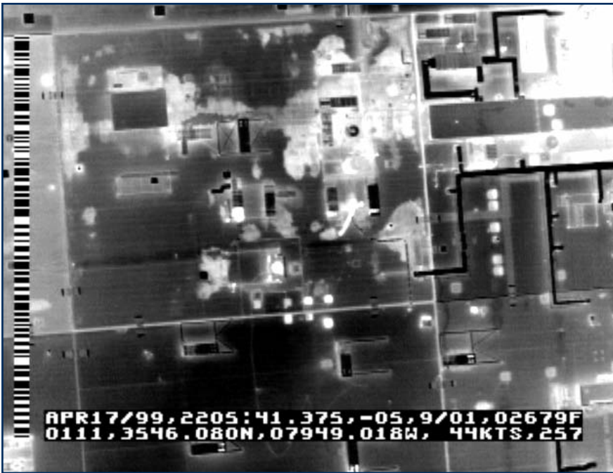
Example of a scaled AutoCAD drawing of roof moisture.

and AutoCAD components can then be separated. If dimensional information is available, this creates a quantitative, scale quality AutoCAD drawing of the suspect roof moisture contamination on the roof. If dimensional information is not available, the drawings become scaleable and easily updated at any time in the future, once quantitative data are obtained.