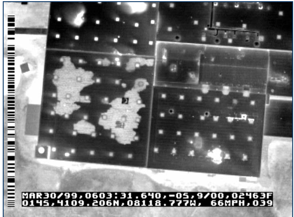
An aerial infrared thermograph showing clear outlines of subsurface moisture contamination from 2,000 ft. AGL (Above Ground Level).

The problem with the helicopter was that even as close as 500 feet above the building, we could not resolve (to our satisfaction) the infrared images of the blobs. We had to deal with the vibrations. Also, the slow ferrying speeds and $575/hour for the aircraft and the pilot dissuaded us. By the time we got high enough to get a large area in the image, we lost our resolution. Even though we were using state-of-the-art infrared cameras, they just did not have the thermal and/or spatial resolution required for obtaining good imagery from high above. Most infrared cameras are built to resolve images a short distance away from the detector. These cameras, including the modern 2000