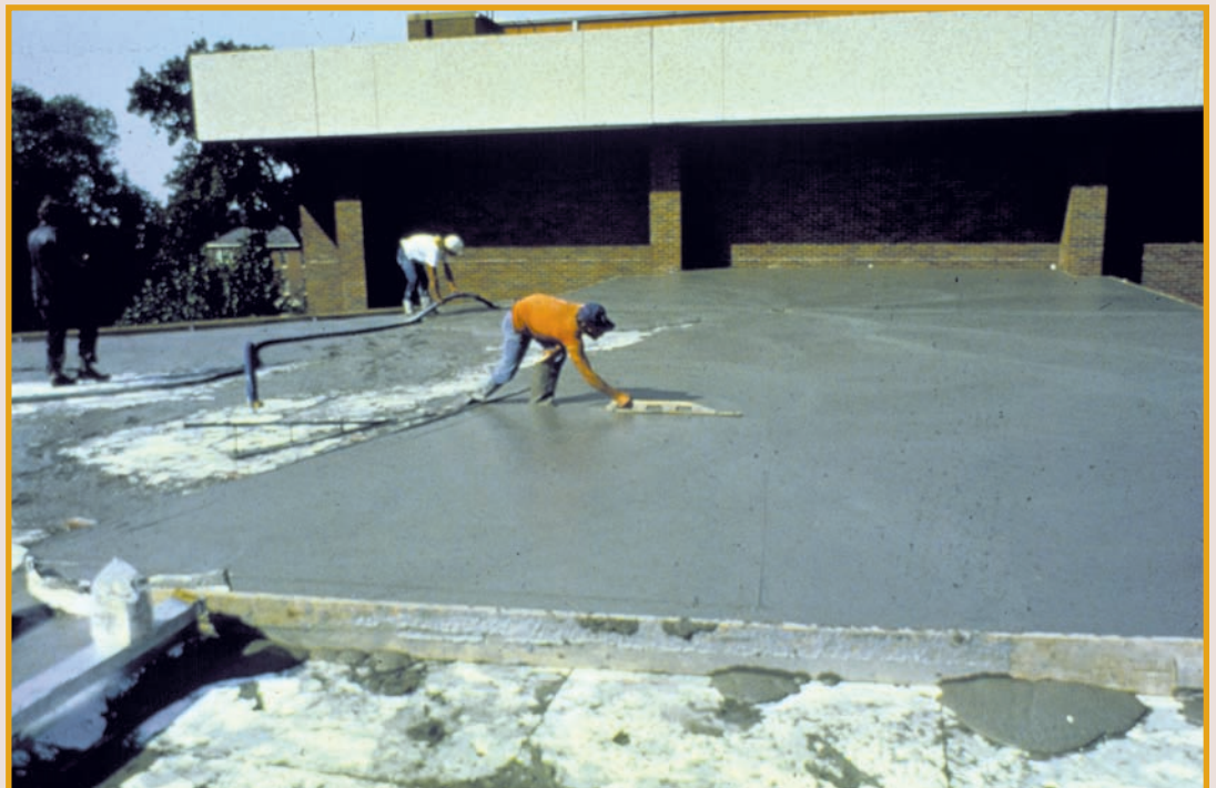
Workers apply lightweight insulating cellular concrete.

Expanded aggregate concrete is produced from expanded minerals such as perlite or mica. When these minerals are expanded by heat, the resulting open structure has a high affinity