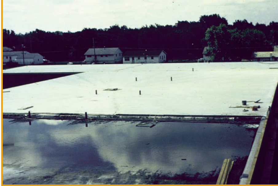
Lightweight Insulating Cellular Concrete project in progress.

Under normal conditions, the roofing membrane over a cellular concrete roof deck may be installed 3-5 days after the deck is cast. If there is rain during the first few days after casting, the water typically flows to the drain. If the deck is exposed for longer periods of time, drying shrinkage cracks may appear and permit water to enter the roof deck system. Sometimes water may penetrate the deck at vertical protrusions (which have not