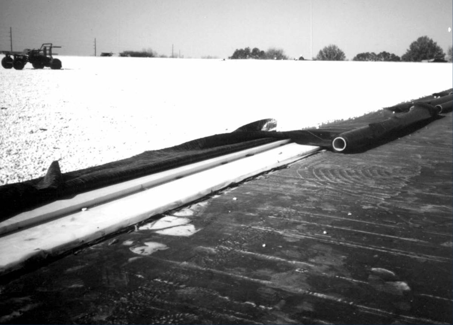
Photo 3: New installation of unadhered foam PMR system with fabric and ballast.

ponded water or light ballast, and the insulation could become buoyant and separation from the membrane could occur. If the extruded foam separated from the asphalt flood coat, it was easily repaired, and no major damage would occur. If the separation happened to be between the flood coat of asphalt and the top layer of felt, rotting of the organic felts could occur if the floating board was not discovered in a timely manner. This sometimes required more extensive repairs. In the first generation IRMA, the installation of the foam was critical to the long-term performance of the system, especially in very low-slope or dead-level applications.