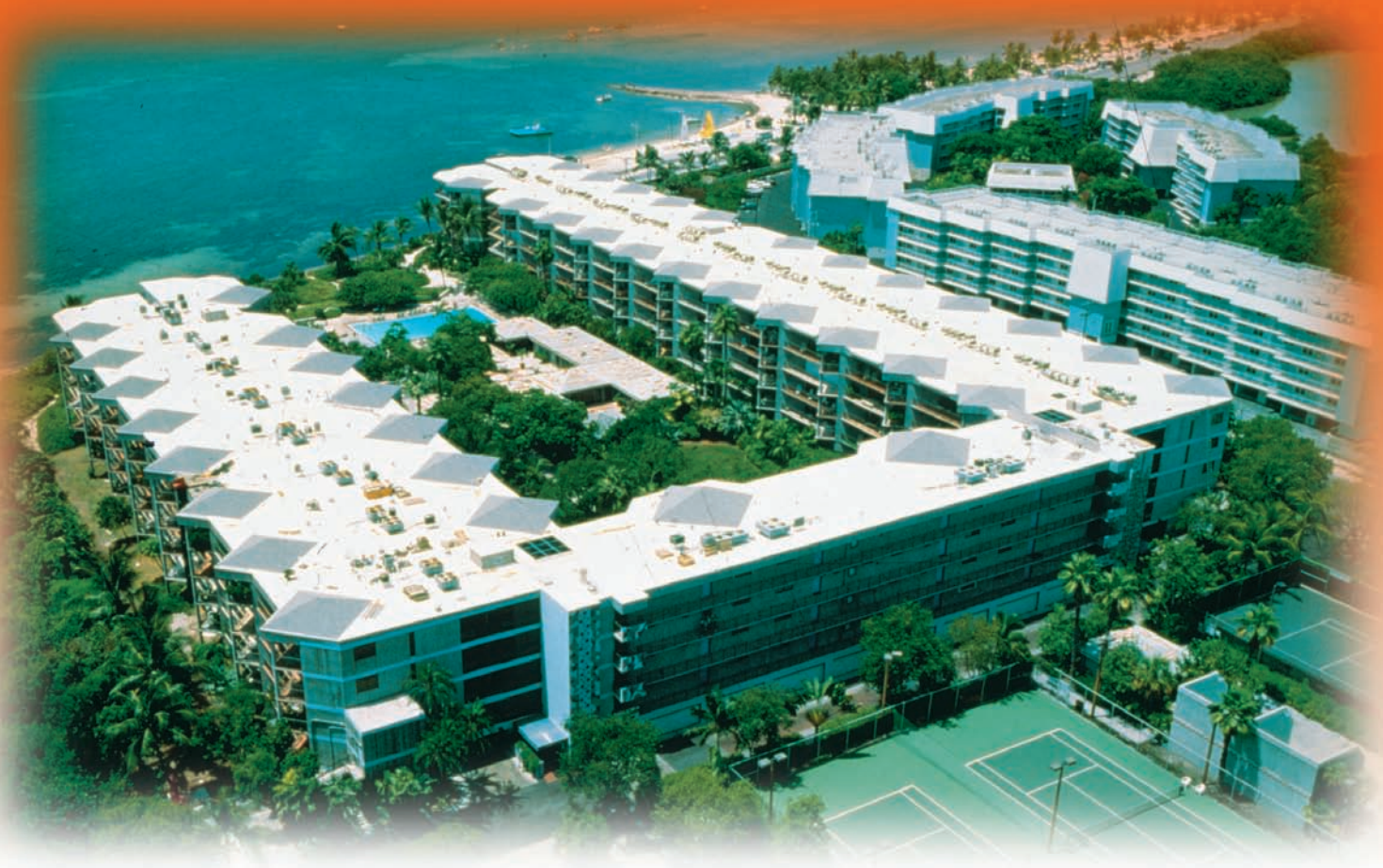
A multi-residence structure in Key West, Florida, shows use of high reflectivity materials by Stevens Roofing Systems.