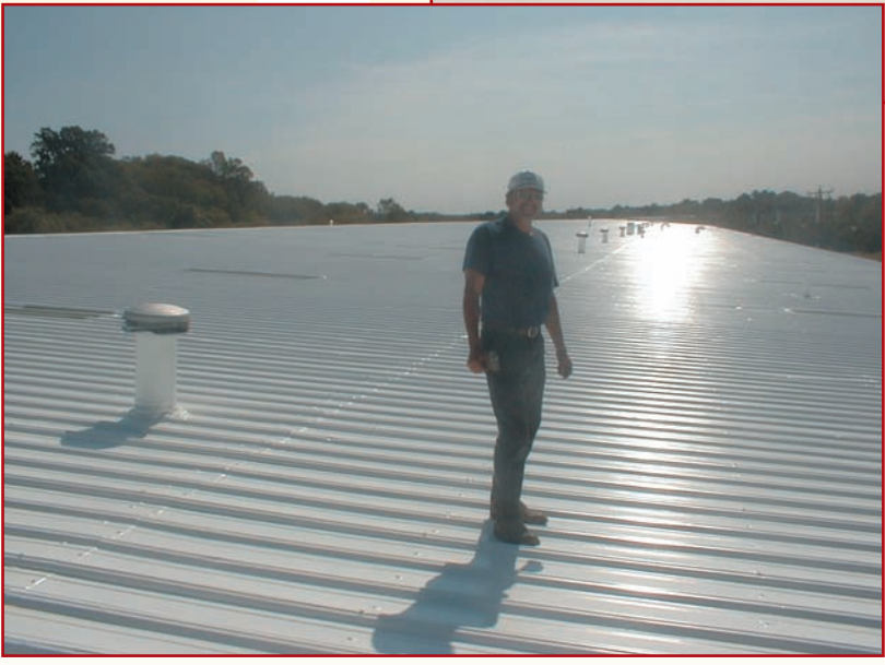
A self-priming SBS coating provides corrosion protection and a leak-free environment, while substantially reducing surface temperatures and thermal movement. Spacepark South, Nashville, TN.

Polymer advances have had a major effect upon the roofing industry. Sheet goods and coating formulations reflect this broad range of options in a sometimes confusing mix of abbreviated initials. While membrane classifications include PVC, EPDM, CSPE, PIB, and more recently, TPO, coatings are likewise grouped within common generic categories acrylics, urethanes, silicones, aluminized asphalt, etc. In most cases, a primary resin component establishes the formulation's core with additional materials blended to complement the polymer's durability. The use of SBS resins is one area in which coatings and membranes find themselves on somewhat common ground.