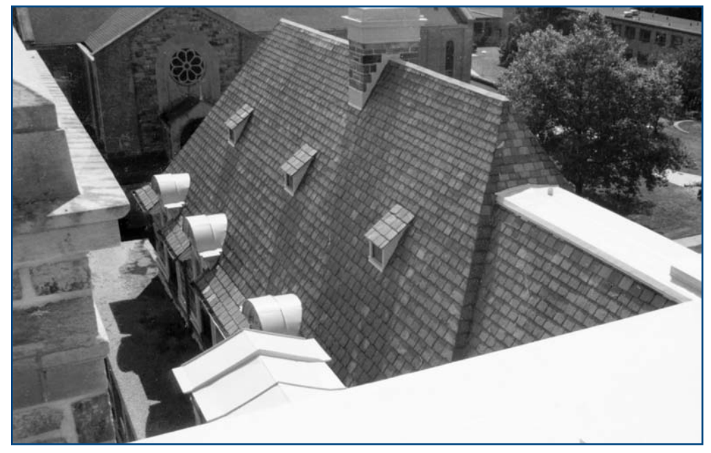
Pigmentation options are limited, but thermoplastic elastomers are well suited for pastel applications such as this patina green at the Aldrich mansion in Warwick, Rhode Island.

Many grades of SBS, or its cousin, SEBS, are available. In an elastomeric coating application, a tri-block, copolymer SBS has been widely specified. The polymer's three blocks are comprised of two styrene chains alloyed to either end of a rubber monomer of butadiene or ethylene butadiene composition. When dispersed and heated in a solvent carrier, the styrenes provide a degree of physical crosslinking as the styrene chains bond to each other to form a molecular matrix. This builds tensile strength and elasticity while also maintaining low tension levels during elongation.