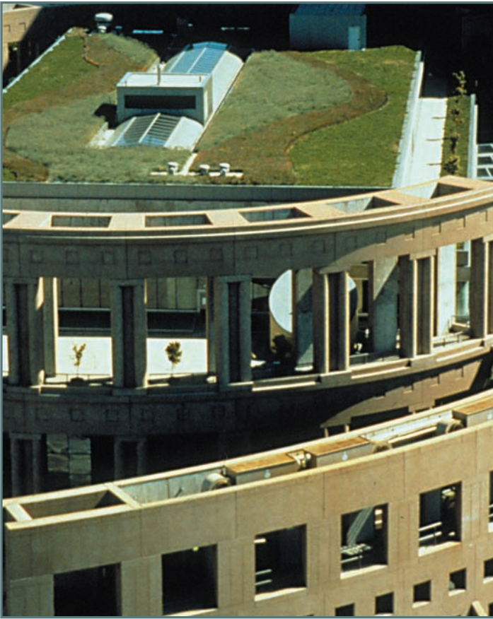
Figure 4: Vancouver Public Library green roof, installed in 1995. Architect, Moshe Safdie Architects and Downs/Archambault & Partners; Cornelia Hahn Oberlander, CM, FCSLA, FASLA, landscape architect.