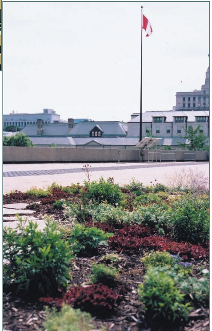
Figure 5 shows the Green Roof Infrastructure Demonstration Project at Toronto City Hall, fully accessible to the public during business hours. Eight different roof plots each represent different green roof applications.