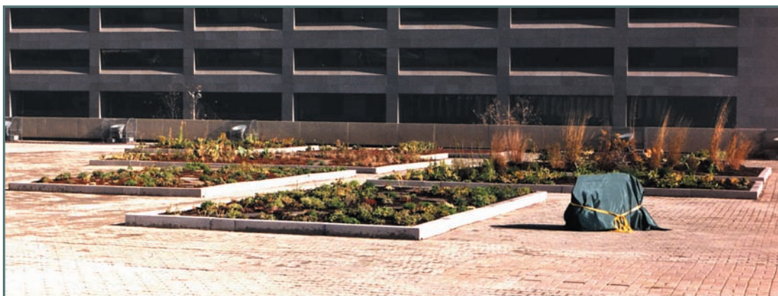
Figure 6: The Toronto Green Roof Project was planted primarily this spring.

develop a common resource of technical information and protocol for conducting further site and city-wide research and cost/benefit analysis.