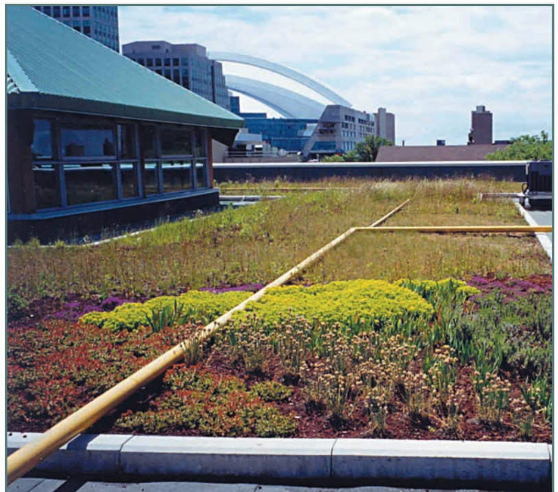
Figure 3: Mountain Equipment Cooperative, downtown Toronto, greened with the Sopranature system of Soprema.