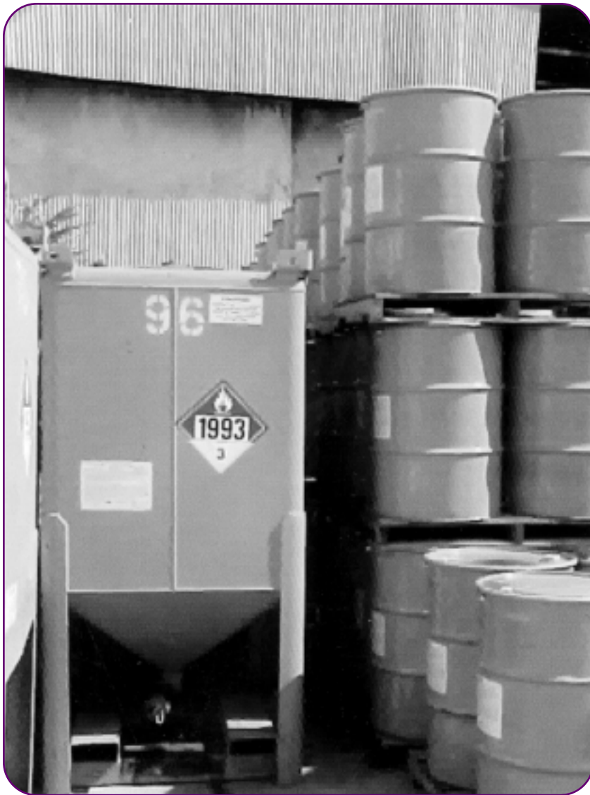
Photo 10: Special refillable 475-gallon containers eliminate disposal of used material containers.