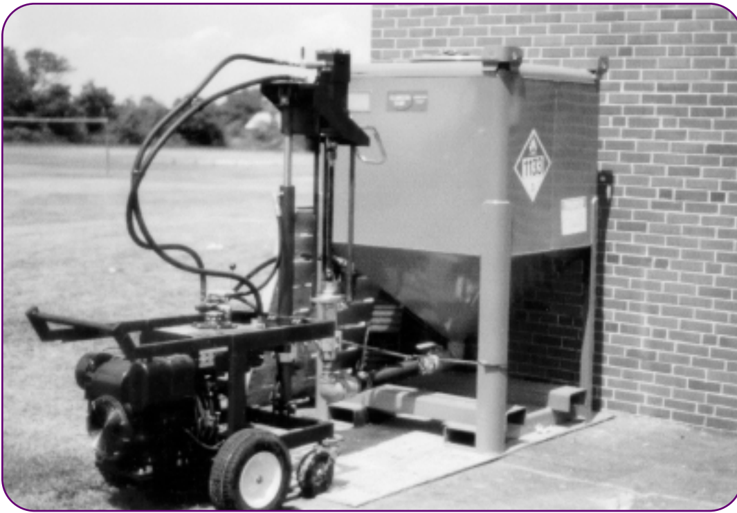
Photo 11: Larger containers facilitate shipment and increase job-site production.

warm the material prior to application so as to improve the spraying characteristics. The theory and practice of cold-applied BUR remains: the adhesive softens the coating on the roll and fuses the plies together as the solvent evaporates from the solids of the adhesive.