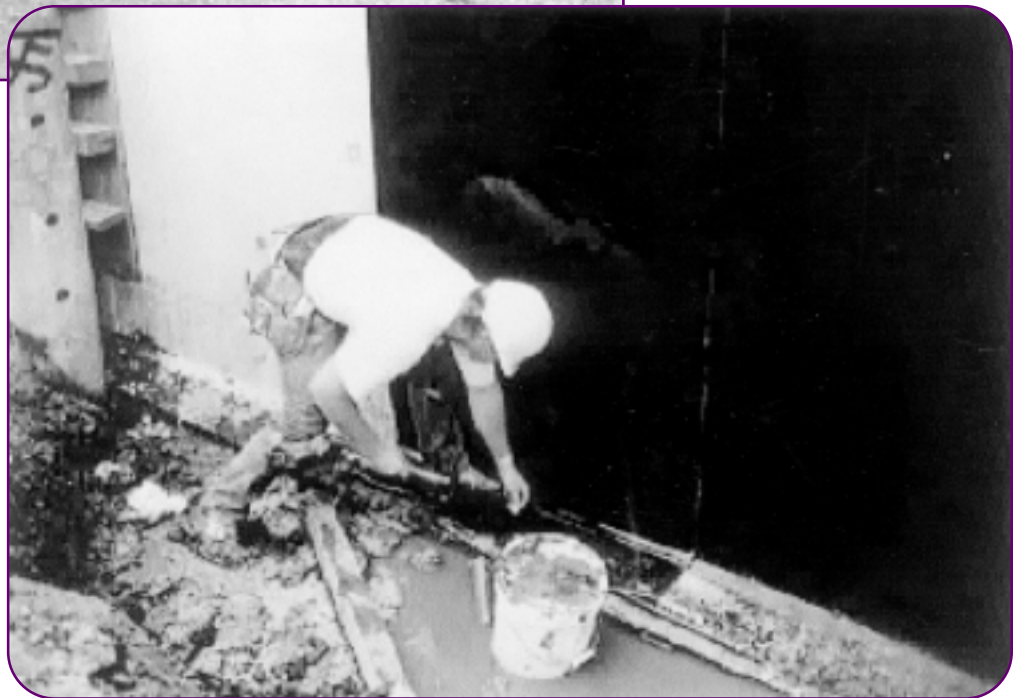
Photo 3: Workers can be exposed to heavier-than-air fumes from waterproofing products.

modified CTP formulations of trowel-grade waterproofing materials were in use throughout the 1970s and could be applied without the danger of burns. However, adequate ventilation or respirators were required due to the rapid solvent release of the materials. The CTP-based polyurethanes have disappeared from the marketplace due to environmental and health and safety concerns. The volatiles are intoxicating fumes and the CTP-based bitumen is a known carcinogen. Many manufacturers of below-grade waterproofing materials currently offer polyurethane-modified, asphalt-based formulations.