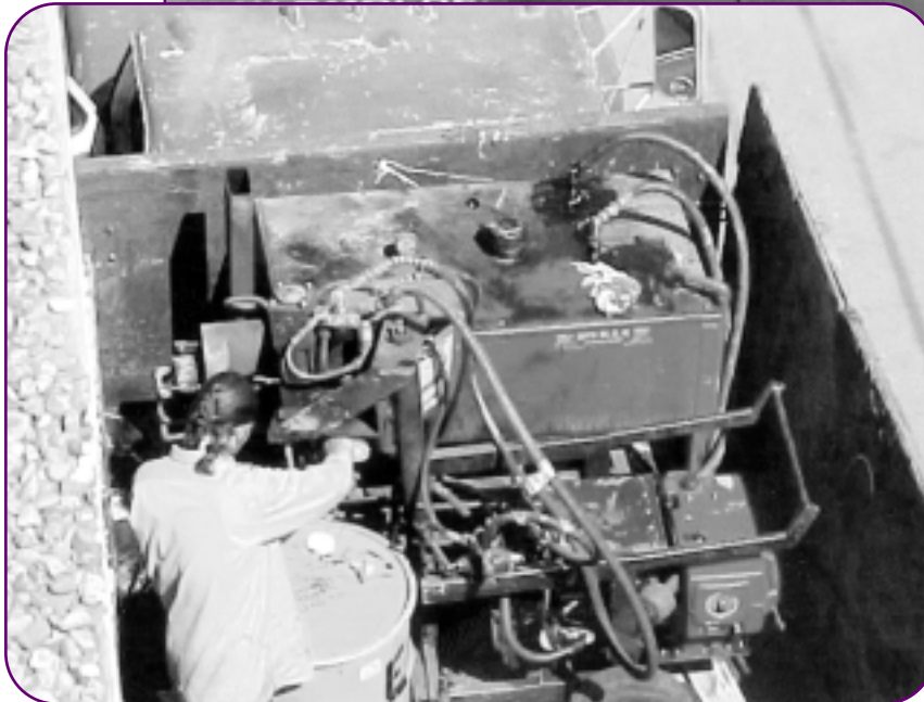
Photo 9: Warming the material facilitates spray application and increases production.

When a typical roof cut is examined, the core appears to be homogenous. It is difficult to discern the