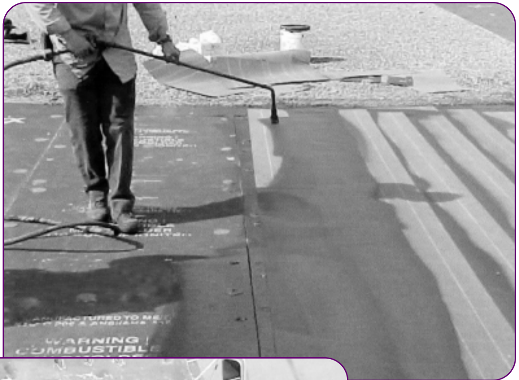
Photo 8: Typical application rate is 2.5 to 3 gallons of adhesive per square per ply.

Cold process adhesives do not function in this manner. The materials are applied at ambient temperature or slightly heated to facilitate application through spraying. Rarely does the application temperature reach 100 degrees F (38 degrees C.) See Photo 9. A cold asphalt cutback is modified