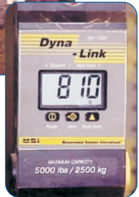
Photo 7: Uplift pressure is 202.5 lbs/sq. ft. based on 4 sq. ft. test panel.