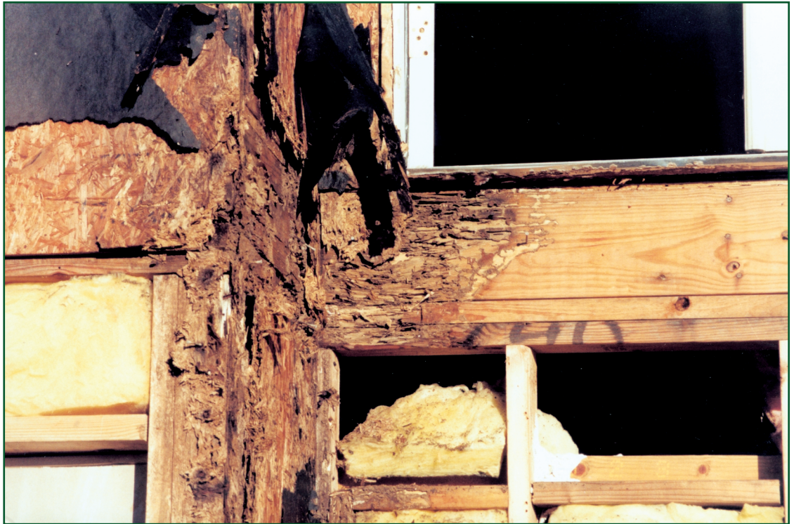
Photo 3: View of damages below a jamb/threshold intersection on a building clad with wood siding.

Entry doors and sliding glass doors can admit significant amounts of water behind a cladding system if proper waterproofing details are not present. The damages can be particularly devastating when large doors are used on walls with exposure to wind-driven rain. In these cases, the author has observed damages below the unsealed jamb/threshold intersection at the bottom corners of the door. This problem can be exacerbated when the door threshold is installed at the same elevation as an adjacent walkway, deck, balcony, or threshold if it is improperly integrated into the deck waterproofing system (Photo 3).