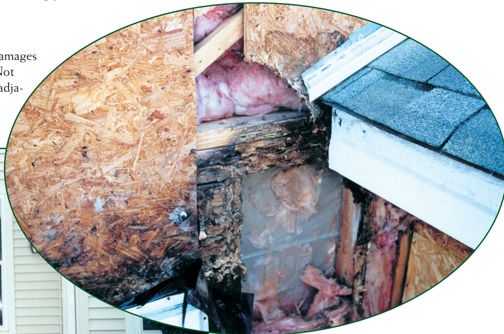
Photos 4 and 5: Views of significant damages below a roof/wall intersection on a building clad with vinyl siding.