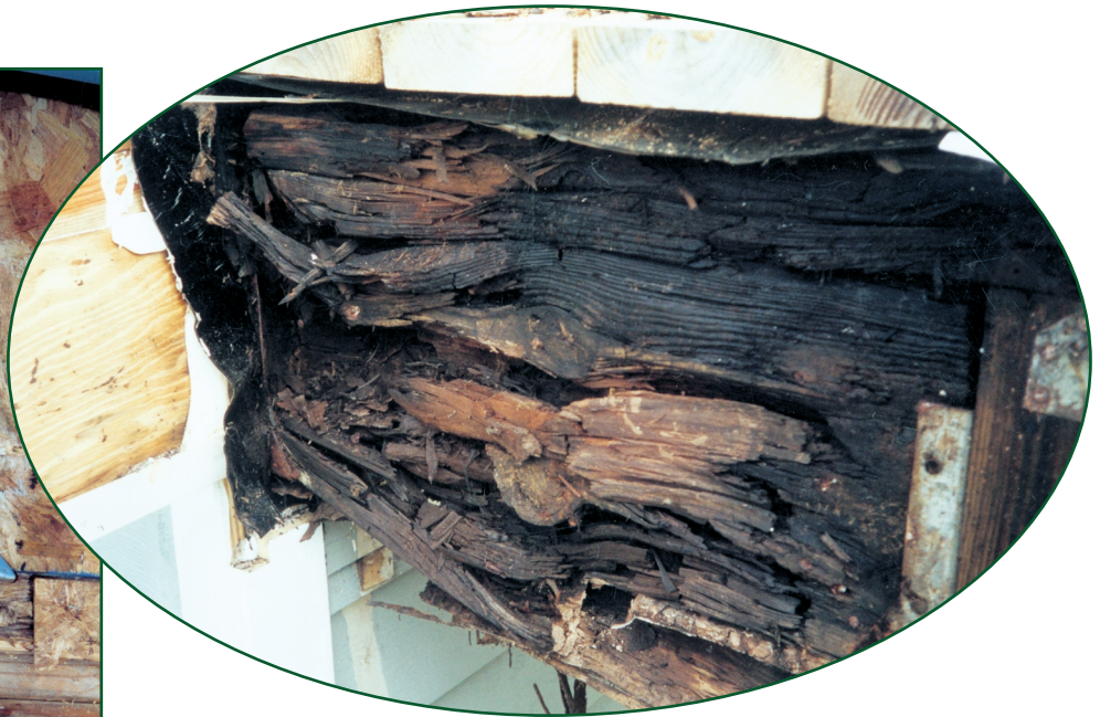
Photos 6 and 7 show water-damaged building components caused by improper waterproofing details at a deck. These buildings were clad with wood siding.

Waterproofing at roof/wall intersections is somewhat dependent on the cladding type. However, the waterproofing concepts are all the same. The adjoining roof and wall areas must be protected using underlayment (typically asphalt-saturated felt or self-adhering membrane). Additionally, metal flashing should be used to prevent water penetration and to divert water away from the wall assembly. This flashing detail is commonly referred to as a "kickout."