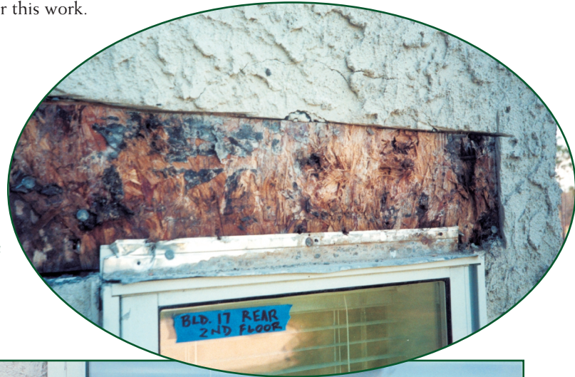
Photos 1 and 2: Views of damage above and below a window in a building with hard coat stucco.

Window rough openings should be properly wrapped. Head and sill flashing should be installed and properly integrated with adjacent building components (i.e., weather barrier). The American Society for Testing and Materials (ASTM) International Standard E 2112, issued in 2001, and the American Architectural Manufacturers Association (AAMA) Installer Training Manual , published in 2000, serve as excellent references for this work.