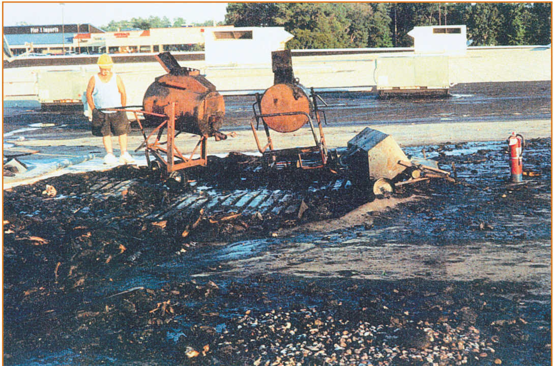
This fire at a large mall in the Southeast started as the result of spontaneous combustion of a roofing mop used earlier in the day.

the mop, and smoking of the mop begins. Under the right circumstances (mop head material, the mass of asphalt available, ambient air temperature, etc.), the mop will eventually catch on fire. If the mop remains on the roof or is adjacent to other flammable building components, this process can be disastrous.