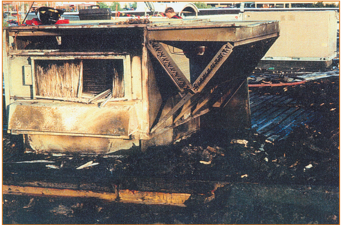
HVAC equipment on the roof of the mall destroyed by the fire.