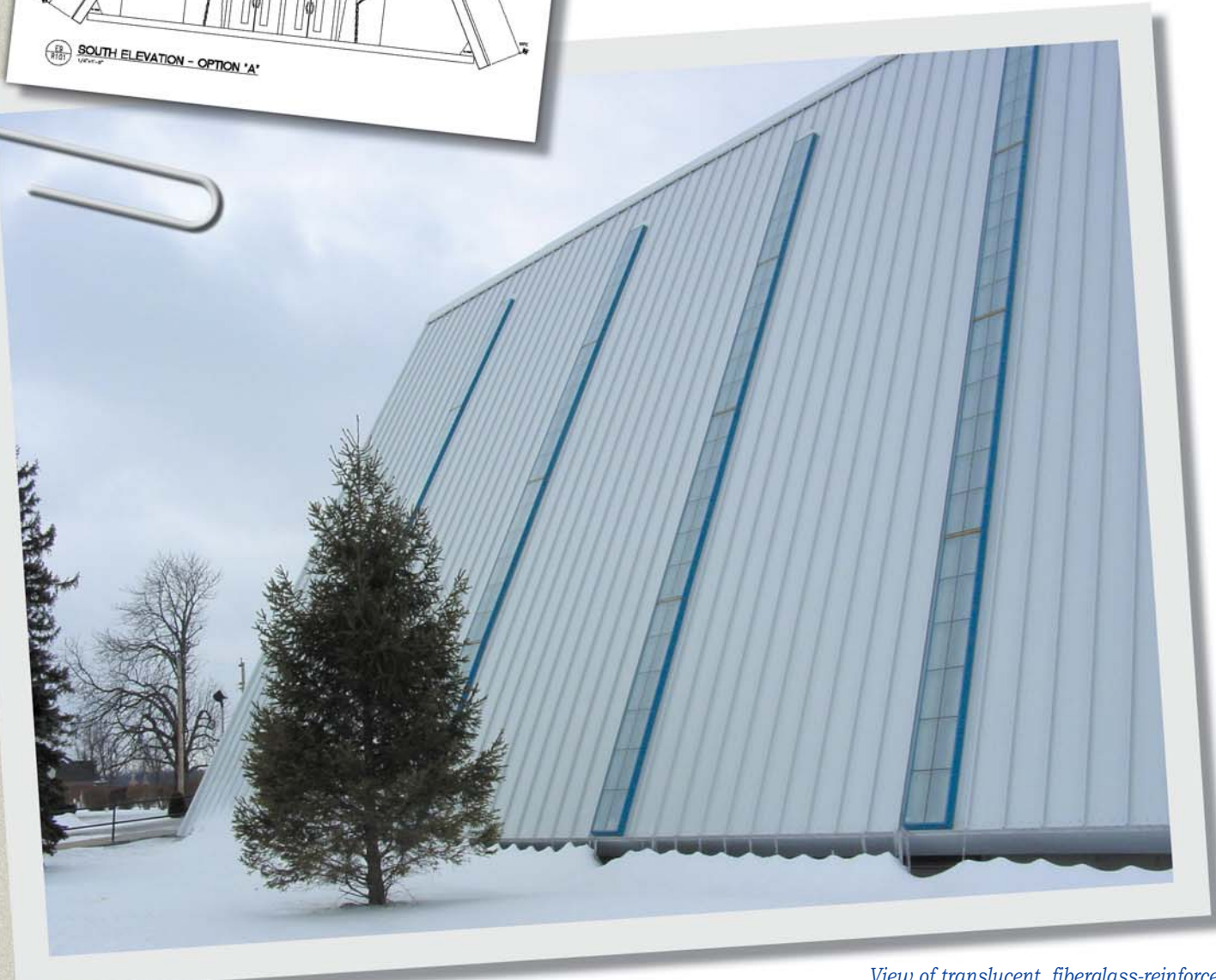
View of translucent, fiberglass-reinforced sandwich panel for interior light penetration.