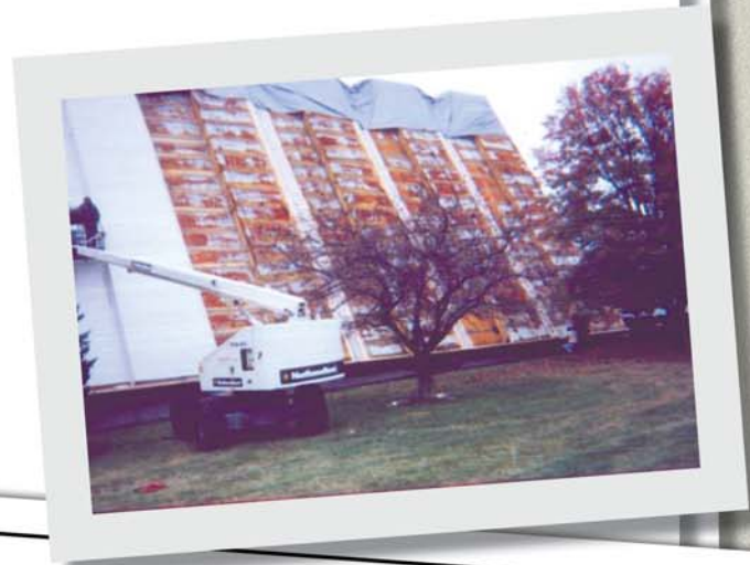
Removal of 8-foot-wide fiberglass panels and exposure of original sprayed polyurethane foam roof.

The retrofit design includes 1-1/4-inch structural steel members that run perpendicular to the slope at 5 feet, center-to-center. They span over the 14-inch depressed concrete pan-