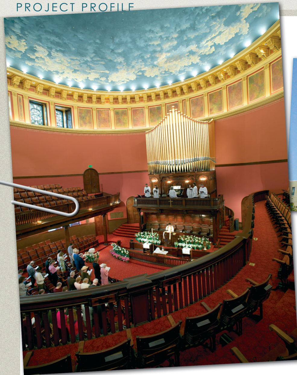
From the balcony, the overall effect can be appreciated.

building. Due to its cone shape, towered tile was used for that section of the roof.