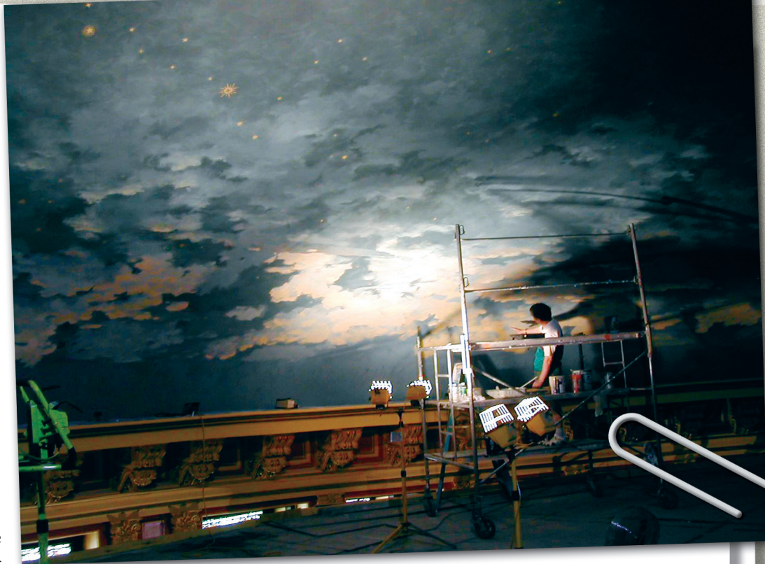
The stars were mapped onto the floor using a laser so their placement could be accurately recorded. They were then remapped onto the ceiling and painted.

Before work could begin on the mural, the exterior roofing needed to be addressed. The original tile had been removed 25 years earlier and replaced with a red-colored clay asphalt tile. The roof had reached the end of its lifespan by 1999. Using photos of the original roof, Kann and Associates was able to recreate what once was. Because the roof was part of the church's exterior, the congregation was able to access funds from a state his-