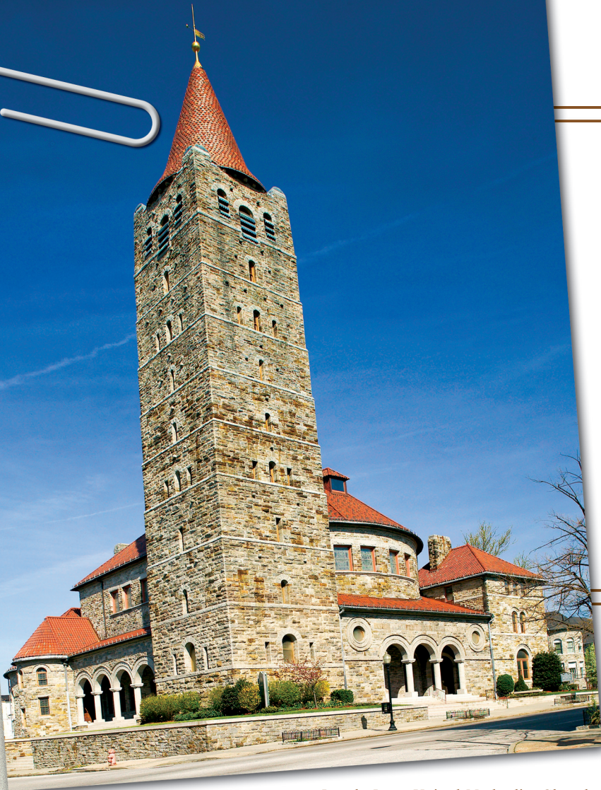
Lovely Lane United Methodist Church.

For the first time in 100 years, Lovely Lane United Methodist Church looks exactly the way it was first intended. Cherished for its historical, architectural, and spiritual significance, the restoration of the original 1887 building has been a 24-year campaign, requiring the combined efforts of a faithful congregation, accomplished craftsmen, and a dedicated architectural firm.