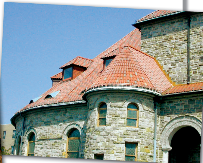
Below: The roof turrets were retiled in Spanish S tile by Ludowici.

leaf, faux marbling, and gilded stenciling finishes were also reintroduced.