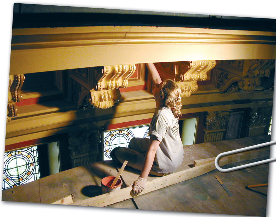
Painting the cornice.

Instead of using tapered tiles, six ribs were cut in each curve, creating five different segments of the roof. Standard Spanish S tile by Ludowici were used for the majority of the restoration, excluding the roof over the circular stair on the south side of the