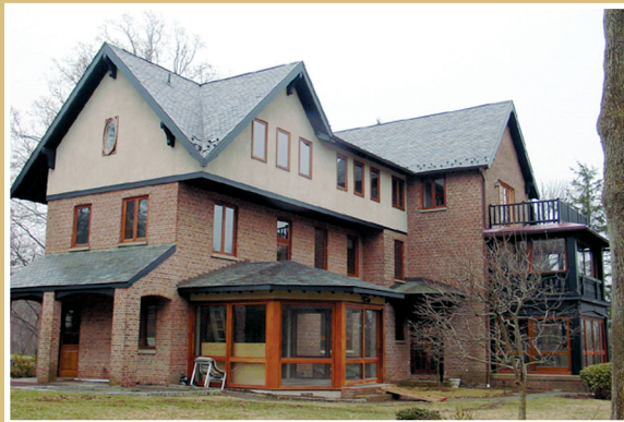
Ten-year-old slate roof on a private residence condemned by roofing contractors. The nominal snow guard damage, however, was covered by homeowner's insurance; the roof did not need to be replaced at all.