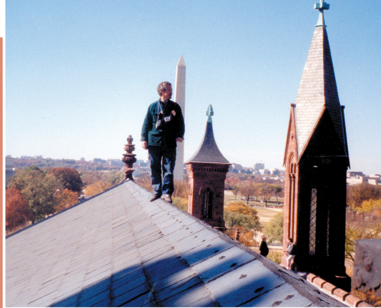
The Smithsonian Institute Building known as "The Castle" had already been replaced with new slate, but some of the original flashings had been left in place, and they leaked. The author is inspecting the roof in the photo above.

refurbished around the time of the bicentennial in 1976. At about that time, the Castle got a new roof. For some unknown reason, however, not all of the Castle's flashings had been replaced. Four main central valleys and the flashings along two parapet walls had been left as original, and they now leaked. Furthermore, the maintenance crew had the habit of tromping on the slate roof in what appeared to be combat boots, crunching the slates underfoot, breaking them, and adding to the roof problems. The solutions were simple and relatively inexpensive: replace the old flashings with new copper and keep people off the roof who don't belong there.