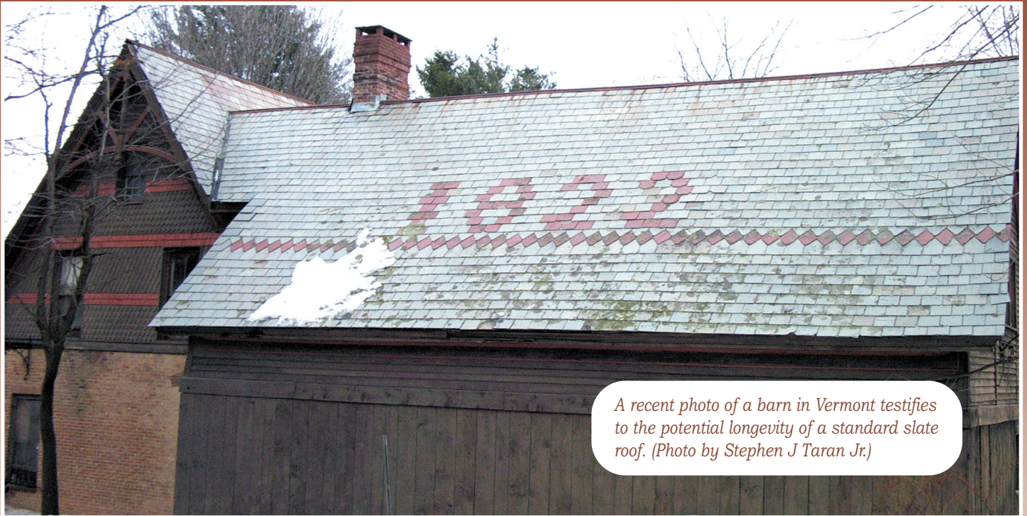
A recent photo of a barn in Vermont testifies to the potential longevity of a standard slate roof.