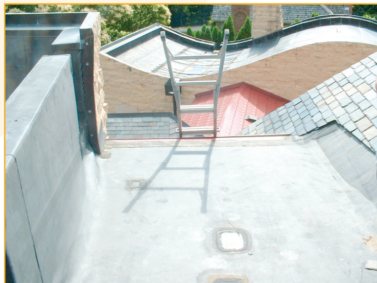
Photo 4. The roofing on this contemporary home has four different roof structures, each with different roofing and cladding systems. A roof consultant’s involvement may have increased efficiency for the design team during design and construction administration phases.

Green roofing systems require unique design considerations. Component proliferation is overwhelming. To many, a green roofing system is visualized as the finished appearance of an inviting garden or useable interactive pedestrian environment. To a roof consultant, a green roofing system is visualized as the membrane system performing for the long-term as the key characteristic with something aesthetically pleasing on top. Contrary to commonly held beliefs and some manufacturer literature, green roofs are not standard roofing systems buried under something supporting plant growth. Green roofing systems designed in this manner are doomed to premature failure. Membranes, drainage mats,