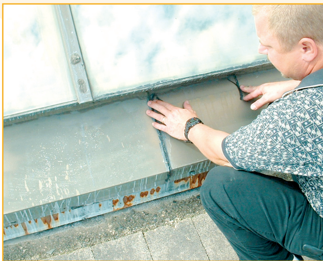
Photo 3. Roof consultants are extensively involved during the pre-design and design phases of a project. Here, an owner's representative is inspecting existing flashing details with a roof consultant.

While not qualified to perform the structural analysis required for a roofing system, a roof consultant is qualified, from a comprehensive viewpoint, to predict roofing