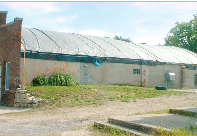
Photo 5. The ratchet straps on the barrel ends holding down the roofing are not clearly visible. Although an extreme case, the materials that are visible are FM- and UL-approved. Specification of approved materials is not necessarily a good assurance of performance.

insulations, overburdens, plant media, etc., all need to be carefully considered. All components must be compatible for the duration of the expected lifespan. Replacement considerations must also be carefully weighed. Replacement of green roofing systems (or overburden covered waterproofing systems) often exceeds $40 per square foot.