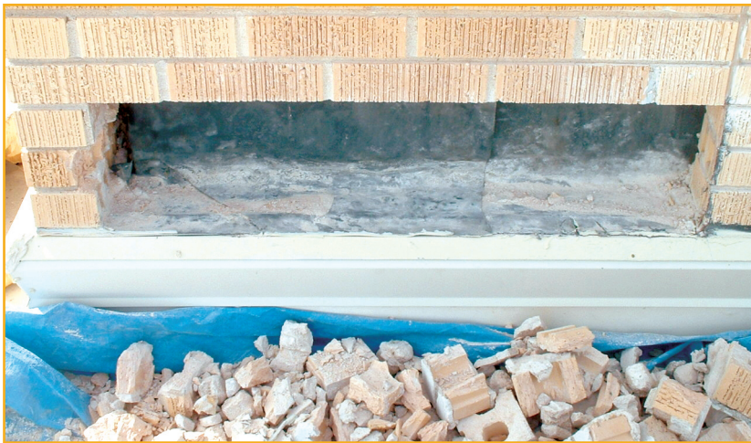
Photos 1 and 2. Remedial through-wall masonry flashing repairs are often expensive and disruptive to an owner's operations. Roof consultants routinely investigate and specify transitions between systems, such as roofing and masonry.