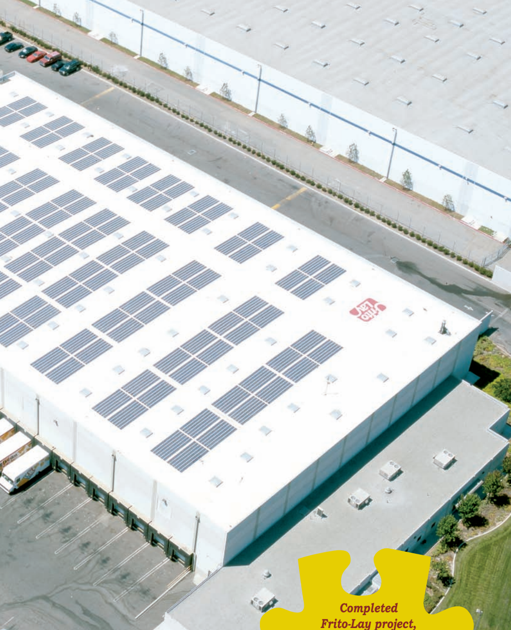
Completed Frito-Lay project, Los Angeles, CA.

So when Frito-Lay's Los Angeles Distribution Warehouse needed a new roof, it was no surprise that management looked for a way to not only replace the existing built-up roof with a durable, long-lasting alternative, but also to find a way for the roof to make their facility more energy efficient.