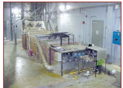
FM's Calorimeter in use.

without the use of an additional thermal barrier layer between the insulation and the supporting steel roof deck.