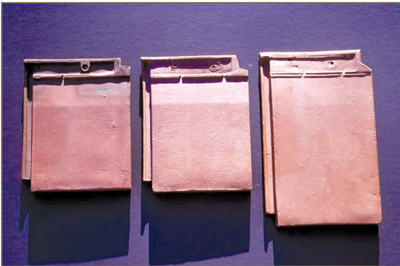
Photo 6 – The devolution of tile surface features: Three generations of tile from the same manufacturer show loss of surface articulation from a circa 1951 roof tile (left) to its later (center) and contemporary (right) counterparts. On the earliest tile (left), note the raised hub at fastener hole to protect fastener hole from leakage and deeper drainage channel (indicated by longer shadow from back leg of top channel). These features are muted or eliminated on later tiles to right.

grade by region. At a minimum, designers should adhere to the grade recommendations of ASTM C 1167. We recommend only specifying and using Grade 1 tile in northern climates, and whenever possible, we prefer to use Grade 1 tiles for increased durability in less severe climates.