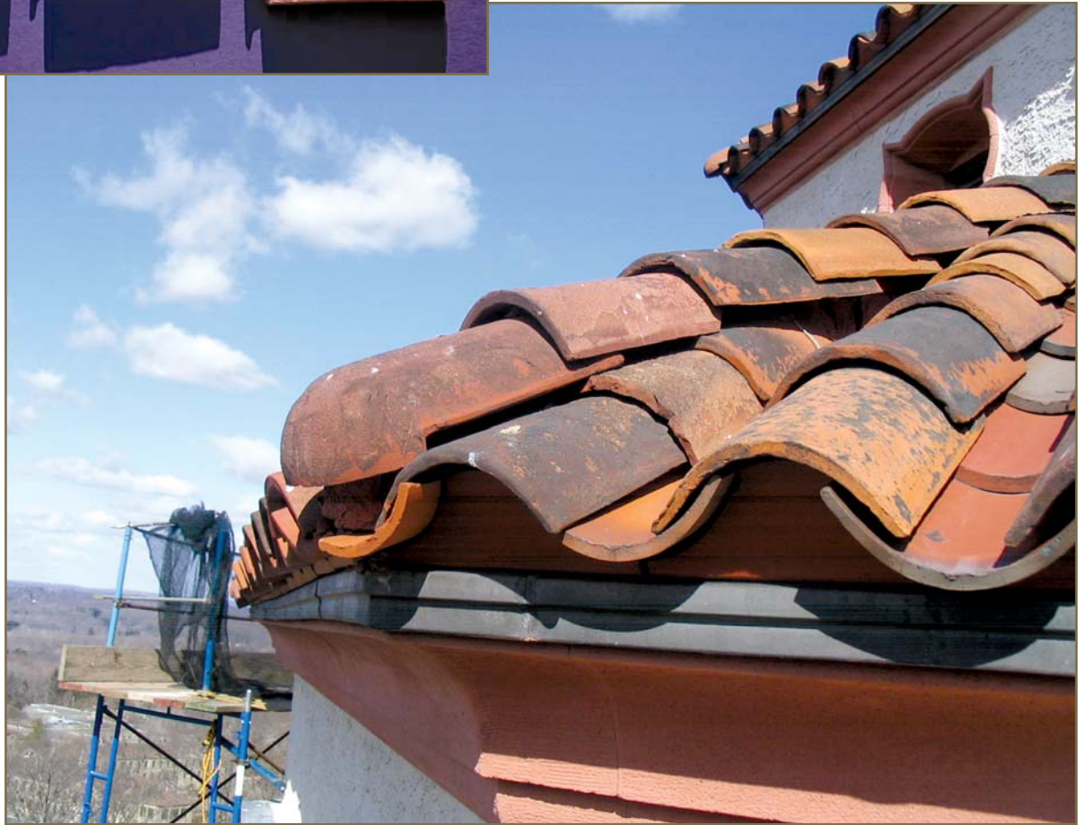
Photo 7 – Accessory tiles, such as the rounded hip closure tile shown above (or tiles for ridges, rakes, and starter courses) are often available from manufacturers for various tile shapes and styles. In some cases, these require special order and have considerably longer lead times than typical field tile shapes. Identify and order accessory or custom tile shapes early to avoid delays during construction.

Gateway requirements for the performance grades were established to limit the need for freeze/thaw tests, which may take ten weeks or longer to complete and are often too long to allow testing of the actual batch of tiles intended for the project, while still meeting construction schedules. We have found that these gateway absorption and saturation coefficients provide a good indicator of long-term tile durability under freeze/thaw weathering and general exposure. We have conducted laboratory tests on existing tiles that