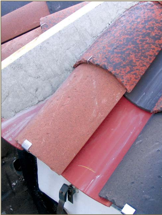
Photo 3 – Nose clips are used to resist uplift forces on tiles. The photo shows both a wire nose clip in the field of the roof (top) and a custom-manufactured nose clip along the roof eave (bottom). Custom-manufactured nose clips may be required to provide adequate stiffness and length to fasten above, rather than through, metal flashing along roof eaves.