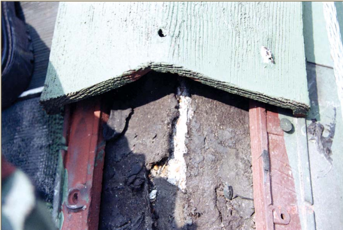
Photo 1 – Torn felt membrane underlayment. Asphalt-saturated felt embrittles with age and becomes prone to tearing.

brane underlayment sags into these voids and causes membrane seams to open, which leaves the membrane vulnerable to leakage. Further, out-of-plane irregularities and sharp edges of boards can cut or stress and prematurely wear membrane underlayments over time. In cases of skip sheathing or plank sheathing with wide gaps, we recommend covering with plywood to provide a smooth, clean, uniform substrate for membrane underlayment. For optimum adhesion of the membrane, prime the plywood and seal gaps between boards to prevent bridging and provide for continuous adhesion. Similarly, clean, prime, and seal gaps in tongue-and-groove sheathing prior to membrane installation for optimum adhesion and performance.