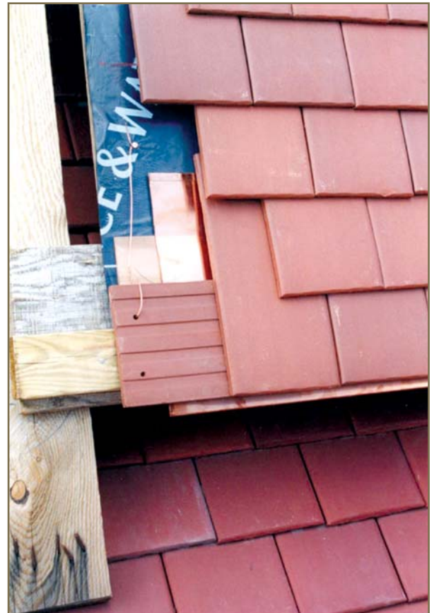
Photo 2 – Fastening eave and valley tiles (not shown) with wire ties can avoid penetrations through metal flashings, which would result in less reliable waterproofing performance.

On the other hand, mortars and mastics are traditional materials. Their traditional use was typically not as a primary means of attachment, but rather as a "hole filler" for edge tiles at rakes and valleys; to provide a closed, finished appearance; and to reduce nesting of insects beneath open tile edges. Mortars tend to have very limited adhesion to clay tiles. Mortar should not be used as primary clay tile attachment but can be used as a supplement to mechanical fasteners to reduce chatter and reduce nesting of nuisance insects (e.g. hornets, wasps) in edge voids. If left exposed or subject to water run-off, mortar may also produce unsightly white efflorescence staining. Mortar is also susceptible to freeze/thaw damage under these conditions and must be evaluated for durability when exposed to such conditions in service.