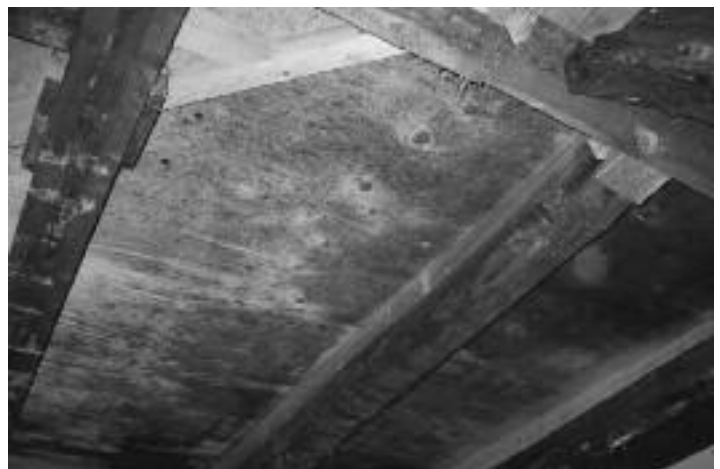
Figure 7 – Mold growth on plywood substrate for roofing felt in a ventilated roof due to sub-cooling caused by radiation to the sky. Plywood is more vulnerable to mold growth than boards, probably due to the treatment during production.

Quite a few of the most severe cases of mold growth in buildings have been caused by leaking floor coverings. The reasons might be either that the leak(s) is not seen until the penetrating water has caused additional damage, or that