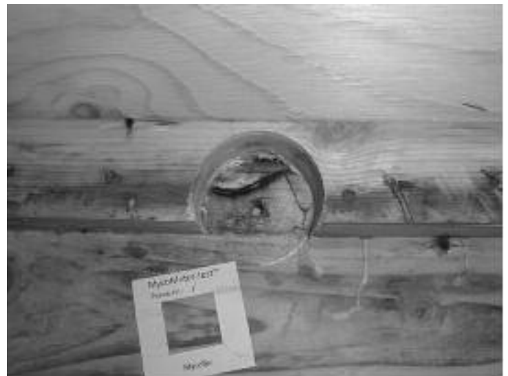
Figure 3 – Roof element in a new school with massive mold growth. The roof elements are prefabricated and meant to be sealed immediately after assembling. Lack of sealing, however, leads to penetration of water and eventually mold growth. The renovation included opening of the prefabricated elements, removal of insulation, and cleaning of the wooden surfaces in the elements. Afterwards, the elements were restored with new insulation and vapor barrier.

Crawl spaces often rely on a fine equilibrium between humidity supplied from the environment and humidity removed by ventilation. So, even small changes might change the equilibrium in an unfavorable direction. Increased humidity leads almost inevitably to growth of mold and, in severe cases, to deterioration of the wood. The failures are most often due to difficulties analyzing the complex changes in temperature and humidity occurring when a crawl space is insulated and/or the ventilation gaps are partly blocked.