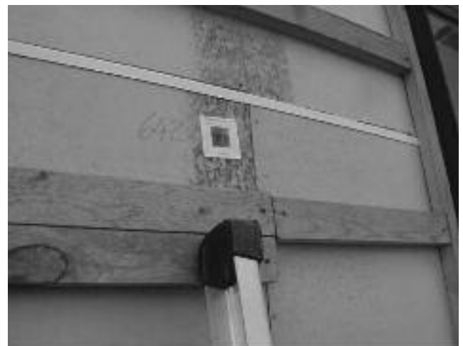
Figure 1 – Example of a ventilated façade with mold growth on the wind barrier (made by gypsum boards). Often mold growth in façades is due to water penetrating behind the cladding without being drained out (fast enough).

Mold growth in lightweight bathrooms is most often seen where a watertight membrane is either missing or is not made properly. Problems are often seen at details like joints between wall and floor and pipe penetrations. Any leaks in bathrooms provide excellent growing conditions, with favorable temperature and humidity for mold growth, and might eventually be followed by fungi and dry rot.