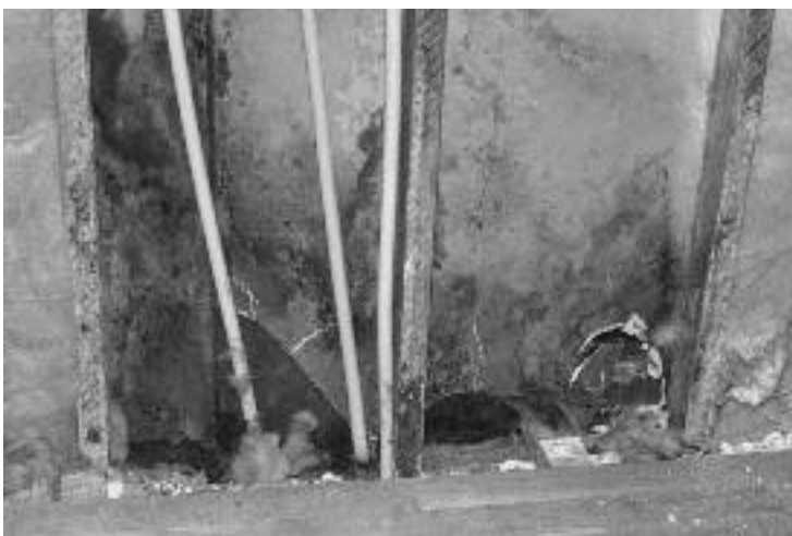
Figure 2 – Severe attack of mold on the backside of a gypsum board partition in a bathroom due to lack of a watertight membrane (the wall was tiled directly on the gypsum board).

During the last 30 years, many changes regarding roofs have occurred in Denmark. Some of these are due to still more strict energy saving measures now calling for the use of about 300 mm insulation in a roof construction. This naturally makes the outer part of the roofs very cold in winter, increasing the risk of condensation. Besides, new building components and materials have been introduced in flat as well as in sloped roofs, resulting in a number of problems. Typical examples are described below.