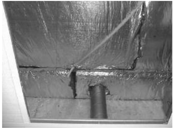
Figure 5 – Vapor barrier with leaks at joints and pipe penetration in a school. The entire school was built in the same way. The consequence was that there was massive mold growth in all roofs and that a major renovation was necessary to remove the mold.

In some cases, the vapor barrier is not installed until very late in the building process, i.e., after the entire roof construction has been completed. This allows for transportation of moisture into the roof. Especially in winter, the moisture might condensate when stopped by relatively vapor tight layers in the roof construction,