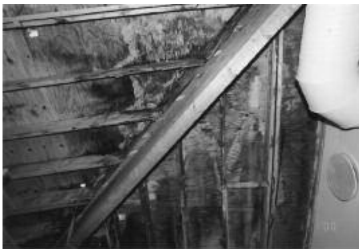
Figure 4 – Mold growth and deterioration of plywood in a sloped roof made from wood-based elements assembled in situ. Due to leaks in the interior joints between elements in the corners - and consequently also leaks in the vapor barrier – humid air has penetrated into the construction, where it condensates on the cold surfaces above the insulation.

Some constructions are capable of drying out moisture, but quite often, materials are too wet to dry out fast enough to avoid mold growth.