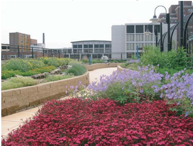
Schwab Rehabilitation Hospital - Chicago, IL (2005 Green Roof Awards of Excellence winner)

A "successful" green roof is one that stays watertight and looks great over time - not for just the first or second year, but for decades. American Hydrotech's Garden Roof® Assembly is based on more than 35 years of proven green roof technology and experience. Because it's designed from the substrate up as a "complete assembly", it's much more than just the sum of its parts.