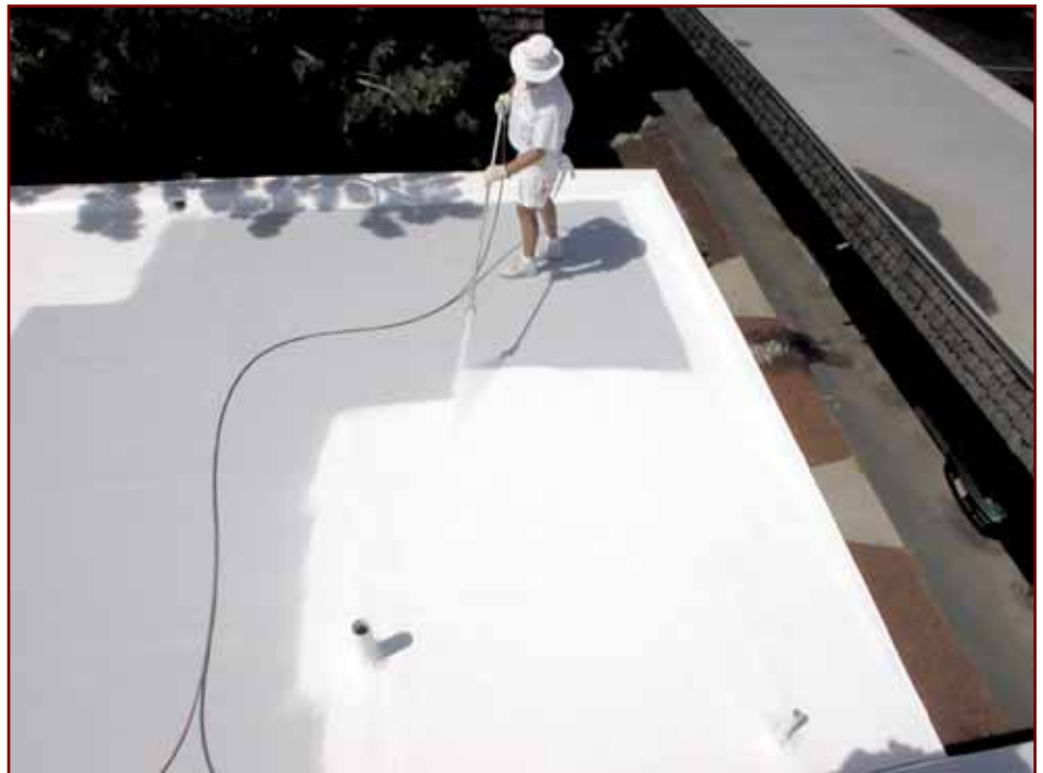
White coatings can be applied on many roof types, including this old BUR on an apartment building in Spokane, Washington. The white coating is sprayed over a base coat on top of an old built-up roof.

Protection Agency (EPA), in the Southwestern states, where the greatest solar resources are located, sufficient solar energy falls on an area of 100 miles by 100 miles to provide all of the nation's electricity requirements [7]. As we cover more and more of the earth's surface with buildings (and that means roof coverings), our choice of those materials determines how much of that heat and light will be absorbed and