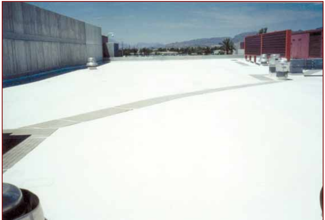
The granulated modified bitumen roof on this Intel facility in Chandler, Arizona, was coated with an elastomeric white coating.

The perm rating should not be confused with weatherability or resistance to weathering. A coating with low permeability still may require a protective topcoat to ensure satisfactory weathering resistance.