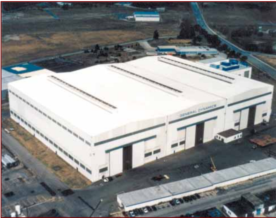
White coatings are appropriate for buildings in temperate climates, such as Groton, Connecticut, where such a product was installed over the metal roof of a General Dynamics facility.

stored through roofing in our buildings.