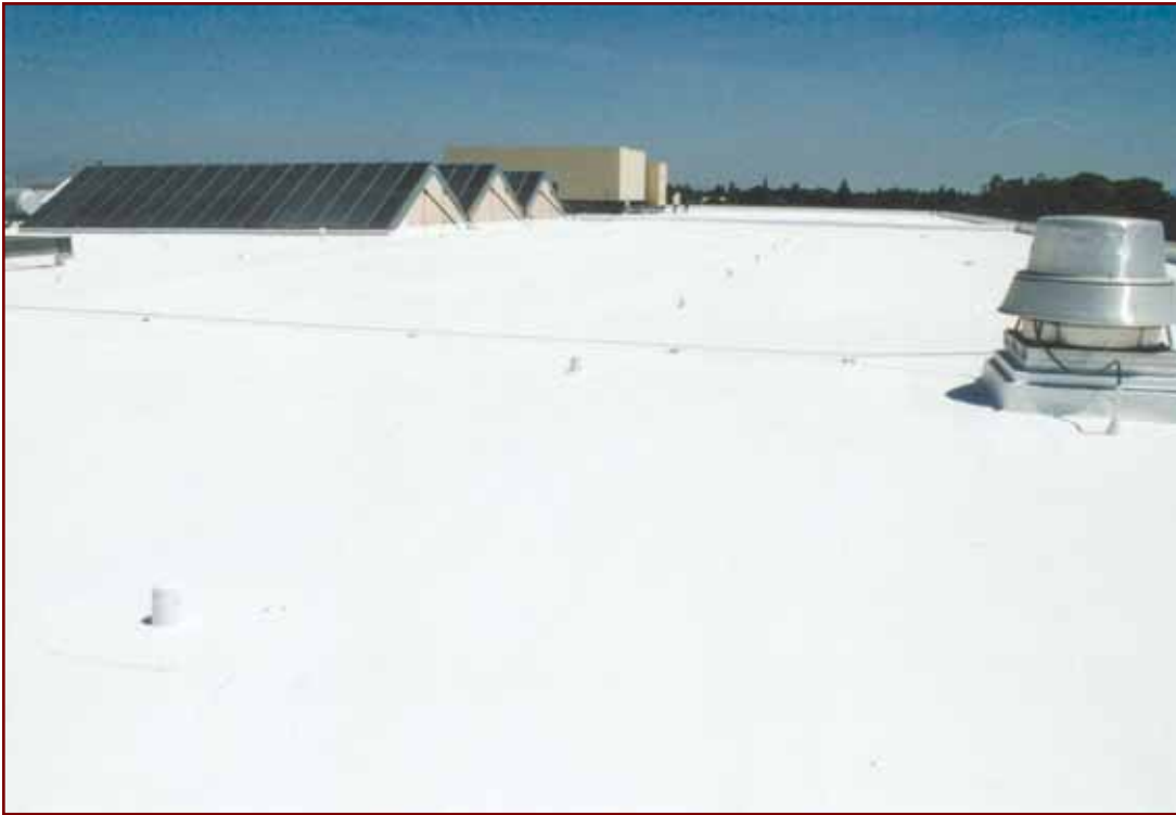
White coatings can provide reflectivity of 70 percent or more.