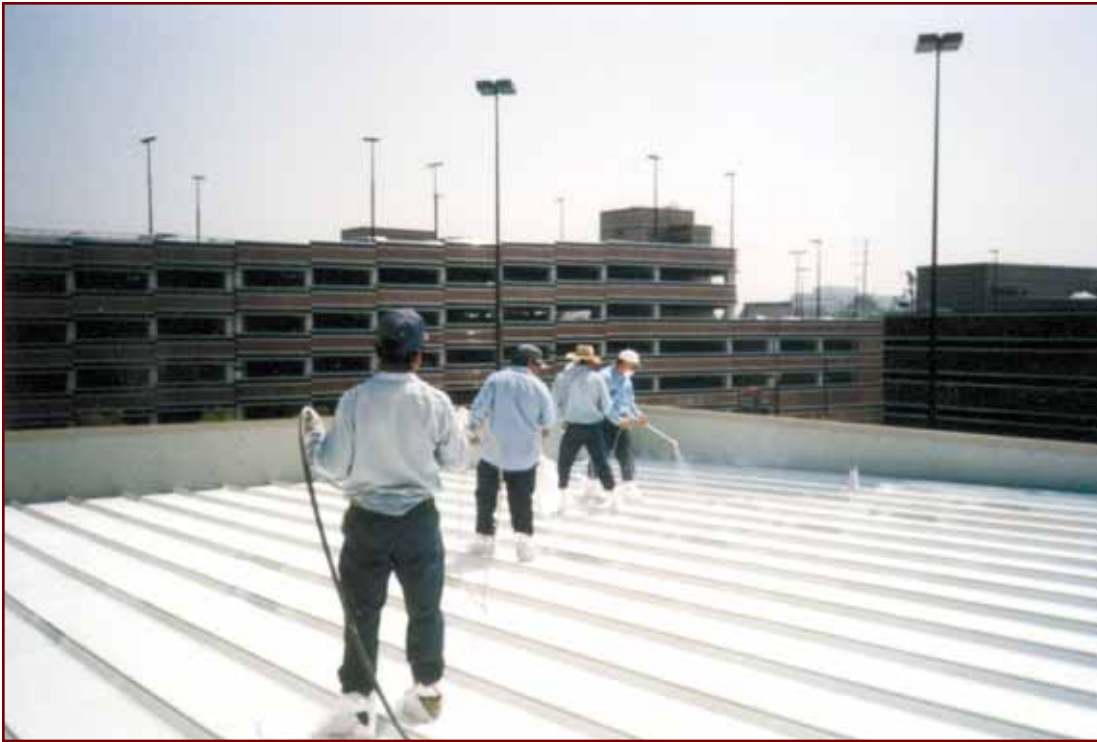
An elastomeric white coating is sprayed on this metal roof in Japan.