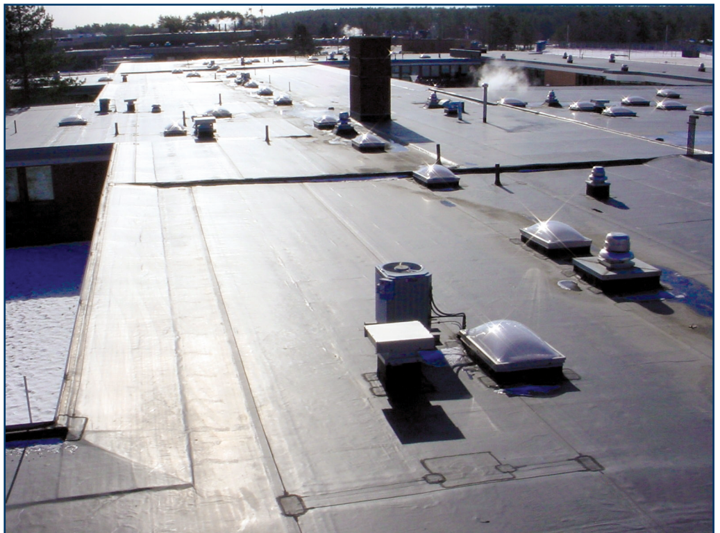
Finished view of Martinson Elementary School in Marshfield, Massachusetts. FleeceBACK applied directly over EPDM using FAST Adhesive made this roof as good as new.