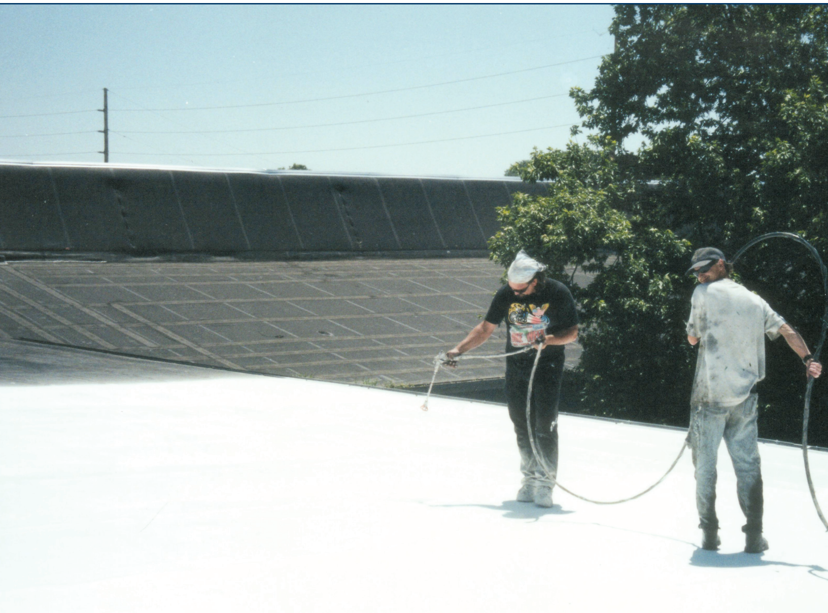
Acrylic coatings such as the one being sprayed on here can help extend the life of an old EPDM roof system

improved the coatings' weatherability, reflectivity, and long-term capabilities. These coatings often come with warranties that cover the products' reflectivity and performance, providing buildings with years of protection and extended service life.