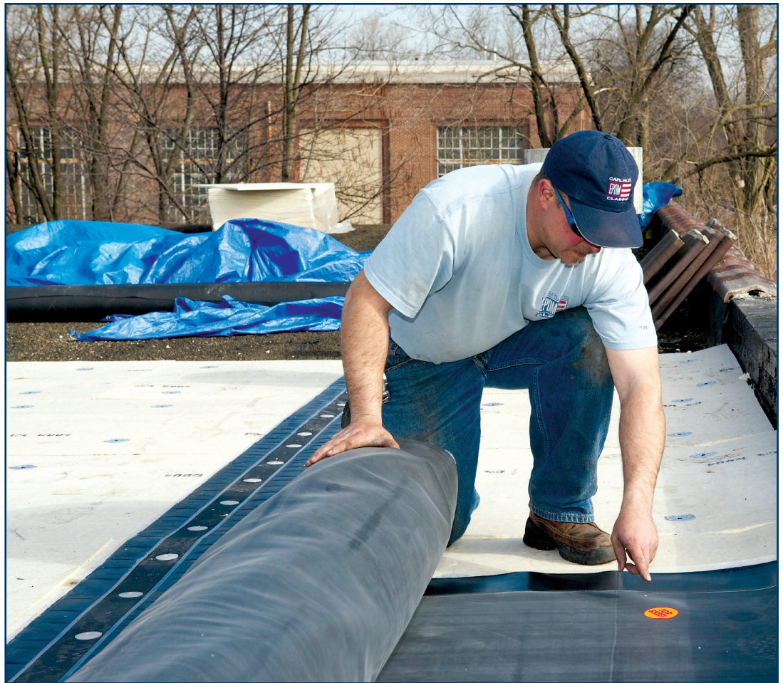
Cover an existing built-up roof and add thermal value by applying additional insulation under the EPDM membrane. The sheeting shown has factory-applied (seam) tape for faster installation with greater peel and shear strength.

In order to meet building owner needs, professional roof consultants are becoming fully educated on energy spending, environmental issues, and restoration choices. Each facility should be analyzed for a myriad of material choices and should be considered with regard to structure type and use. Geographic location of the building relative to cooling and heating degree days, surrounding buildings, wind, fire, the existing maintenance program, maintenance budget available for washing the roof, and insurance are just a few of the basic considerations that must be considered when determining how to address an aging roof.