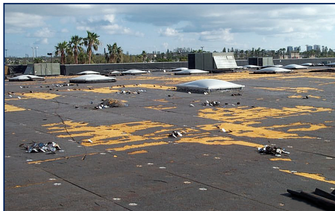
Failure started in the perimeter.

The key factor in any wind-load calculation is that the pressure across the entire roof is not uniform. There are higher pressures in the perimeter and corners of the roof. The perimeter can see a 68 percent increase, while the roof corners can experience up to a 153 percent increase—not small increases, to say the least. If the roof cover or roof deck is not designed for these higher pressures, the roof can be lost in moderate winds.