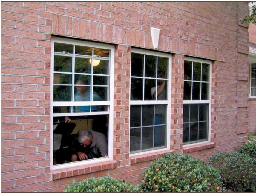
Photo 3 – Exterior view of a residential building with no obvious damage.

3 and 4), yet the entire wall assembly was built in accordance with building code requirements!