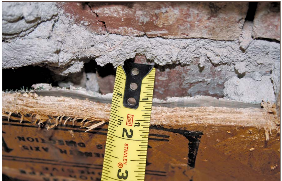
Photo 2 – A typical 1-inch air space ends up being reduced due to the presence of mortar and variations in wall framing and brick alignment.

To delete the use of a weather-resistant membrane makes no sense, even in the presence of an air space. The reality of construction is that the width of the air space will vary due to imperfections in