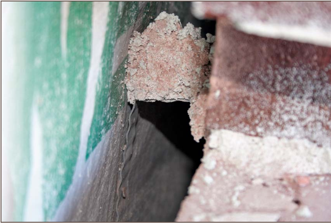
Photo 1 – Mortar droppings collect on top of metal brick ties and bridge across the 1-inch air space, coming into direct contact with a highly permeable weather-resistant membrane.

14 pounds per 100 square feet (0.683 kg/m 2 ) and complying with ASTM D 226 or other approved weather-resistant material shall be applied over studs or sheathing of all exterior walls as required by Table 703.4.