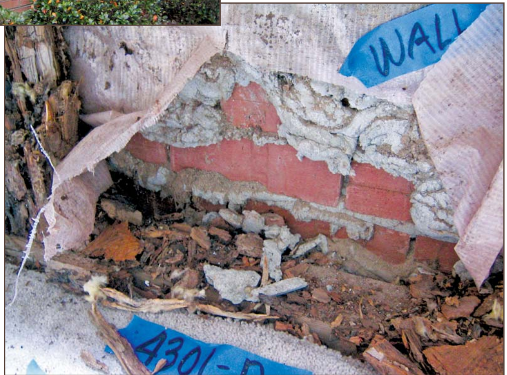
Photo 4 – View of the interior side of the wall shown in Photo 3 that was exposed during destructive testing. Both the exterior wall sheathing and dimensional wood framing members were rotten. An interior-side vapor barrier was placed behind the interior drywall.