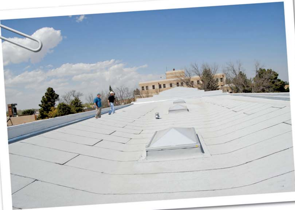
A cold-applied SBS modified bitumen roofing system was specified to replace an aged, badly damaged, and leaking built-up roofing system on the historic Lister Building.