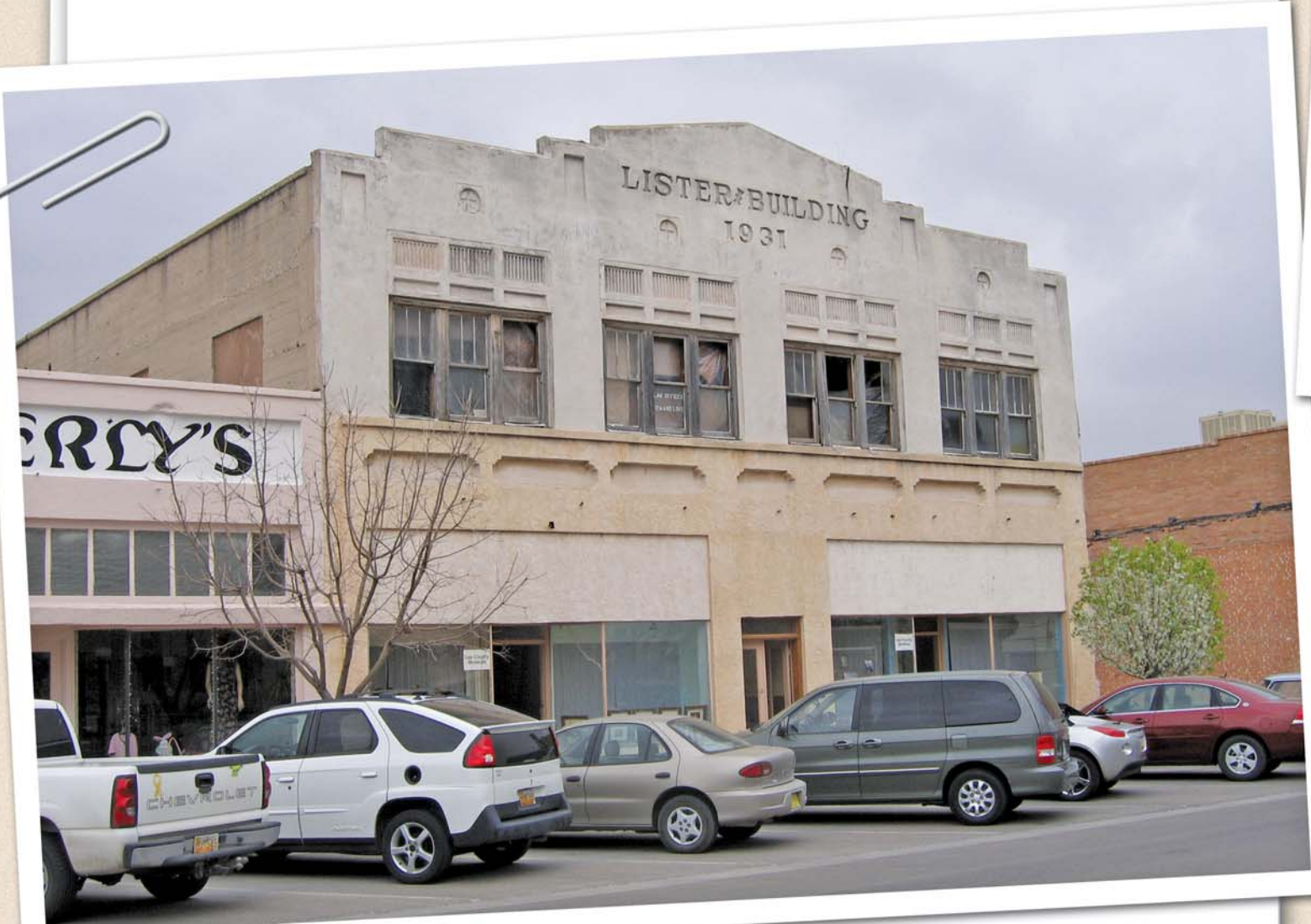
Built in 1931, the Lister Building in Lovington, NM, features a decorative façade that includes parapet walls ranging from 3 to 7 ft high.

floor will serve as the Lea County Athletic Hall of Fame and also house an oil and gas exhibit and a town meeting hall. The upstairs will house exhibits reflecting the history of Lea County, including '30s and '40s law offices.