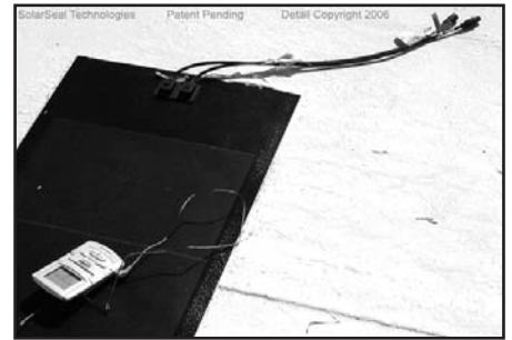
Figure 6 - SolarSeal system over SBS membrane with Uni-Solar PV module.

The SolarSeal System is the only universal roof-integrated photovoltaic system that can be applied to either new or existing roofs, including asphalt-based roof systems and single-ply roof systems.