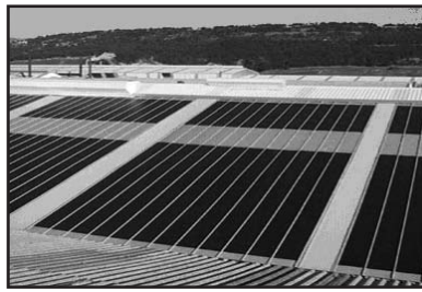
Figure 3 – Uni-solar metal panels with thin-film photovoltaics.

Metal roof R-panel roof systems with overlapping seams and exposed fasteners or metal roof panels with stiffener beads or striations have been limited to traditional equipment-mounted glass modules. SolarSeal Technologies created a new solar roof system by combining certain elastomeric coatings and different inter-ply construction elements with flexible thin-film photovoltaics to bridge the metal-roof profile and exposed fasteners while creating a flat substrate for the PV modules. The SolarSeal System creates a monolithic membrane with the