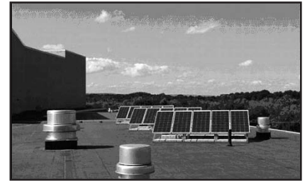
Figure 1 – Crystalline silicon array on the New York State Energy Research & Development Authority's Voorheeville, NY, school.

A number of new photovoltaic technologies have begun to emerge into the marketplace.