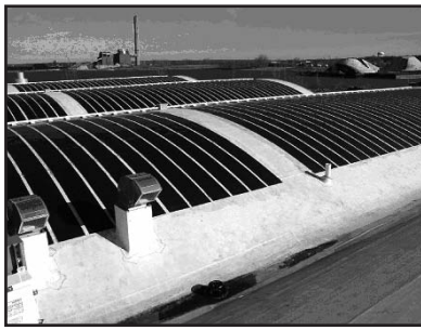
Figure 2 – Flexible, thin-film photovoltaic module at Grand Valley State University, displaying Uni-Solar thin-film solar cells.

Thin-film photovoltaics cost less than silicon modules. Average cost, depending on the type of semi-conductor material used and if the module substrate is glass or polymer-encapsulated, is between $3.00 and $4.24 a watt. 2 Power production per sq ft varies between manufacturers; the solar industry tends to price product cost by watt rather than per sq ft,