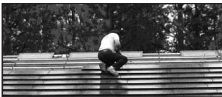
Figure 7 - Solar shingles by Open Energy.

that blends invisibly into concrete tile roofs. GE Solar makes 18 single-crystal cells connected in a series module with a peak power of 55 watts at 8.4 volts and has a unique interlocking design for concrete tile applications. Sharp-Solar offers polycrystalline silicon modules with 62 volts of output. Open Energy makes a poly-crystalline tile type module that comes in brown, red, and black colors. Atlantis Energy Systems makes a slate type tile that works well with flat tiles and slate roofs.