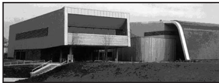
Figure 8 - Solar wall at the main elevation of OpTIC, showing the cantilevered business center and 1,000m 2 PV wall array.

Right now, wall and window systems are very specialized. As the pricing of solar systems continues to drop, more building wall and window systems will start to incorporate solar into more traditional wall and window building products.