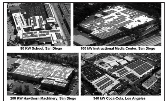
Figure 4 – Solar Integrated Technologies' thin-film laminated roofs.

With the SIT system, a new single-ply roofing system is applied to the roof. The new single-ply roof system can be mechanically fastened or fully adhered. The factory-laminated single-ply membrane and flexible PV module is then installed directly over the new single-ply roof system and hot-air welded in place. On partial roof installations, photovoltaic laminated single-ply membranes can be adhered to the existing roof substrate using polyurethane foam as an adhesive, double-sided tape or bonding adhesive. In most cases, these partially attached system applications are not waterproofed. The SIT system patent ended last year, and several other commercial roofing manufacturers are expected to bring similar solar single-ply roof systems into the market over the next two years as