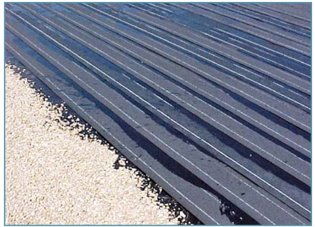
The layering technique for applying the reinforcing plies, topped with aggregate embedded in a flood coat of coal tar roofing pitch, maximizes the life span of this roofing system.

Prior to the application of a restoration coating or new flood coat and aggregate surfacing, all necessary repairs should be made, including replacing any wet insulation and replacing or making appropriate repairs to deteriorated parts of the roofing system, typically matching the original system to the greatest degree possible. If the restoration (coal tar resaturant, coal tar polymer coating, or flood coat and aggregate) is going to add weight to the system, then consideration should be given to whether the existing structural components can handle the additional load. After the preliminary preparation has been completed, the surface receiving the restoration coating must be dry and free of any dirt or loose debris. The rates and procedures of application vary between coatings and manufacturers. Typically, the loose aggregate is removed from the surface, the coating or new flood coat and aggregate is applied, and new aggregate is embedded.