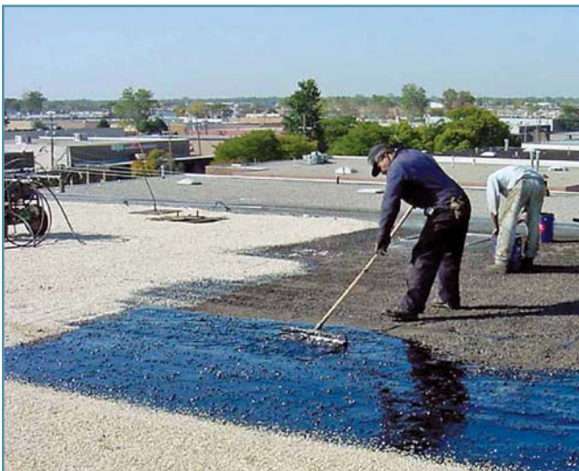
Workers applying a roof restoration coating.

Until recently, coal tar and asphalt built-up roofs (collectively referred to as BUR systems) represented the norm in the low-slope commercial roofing industry for more than a century. Technologies, including single-ply and polymer-modified bitumen (mod bit) membrane systems, have attracted a significant portion of this market. Most of these systems present a type of innovative change, though often, an innovation in one area compromises another. For example, systems that demonstrate an easier and faster installation often cannot match the long-term performance of systems that may take longer to install. On the other hand, a newer system, designed for long-term performance, typically carries a higher cost. Although customers would like the best of both worlds, building owners, specifiers, and roofing contractors will continue to be challenged to determine the true value of a roof and compare that to cus-