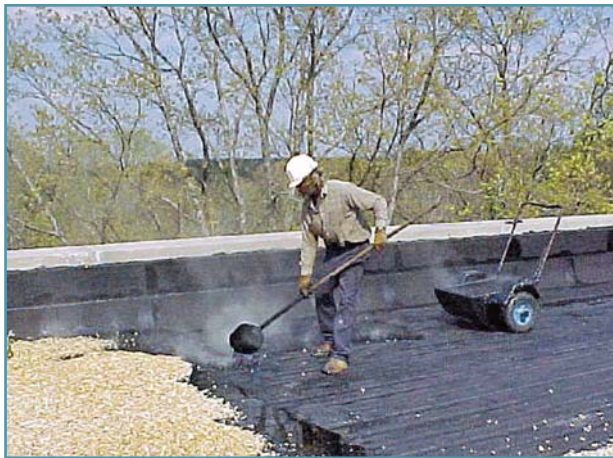
A worker applying a hot flood coat onto a BUR system.

The top surface of a roofing membrane is the weathering layer. A key attribute of