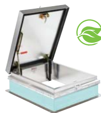
Enhanced Performance Added insulation for superior energy efficiency

Whether your project is in a hurricane zone or not, you can rely on the durable construction and time-tested performance of Bilco roof products. In addition to being the only manufacturer that offers Miami-Dade approved roof hatches, Bilco has a complete line of hatches to meet all your roof access needs.