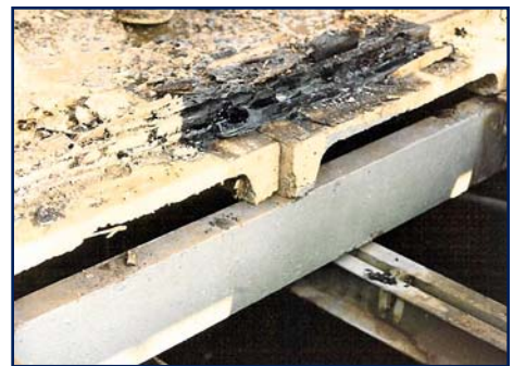
Figure 7 – Channel-crete is a reinforced concrete product, although it is neither prestressed nor posttensioned. Span capability is derived from internal steel tendons embedded in the “legs” of the plank.

Precast planks have a distinct fastening limitation. The thin part of the product (most of the surface) can be as little as 1¼ in thick. While structural grade concrete is used (3,000 psi compressive strength and sometimes beyond), this thickness dimension falls short of the necessary embedment for concrete anchors. The author has witnessed some foolhardy attempts to fasten a