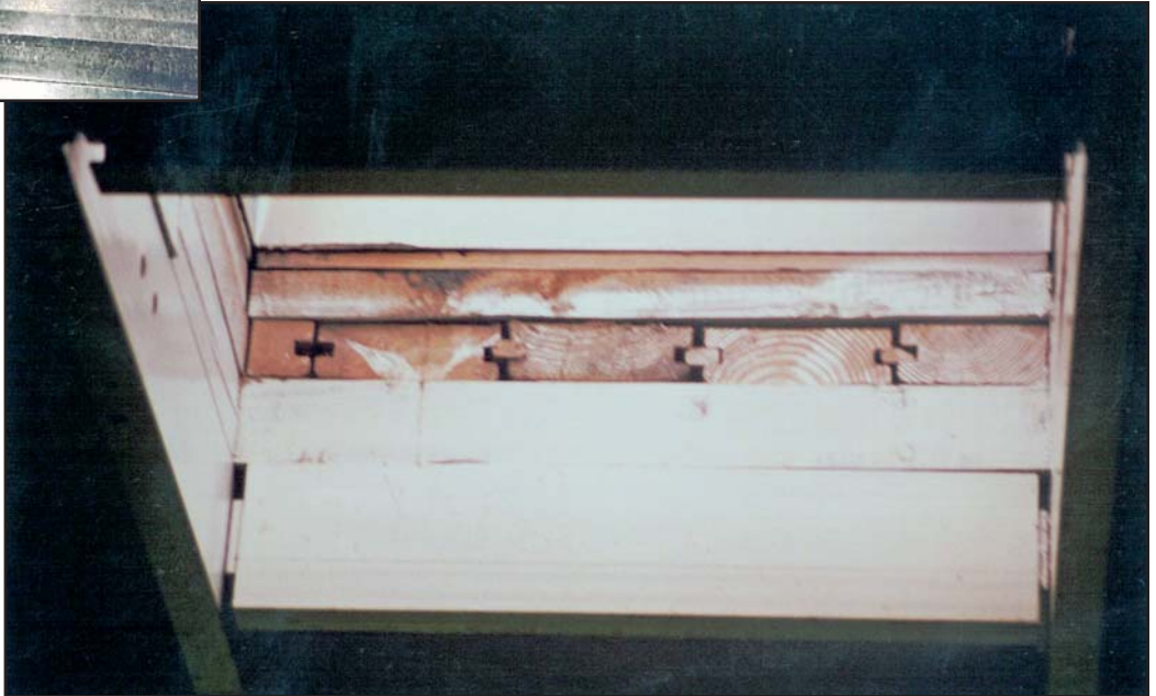
Figure 4 – Shrinkage of planks may be observed where decks have been in service for decades.