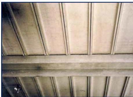
Figure 9 – Channel-crete may also be installed over a structure made entirely of concrete. The use of hold-down clips is crucial.

entirely absent on older decks, as the focus was on downward load capacity rather than uplift resistance.