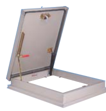
Replacement Easily mounts to an existing curb without re-roofing