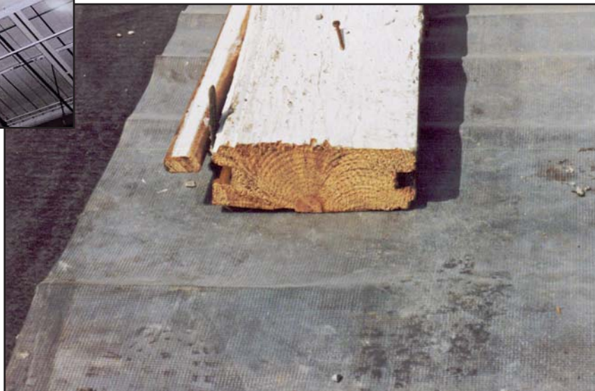
Figure 2 – Wood plank decks are commonly tongue and groove, but they can also be “splined” in the manner of heavier industrial wood floors.