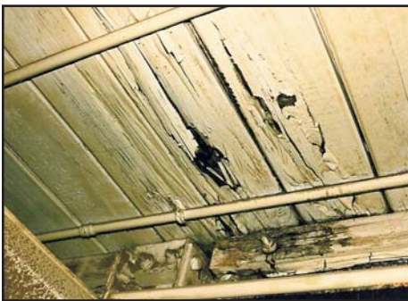
Figure 5 – Inexcusable procrastination in addressing leaks can reduce a functional wood deck to a fall-through hazard. Underside paint can obscure this behavior during interior inspection, so be aware of this potential when preparing contract documents.

Inexcusable procrastination in addressing leaks can reduce a functional wood deck to a fall-through hazard (Figure 5). Failure to mitigate leakage can sharply reduce load-carrying capacity. Paint on the underside can obscure this behavior during interior inspection, so be aware of such potential when preparing contract documents for reroofing.