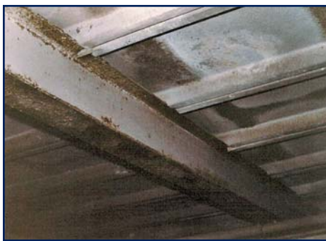
Figure 8 – Channel-crete may be installed over a steel framing system.

Repairs are usually done as a replacement in kind, but maintaining edge integrity is paramount when such work is carried out. Figure 6 depicts restoration using sheet metal straps that are stitch-screwed to adjacent members. Consideration must also be given to the hold-down mechanism for securing replacement planks to framing elements. Note that modern loss-prevention measures were in their infancy (or nonexistent) when some vintage plank decks were installed. The hold-down device may be