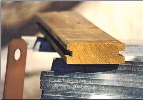
Figure 3 – Although mostly found in older facilities, matching lumber planks are still available from certain mills.

with this layer in place, many choices of insulation and roof covering are available.