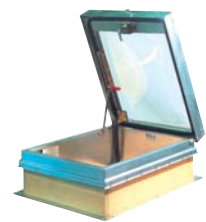
Natural Daylighting Convenient roof access with the benefits of a skylight