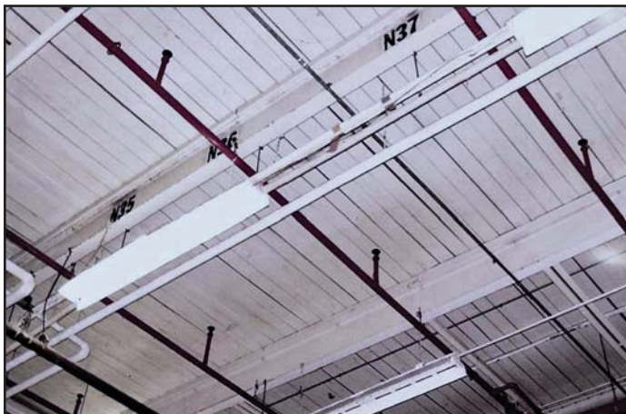
Figure 1 – Wood plank decks are common in older warehouses, textile mills, and heavy manufacturing settings. Unless badly neglected, they are very durable and accept fasteners remarkably well.

The long-established practice of using a nailed base sheet is still legitimate on these decks. This is handy when a particular environment merits a vapor retarder. A nailed base sheet—using proper fasteners and stress plates to increase base-sheet pullover resistance—will provide a fine substrate for virtually any type of vapor impedance layer. As with other “nailable” decks,