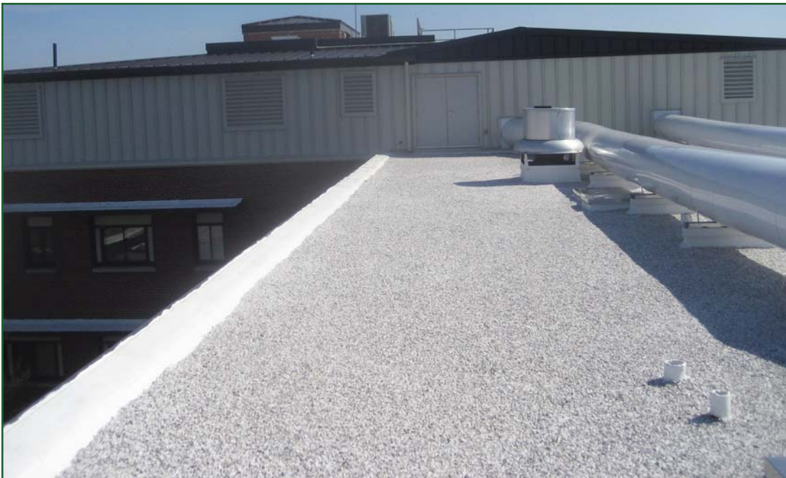
Photo 3 – Modified-bitumen roofing materials may include a wide range of bio-based resources, including but not limited to post-consumer scrap from recycled tires incorporated into the roofing compound; preconsumer crushed porcelain incorporated into the filler; renewable soy-based oils, bio-based resins, or crushed sea shells substituted for petroleum-based resources in the compound; and pre-consumer recycled boiler slag used as the surfacing.

mentioned 20% of bio-based content, roof coatings must be ENERGYSTAR®-qualified 6 and listed by the Cool Roof Rating Council (CRRC). 7