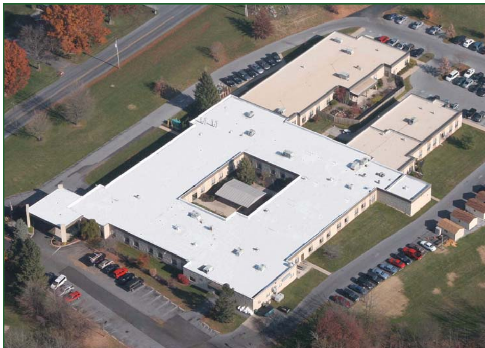
Photo 2 – Only a few years ago, a cool roof coating was considered a creditable “green” material; today, unless bio-based materials have been substituted for fossil-based resources, “cool” may not be enough.

The industry has made it a priority to eliminate VOCs and Hazardous Air Pollutants (HAP) from coating formulations. Biosolvents derived from vegetable oils, plants, and starch can gradually replace petrochemical solvents in roof coatings, thereby