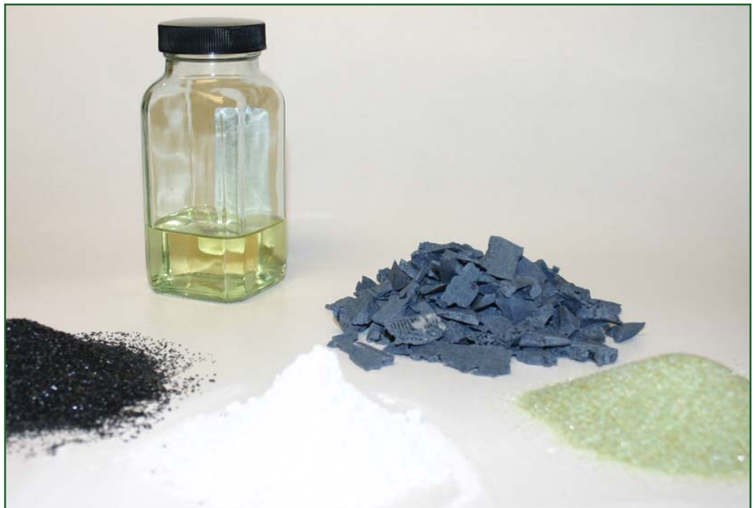
Photo 1 – Boiler slag, methyl soyate, postconsumer recycled tires, postconsumer recycled glass bottles, and oyster shells are some of the many bio-based materials being used for today’s next-generation roofing materials.

While bio-based materials can include nonfood products that come from biomass