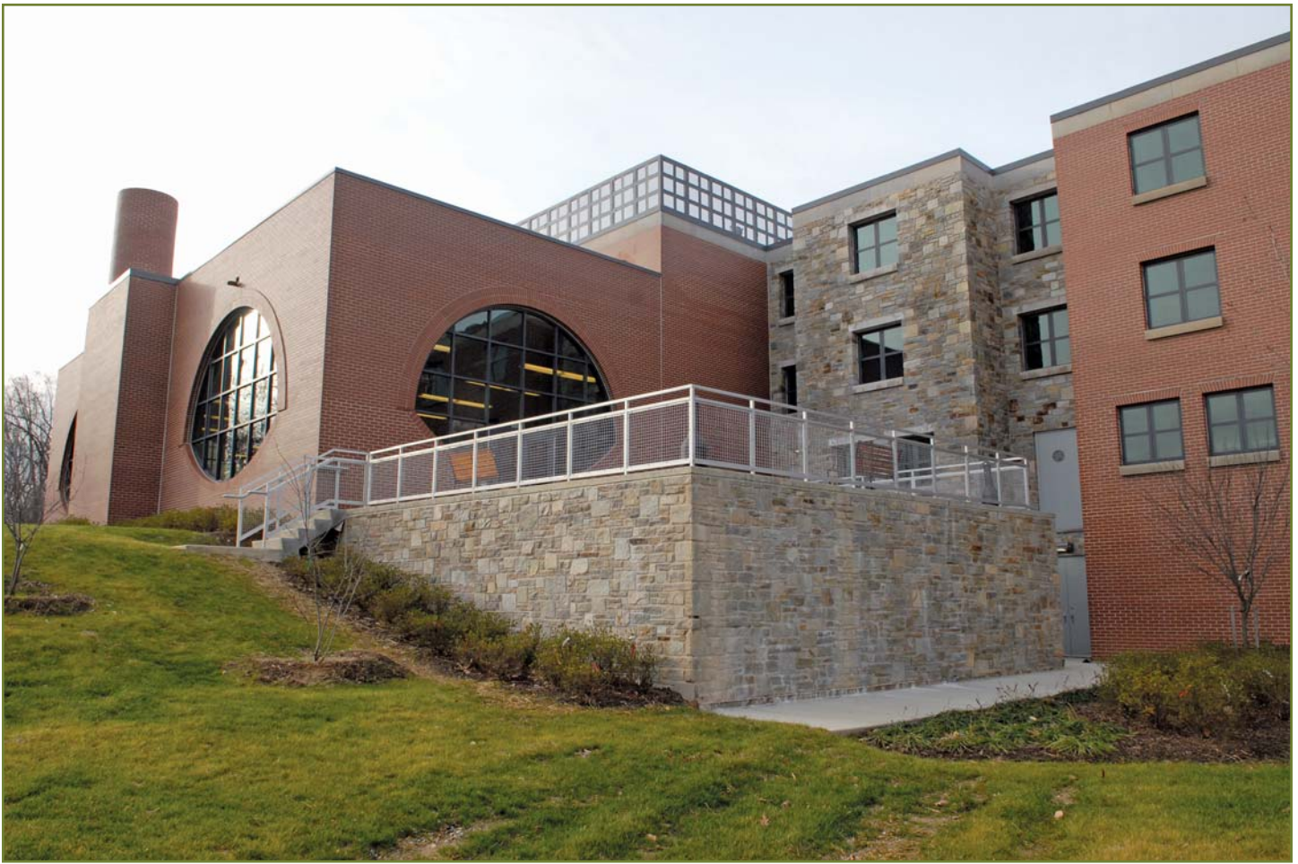
Creativity and structural masonry went together well at the International Union of Bricklayers and Allied Craftworkers/International Masonry Institute (BAC/IMI) John J. Flynn International Training Center in Maryland. The building was designed by Stanley Tigerman, FAIA.

increase” option, and more. These provisions are included in the 2012 IBC. Consider using these most current provisions when designing with ASD.