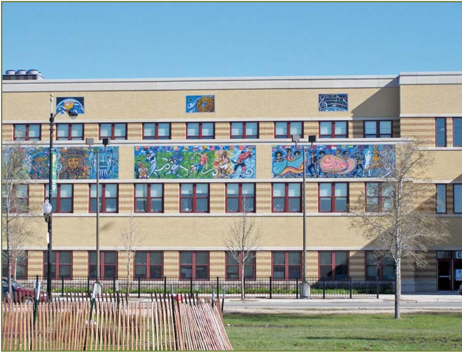
Chicago's Orozco Fine Arts & Sciences Elementary School received strength and beauty from masonry that offers a smart investment.