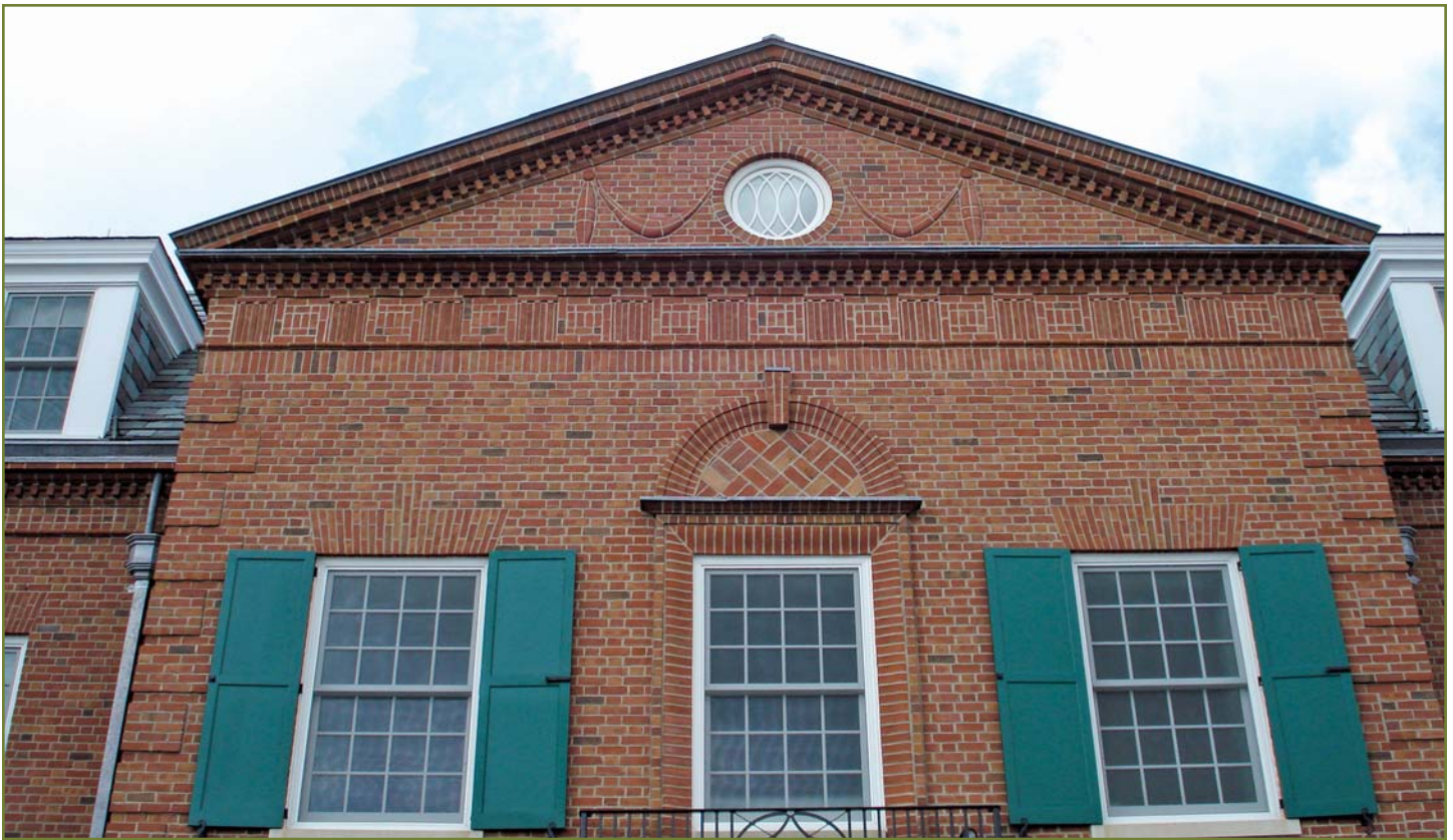
The Hotchkiss School dormitory (also shown on page 15) demonstrates the versatility of load-bearing CMUs. They support the structure and form the backup for the brick veneer.

The information in this article is an updated version of an article that originally appeared in the October 2009 issue (Volume 62, No. 10) of The Construction Specifier, the official magazine of the Construction Specifications Institute. For more information, visit www.constructionspecifier.com .