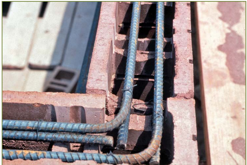
This close-up photo shows the corner of a heavily reinforced structural brick masonry wall.

Further, unlike conventional grout, SCG needs neither rodding nor vibration for consolidation. In fact, the requirements in the MSJC Code and Specification prohibit con-