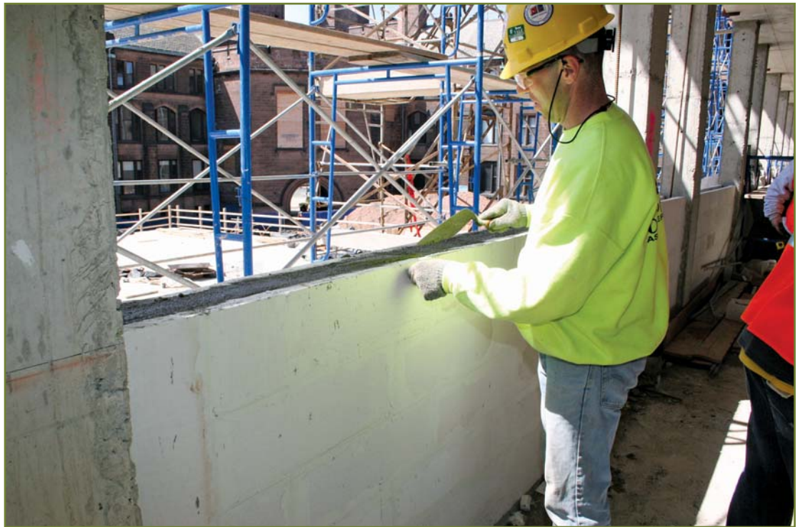
For the Yale School of Forestry and Environmental Studies' Kroon Hall, high-strength autoclaved aerated concrete (AAC) was chosen for the reinforced backup.

Not one of the more well-known ASTM masonry standards—ASTM C1586, Standard Guide for Quality Assurance of Mor-