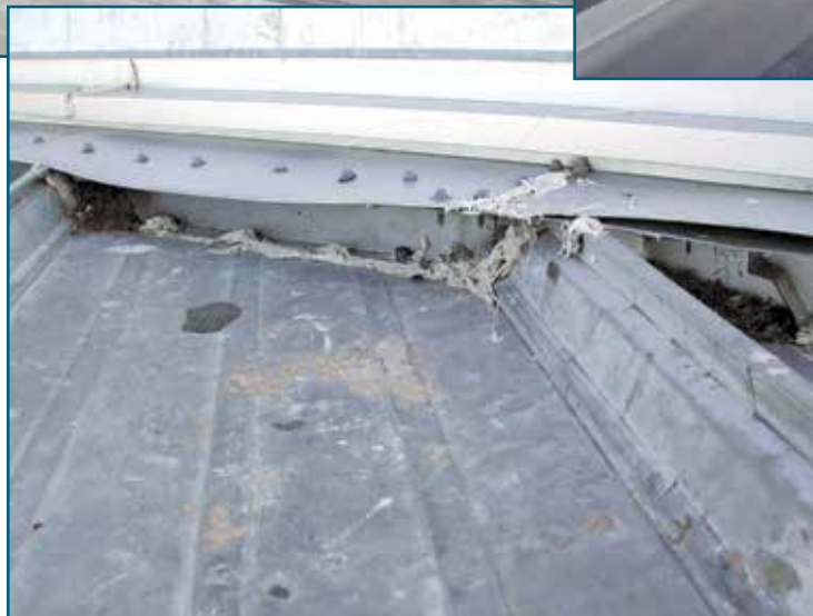
Figure 5 – Trapezoidal panel closure in a diagonal application.