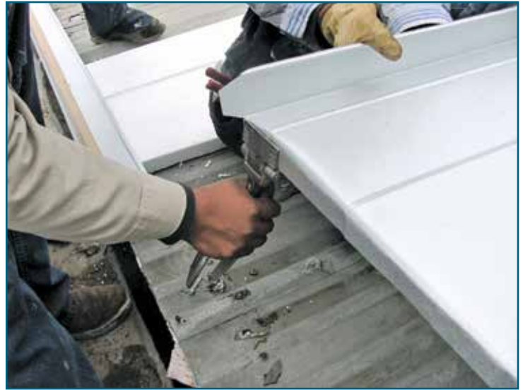
Figure 7 – Vertical-rib panel with end folded down at the eave.

When using a vertical-rib panel on a low slope, it is best to fix the panel at the eave and allow it to expand toward the ridge. This