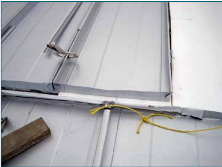
Figure 10 – Panel “bread panned” at ridge prior to installation of closure and ridge cap.

and up the other side, leaving a hole in the roof behind the curb that runs all the way to the ridge (Figure 13).