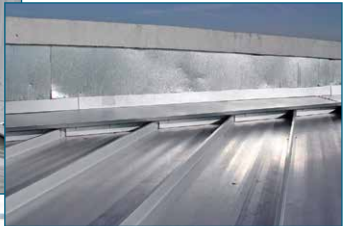
Figure 6 – Vertical rib panel with diagonal closures.