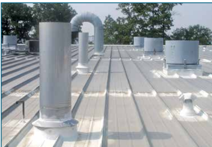
Figure 1 – Typical low-slope industrial standing-seam metal roof with end laps, curbs, and evidence of previous attempted repairs.

The roof in Figure 1 has it all: open bar joist installation with five 40-ft.-long panels that are lapped together end to end, covering a 200-ft. span, large penetrations that were installed with the roof on the right, new penetrations that were added later on the left, and a liberal application of caulk