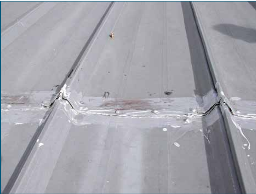
Figure 3 – 24-in.-wide by 3-in.-tall trapezoidal standing-seam roof panel with end lap.

Also, while the shape of the seam lends itself nicely to preformed closures at the ridge, it is a hindrance if the panel has to be cut on an angle for a hip or valley condition. In those conditions, it is much more difficult to make a watertight joint between the closure and the panel seam than a vertical-rib panel. Finally, large curb penetrations can be custom made to fit a trapezoidal panel seam, but these panels rely on exposed fasteners penetrating through the roof at all of these conditions, opening up opportunities for water infiltration.