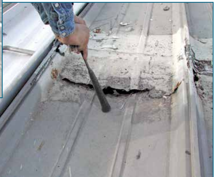
Figure 2 – Coated end lap caused ponding water, which resulted in rust-through.