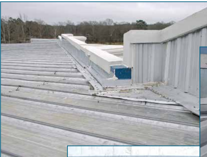
Figure 4 – Diagonal headwall on trapezoidal standing-seam roof.

trapezoidal panels, has two-piece floating clips folded into the seam. There is an abundance of portable and factory roll formers out there that make a 2-in.-tall asymmetrical panel. This seam height is probably okay down to a 1/12 slope. There are a few manufacturers that offer a site-