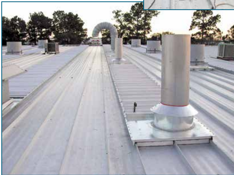
Figure 15 – Difficult penetrations are raised above the roof plane and can be isolated using transverse panels, reducing a chance for a leak and the volume of water coming into the building if there is a leak.

So in order to increase the chance of success when using metal roofing on a low slope, start by eliminating all of the places for a metal