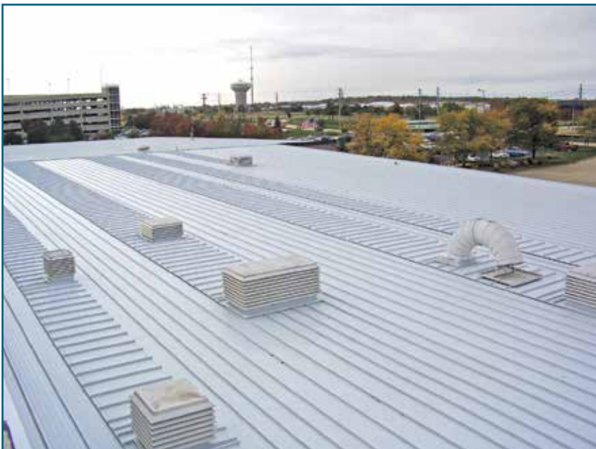
Figure 12 – The same roof as in Figure 11, re-covered with no end laps, using site-formed, variable-width panels and transverse panels uphill of curbs.