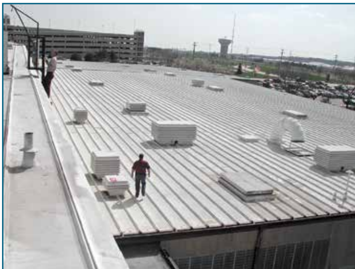
Figure 11 – Large, low-slope metal roof with over 700 end laps, 100 around curbs.

Then, add an eave member down each side and a support member down the middle of the hole that runs all the way from behind the curb to the ridge (Figure 14). The support member should be slightly taller than