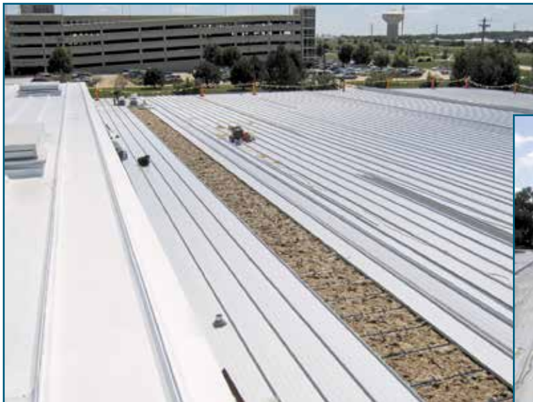
Figure 13 – Initial installation of roof in preparation for transverse panels behind curb.