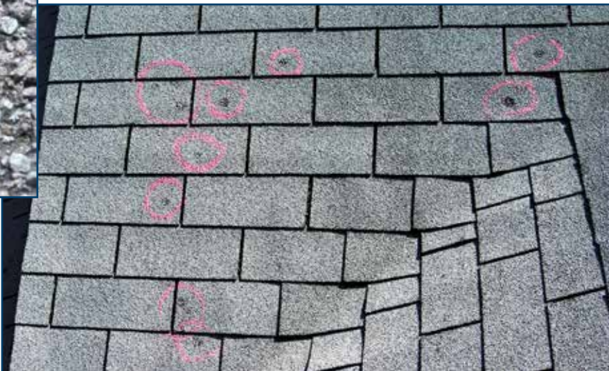
Figure 2 – Unnatural radial pattern from deliberate impacts. This type of pattern can be inflicted by anything from a rake handle to a golf ball in a sock.