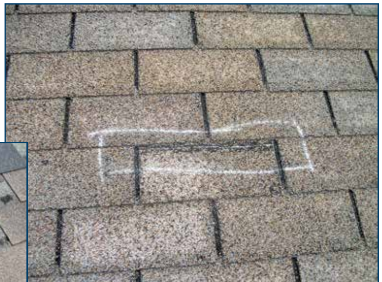
Figure 10 – Natural linear folding/creasing that constitutes legitimate roof damage. Note also the “graying-out” of the crease, suggesting this tab has been flexing in the wind for some time.