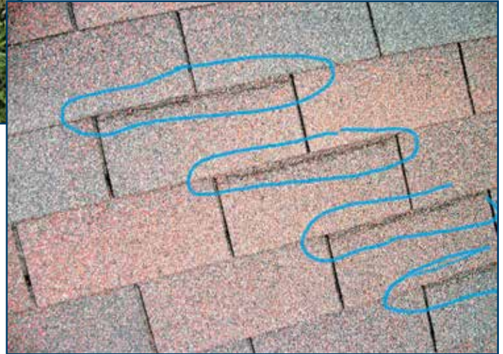
Figure 8 – The author witnessed this pattern made by a well-meaning contractor who was determining the nailing pattern; nonetheless, this is not a natural pattern of creasing due to high winds. Tabs were very well bonded here. When some damage is encountered but remaining shingles are very well bonded, the basis for concern is present.

(Figure 10) represents legitimate compromise to a shingle roof; folding and creasing elsewhere on the tab exposure is a dubious occurrence. A casual Internet search will reveal the common manner of wind influence on shingles.