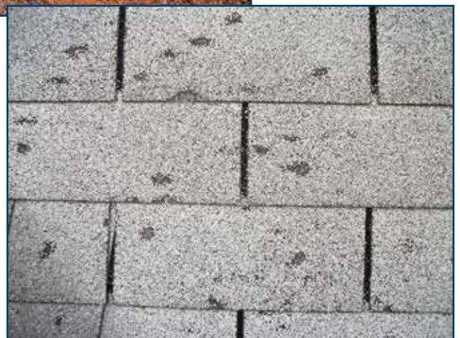
Figure 6 – Innocent, natural, random pattern of legitimate hailstone pockmarks. These are greying-out from UV exposure in contrast with more recent hits that would be darker.

Manufactured wind damage is the ugly stepsister of fraudulent hail damage. Ordinary wind damage will involve torn, creased, or folded tabs or even loss of entire courses. Linear creasing at the top of tab exposure