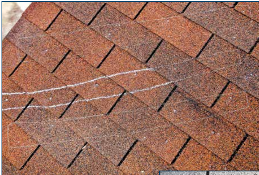
Figure 5 – The small end of a ball-peen hammer was used on this one. Impacts extended through two plies of shingles, underlayment, and into decking. Hail particles of this small size would have no such kinetic energy. Again, the granule surfacing was powdered; also note the linear pattern of swing lines. Large Caladiums and Colocasia plants (elephant ears) directly below this roof were completely unaffected.

Small ice particles have little kinetic energy; and on roofs in reasonably functional condition, such hail does not reduce service life. But a small increase in size causes exponential increase in falling energy. Remembering the formula for volume of a sphere ( 4/3\pi r^3 ), volume varies as the cube of radius. Large hail can inflict damage but just as well may not, depending on particle hardness, roof condition, and even prevailing temperature at the time of exposure.