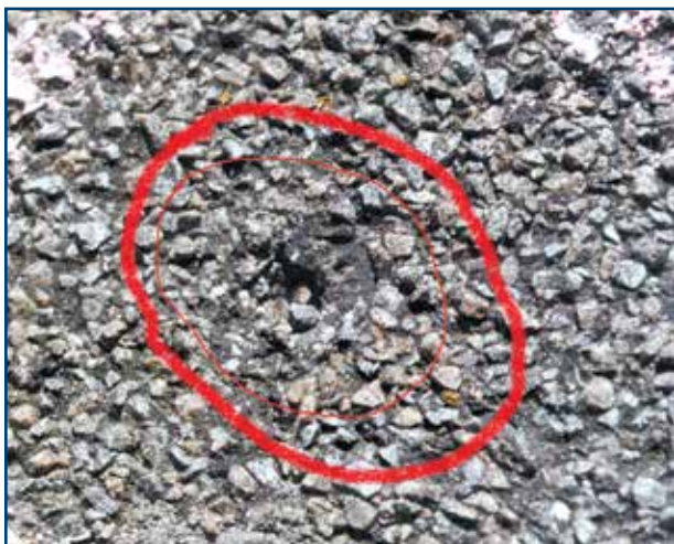
Figure 1 – Deliberate puncture from round mandrel of some type.

Fortunately, damaging hail almost always generates peripheral damage. Consequently, nearby greenhouses, gutters, downspouts, soft-copper valley liners, chimney flashing, and light-gauge attic vents should provide insight into the actual storm intensity. Significant hail will also leave a signature on older wood, plastics, and exposed paint. Oxidized paint on roadside utility boxes (Figure 7) is a wonderful witness to hailstorm particle size and intensity. Similarly, well pump covers, HVAC condenser fins, window screens, hot-tub