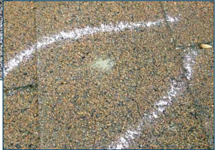
Figure 4 – Crushing of mineral granules from deliberate blunt-force impact. Hail particles, regardless of size, will not pulverize granules, reducing them to powder.

covers, and the like can serve to refute or validate the nature of storm intensity being claimed. Large-leaf vegetation, (e.g., Caladia and Colocasia plants, banana trees, and even tobacco fields) is a reliable silent onlooker of recent hailstorm activity. Claiming wholesale roof destruction when fragile nearby plantings are unaffected does not square with the facts. It may also not align with the readily available hail report services.