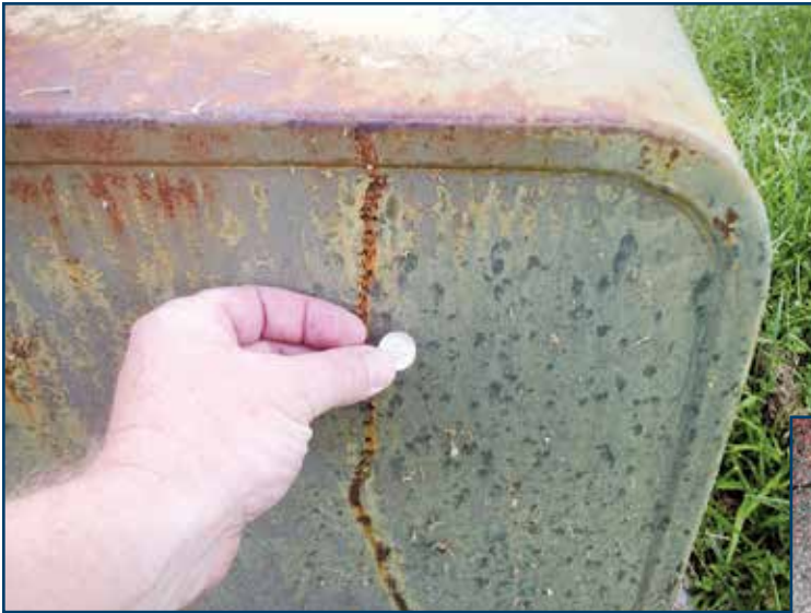
Figure 7 – A little detective work will prove worthwhile. Here, the oxidized paint of a roadside utility box provides good evidence regarding particle size (all smaller than a penny). Markings on a roof that deviate appreciably from this should be regarded with suspicion.