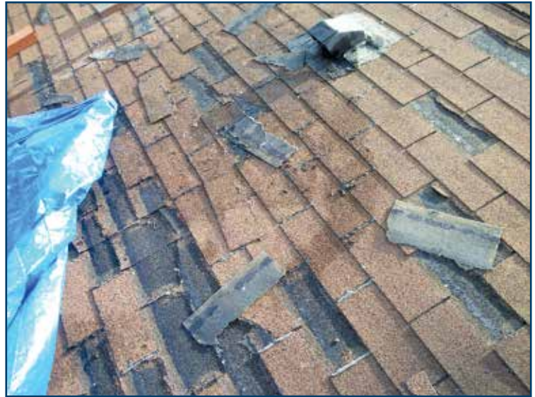
Figure 11 – Highly irregular tear lines are inconsistent with ordinary wind influence. More importantly, winds sufficient to inflict this extent of damage would not have left the loose fractions still scattered about the roof surface; this “practitioner” needs a course in remedial reasoning.

excellent corroborating evidence. Bradford pear trees may be particularly helpful; mature trees often lose large branches during even moderate winds. If there is no recent breakage, the claim for high-wind exposure becomes suspect.