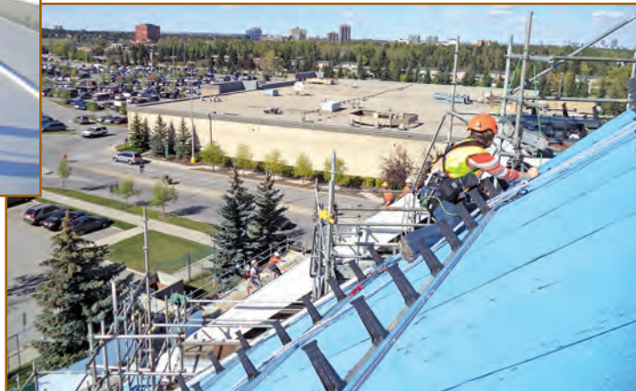
Photo 5 - Mairead Walsh conducts an investigation on the Fish Creek Library in Calgary, Alberta.

technicians also rely on fall arrest devices, which act as backup safety devices and are used to stop a fall, slide, or uncontrolled descent. Any tools used during an investigation are attached to the technician at all times, allowing easy access to anything he or she may need. Technicians attach rope to structural roof anchors, either temporary or permanent; they can also tie off to structural members if necessary.