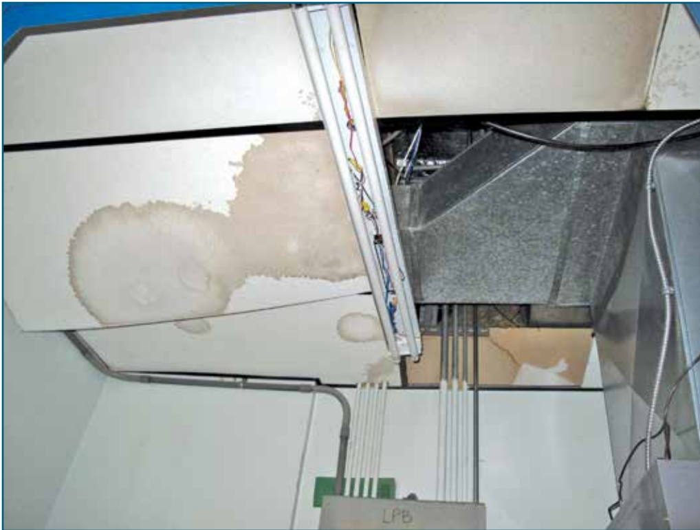
Figure 1 – Stained ceiling tiles caused by condensation dripping off of mechanical equipment above.

a nonporous surface that has been cooled to a temperature lower than that of the dew point of the air. The visible distress caused by condensation can appear similar to distress due to a water leak and is most frequently observed at windows and mechanical equipment ( Figure 1 ).