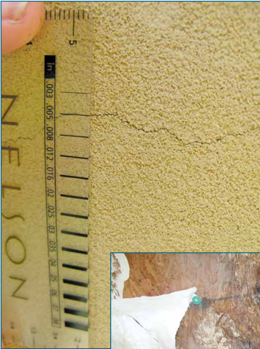
Figures 3 and 4 – Fractures in stucco allowed capillary suction across wall assembly, resulting in deterioration of the wall sheathing and framing.