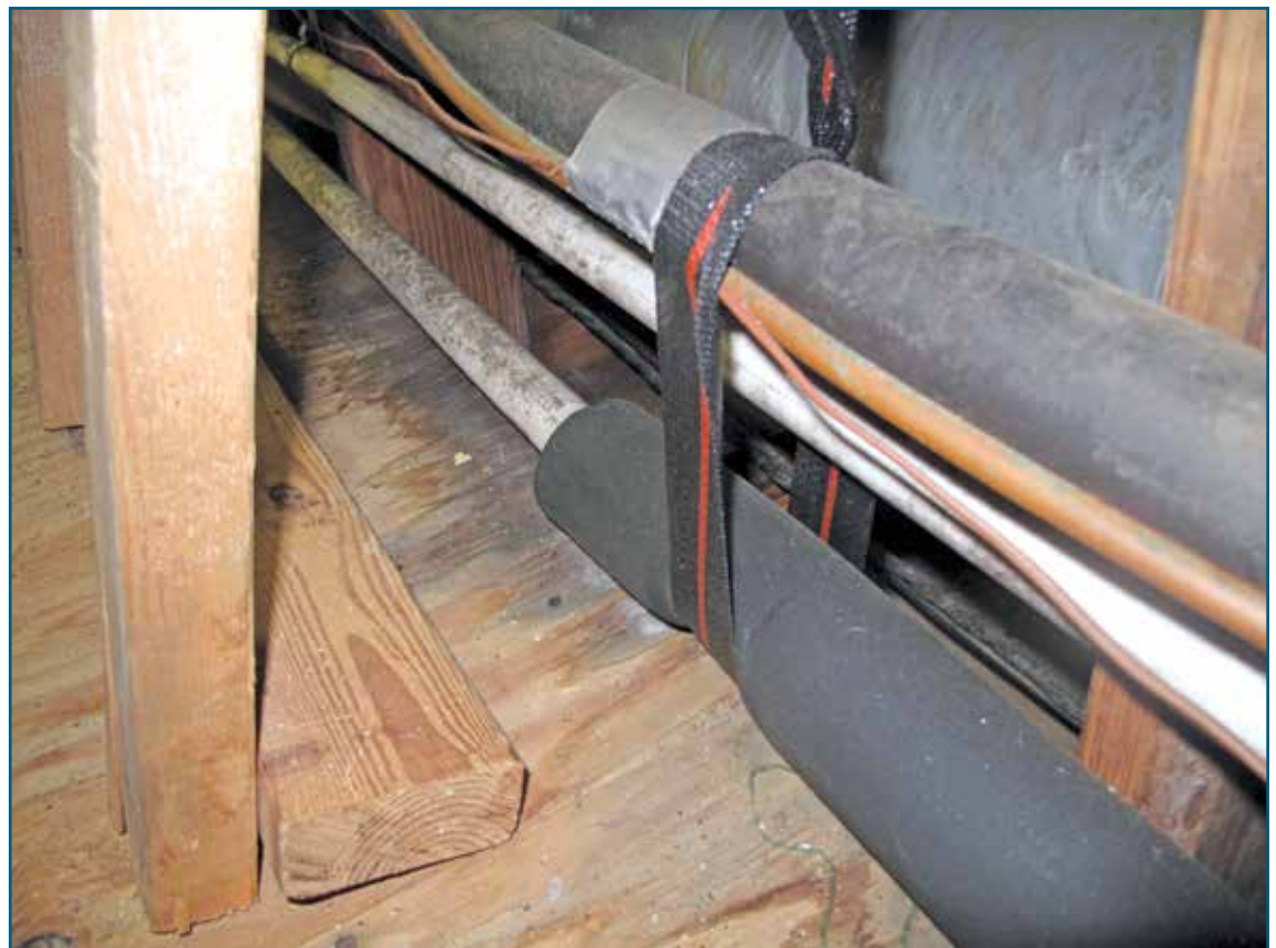
Figure 2 – Moisture staining below uninsulated section of plumbing within an unconditioned attic.

condensation problems than in a plenum return system, because the attic spaces are not diluted with the drier conditioned air from the occupied space below. The moisture level in the unconditioned and negatively pressurized attic space is higher