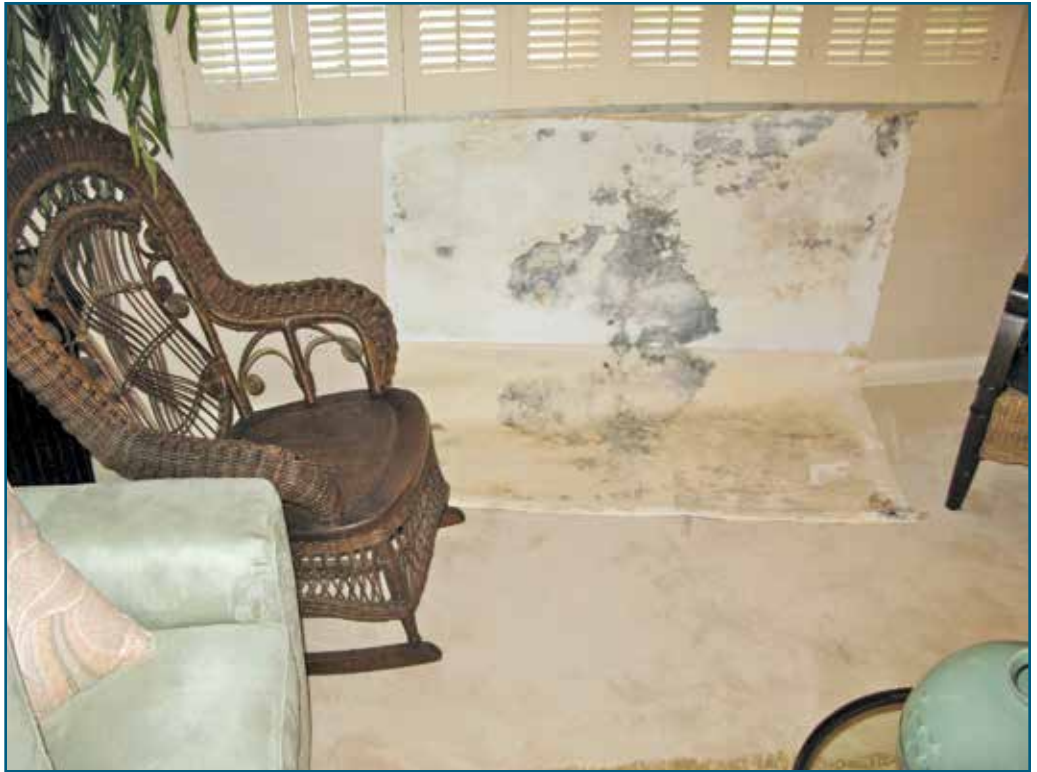
Figure 5 – Fungal growth behind vinyl wall covering, functioning as an unintentional vapor retarder.