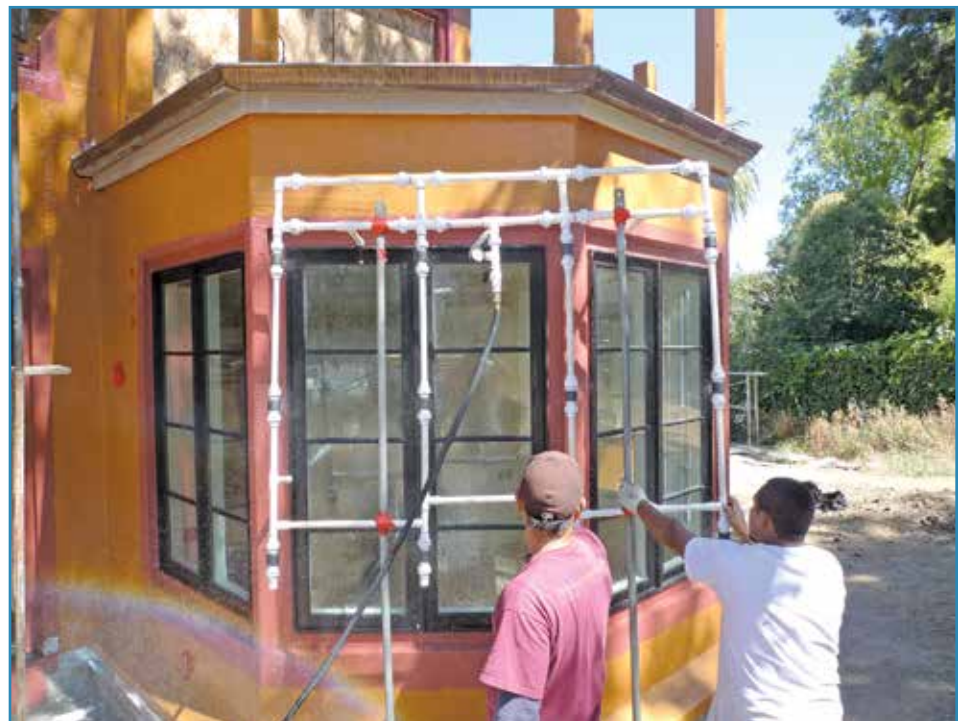
Photo 23 – On-site water testing of fluid-applied WRB and flashings.

Screw sealability is fair (but good for its intended purpose). However, these materials are not “self-sealing” or “self-healing”—they do not contain cold-flow properties. If a nail is removed, the hole will remain.