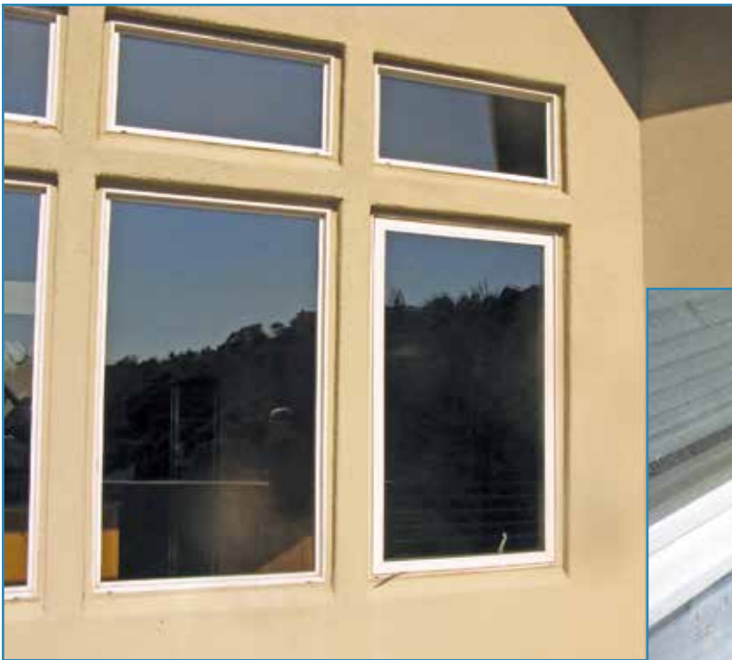
Photos 9 and 10 – The problem child: the typical recessed window. Water intrusion damage from improperly applied or sealed SAF in a typical recessed window flashing installation.