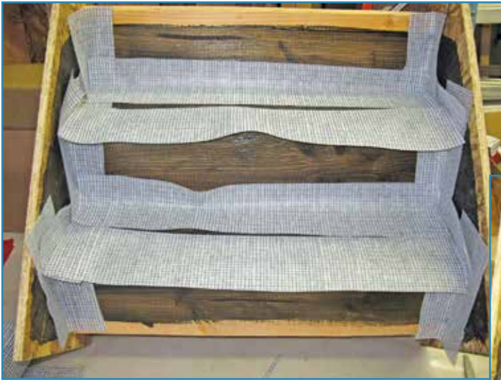
Photo 16 – Some acrylics require fabric reinforcing. Pre-cut fabric is shown.