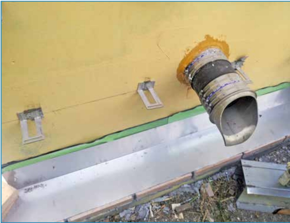
Photo 8 - Fluid-applied WRB and flashing at pipe penetration and brick ties in process.

less cost-effective, but are desirable for all the above reasons. The result is more value on the wall, with less cost in labor. Fluid-applied weather barriers and air barriers pay dividends in reduced life cycle maintenance and repair expenses.