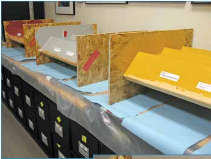
Photo 19 – In-house seven-day flood testing of fluid-applied flashings.