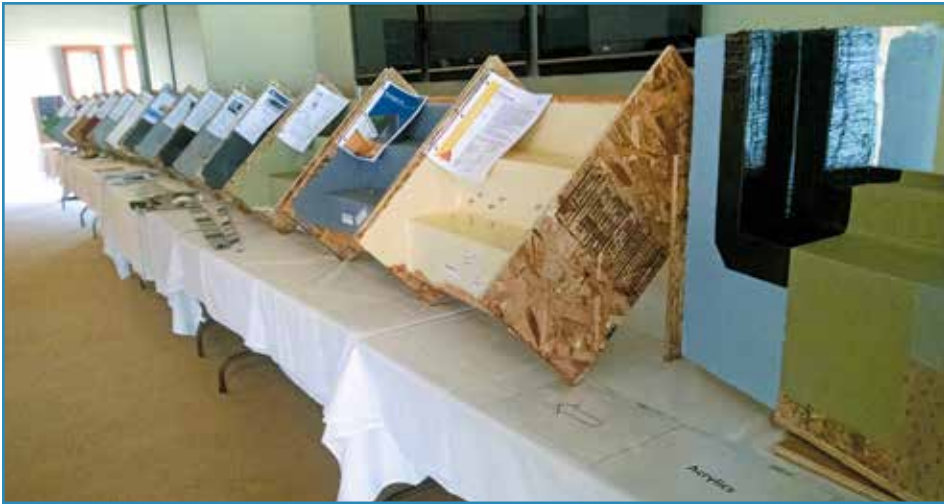
Photo 24 – The author applied 15 different manufacturers’ “paint-on flashings” to mock-ups for the 2014 Westcon Symposium and 2015 RCI SoCal Hawaii Winter Workshop presentations.