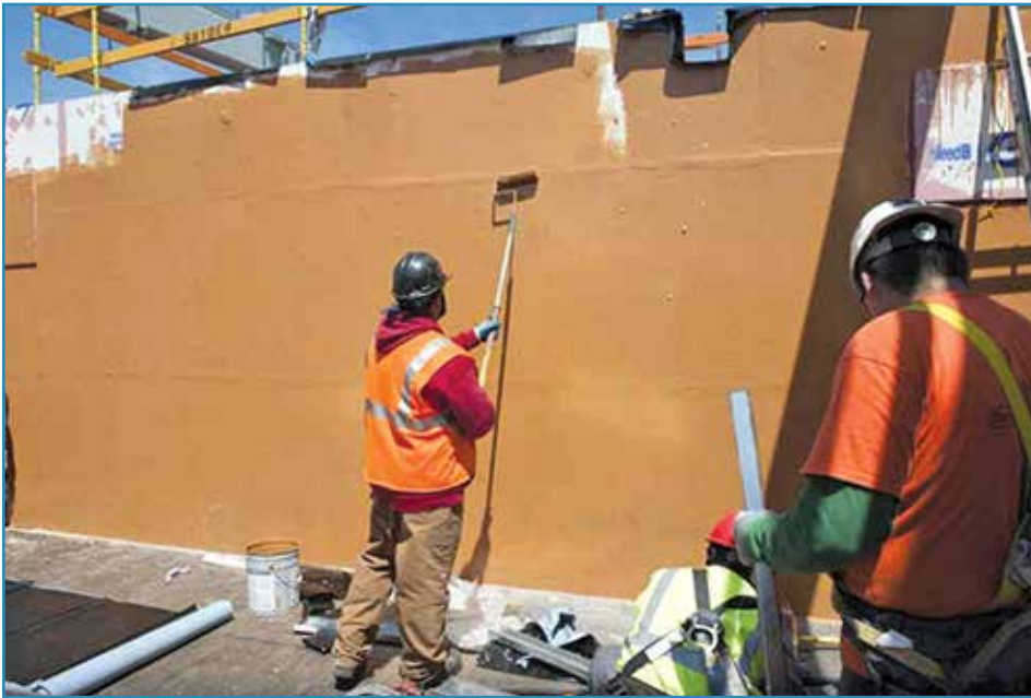
Photo 6 – Fluid-applied WRB being rolled.