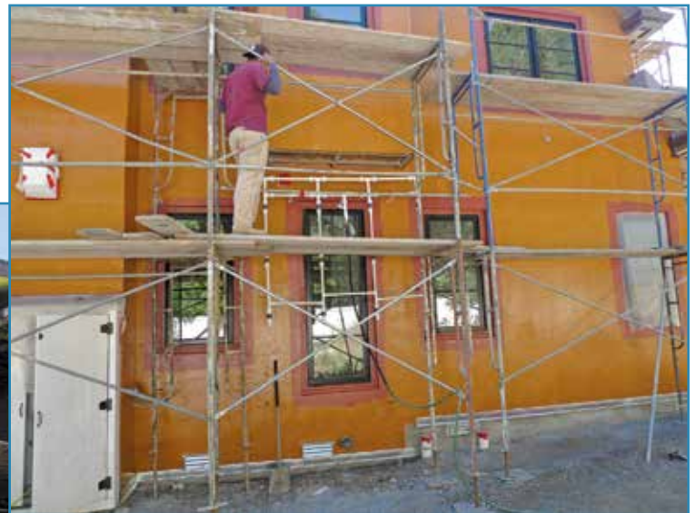
Photo 2 – Fluid-applied WRB, air barrier, and flashings applied to residential project.