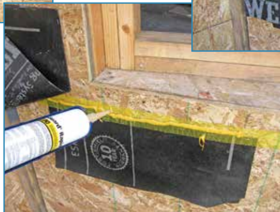
Photo 12 – Recessed window flashing. Step 2: Apply liquid flashing to fabric tie-in transition.