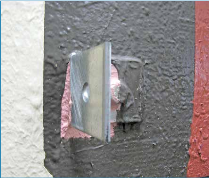
Photo 3 – Fluid-applied WRB and flashings applied to an irregular penetration.