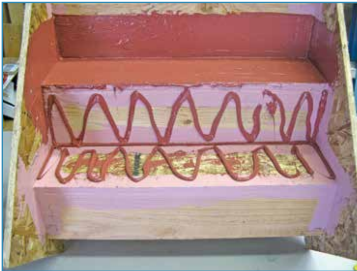
Photo 15 – Step 2: Application of full coat—typically with 4-in. plastic putty knife.