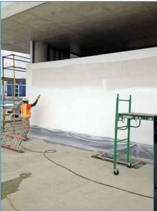
Photo 4 – Fluid-applied WRB being sprayed.