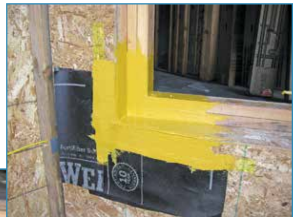
Photo 13 – Recessed window flashing. Step 3: Apply liquid flashing to opening and spread smooth.