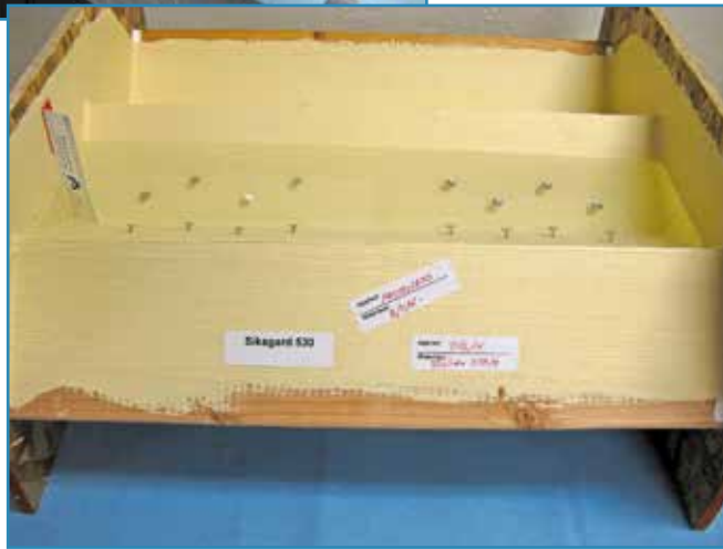
Photo 21 – Fastener sealability testing of liquid-applied flashing mock-ups in progress.

Applications range from thin to thick, dry to runny, smooth to coarse, and slick to sticky.