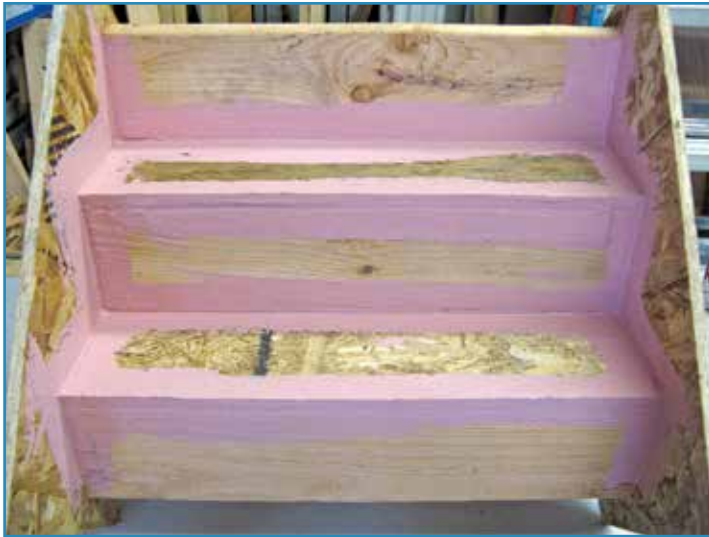
Photo 14 – STP application, best practice. Step 1: Seal joints and seams. Use putty knife to create screed.

Most fluid-applied WRBs, air barriers, and flashings are designed as substitutes for building paper or house wraps; therefore, they are similarly vapor-permeable—between 10 and 30 perms to aid in outward drying. And while permeance provides only a tiny fraction of drying compared with that provided by ventilation, wall cavities aren't generally ventilated, so the permeance of wall assembly materials is an important strategy. With that said, the various climate zones, HVAC, and wall construction types dictate whether vapor-permeable or impermeable WRBs are appropriate. 4 Impermeable fluid-applied barriers and flashings are available.