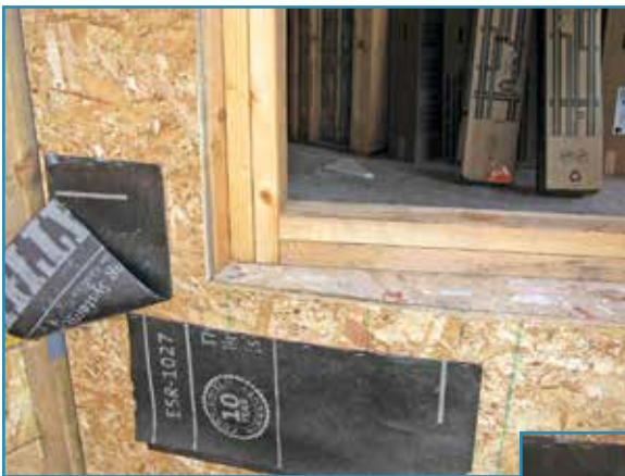
Photo 11 – A fluid-applied flashing application to recessed window opening. Step 1: Fasten sheet WRB.

cover less than one-half sheet of plywood per gallon. Most of the fluid-applied WRB and flashing materials are applied to produce a 20-mil coating; that seems to be the "sweet spot." However, always apply at the rate the manufacturer requires.