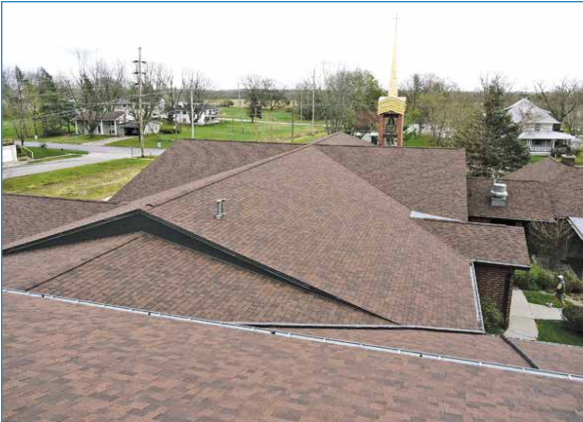
Photo 1 – A roof with Legacy® SBS polymer-modified shingles after a hailstorm in El Dora, Iowa, in August of 2008. The only shingle damage was to the ridge vents, due to the unsupported ridge area.

success of the product. In the search for innovation, modified asphalts are ushering in a new era of more resilient asphalt products.