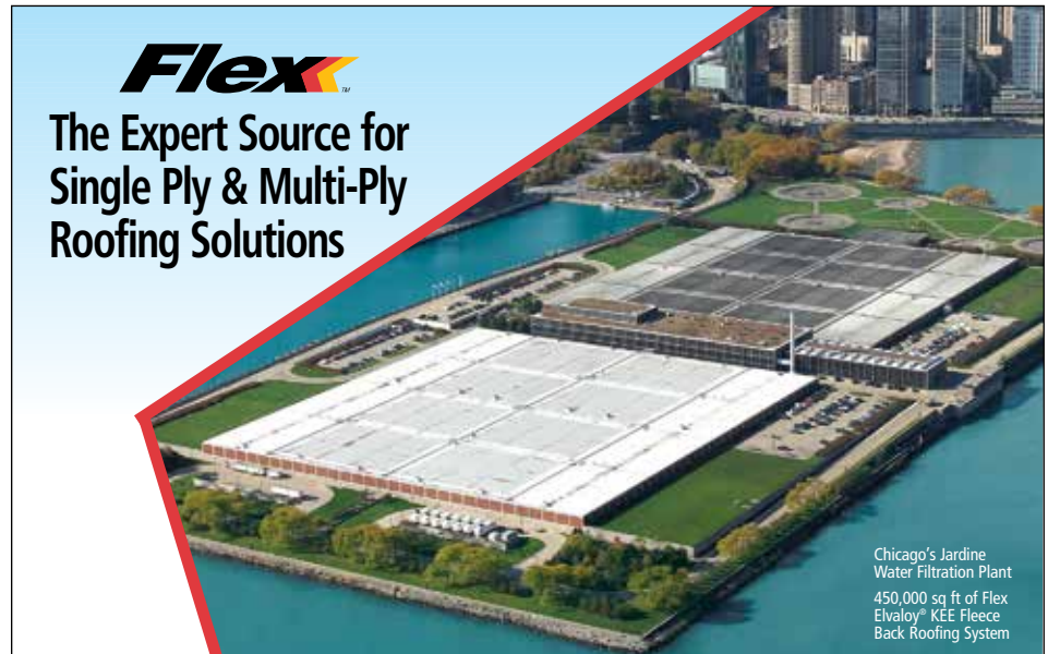
Chicago's Jardine Water Filtration Plant 450,000 sq ft of Flex Elvaloy™ KEE Fleece Back Roofing System