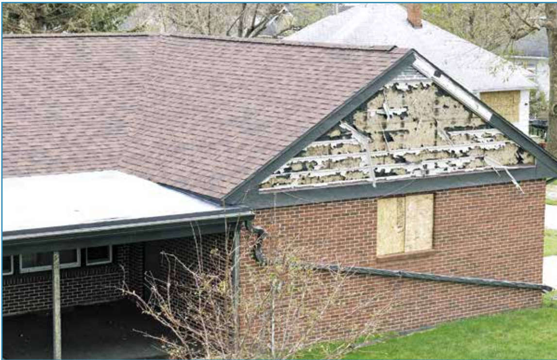
Photos 2 and 3 – Alternate views show destruction of siding and a bronze steeple on the same building during the same hail event.