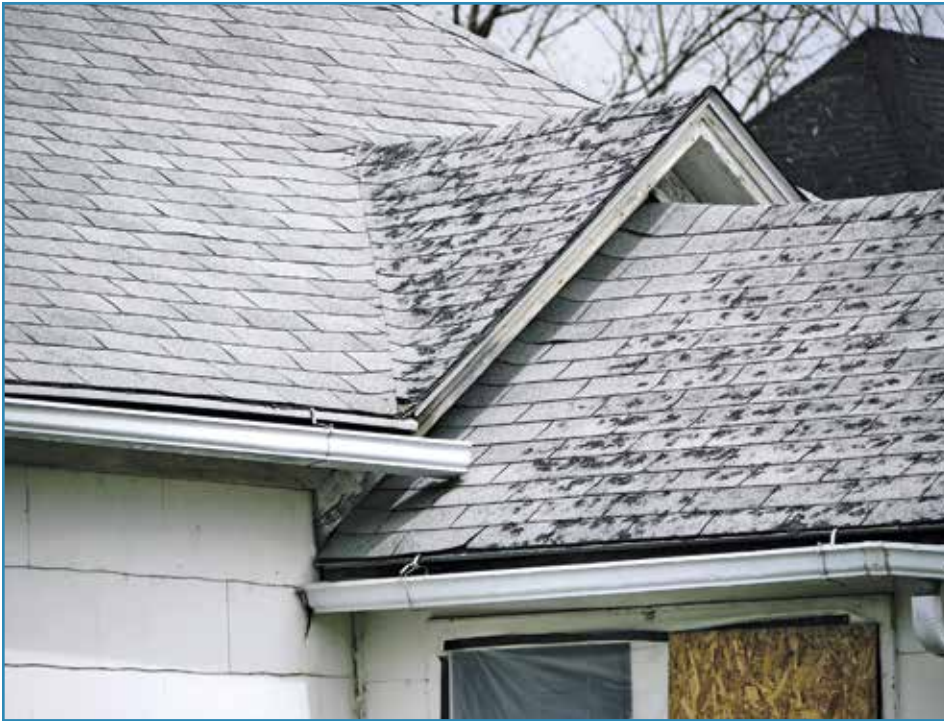
Photo 4 – Untouched photograph of an oxidized asphalt shingle in the same neighborhood after the same hail event in El Dora, Iowa.

http://www.nachi.org/asphalt-comp-shingles-part44-98.htm .