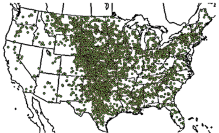
Figure 1 – National Weather Service preliminary severe weather report of large hail events in 2013.

All roof coverings are comprised of systems of components that work together to create a protective barrier, and shingles themselves are no different. Asphalt shingles are a system built primarily of mat, asphalt, filler, and granules. Each component serves a function and is critical to the