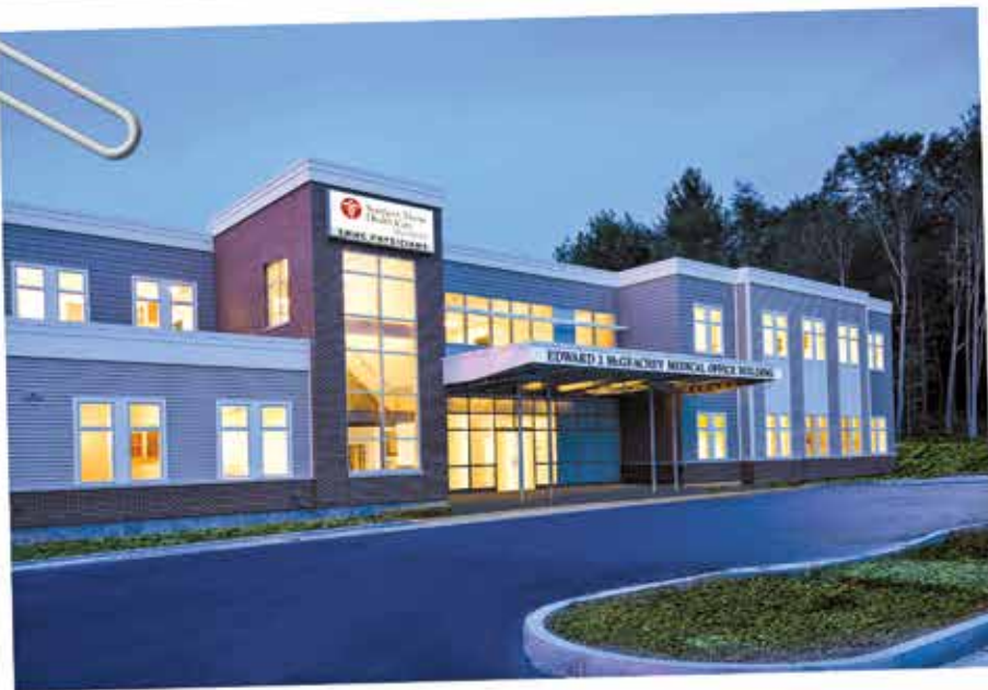
Figure 6 – The exterior combination of brick, polymer staggered Perfection shingles, vinyl panels, and cellular PVC trim helps to create a warm and inviting building entryway.