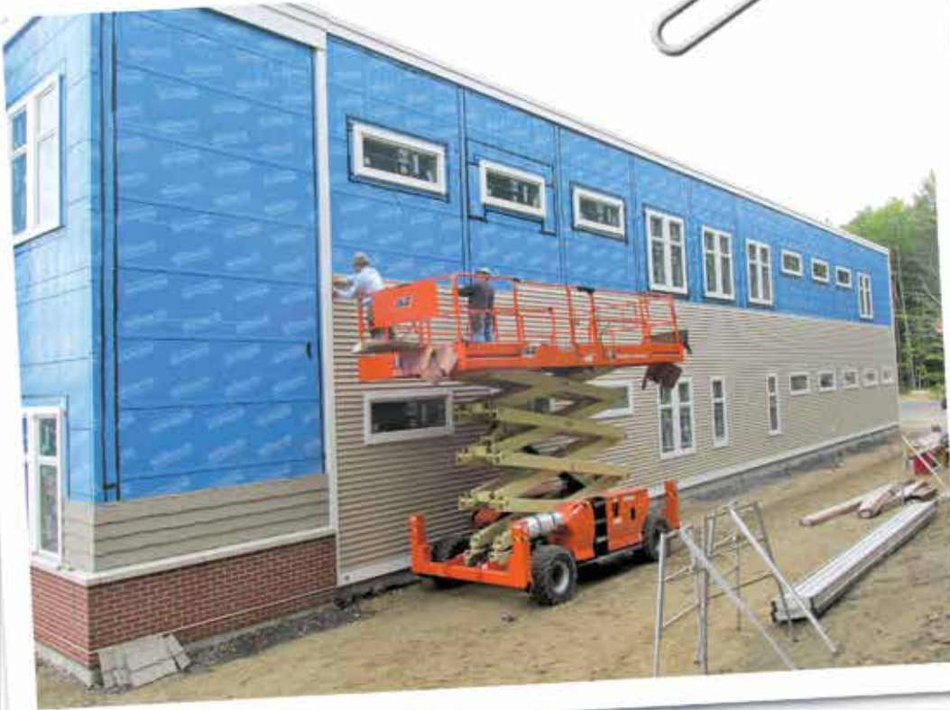
Figures 3 and 4 – Ouellet Associates’s team installs vinyl siding in a woodgrain texture finish and 7-inch polymer staggered shingles onto a self-adhering air and moisture-barrier membrane. To complete all of the flashing, trim, trim panels, and siding, it took a crew of six to eight men approximately nine weeks.

between cost and long-term low maintenance with the exterior cladding. Further architectural restrictions came by way of existing design guidelines dictated by the business park, which, among other stipulations, required that the structure have a soft, residential look.