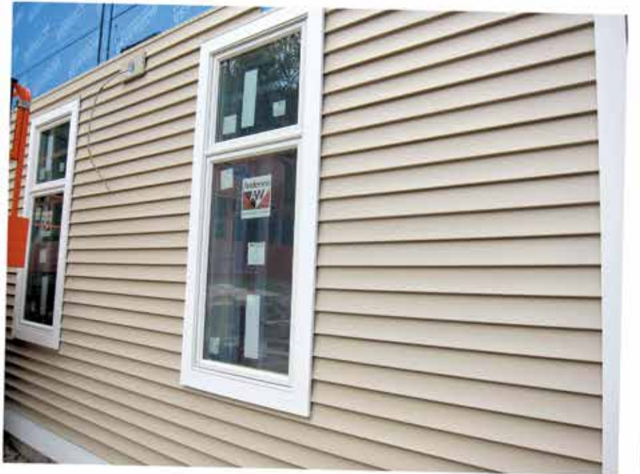
Figure 5 – Combined with vinyl trim and cellular PVC trim, the end result was a clean aesthetic that replicates the look of real wood, but is virtually maintenance-free.

"Due to the large areas of siding and vast areas of trim, we followed the sun with our work, staying in the shade as it was installed. This allowed the materials to be installed with the most consistency," he said.