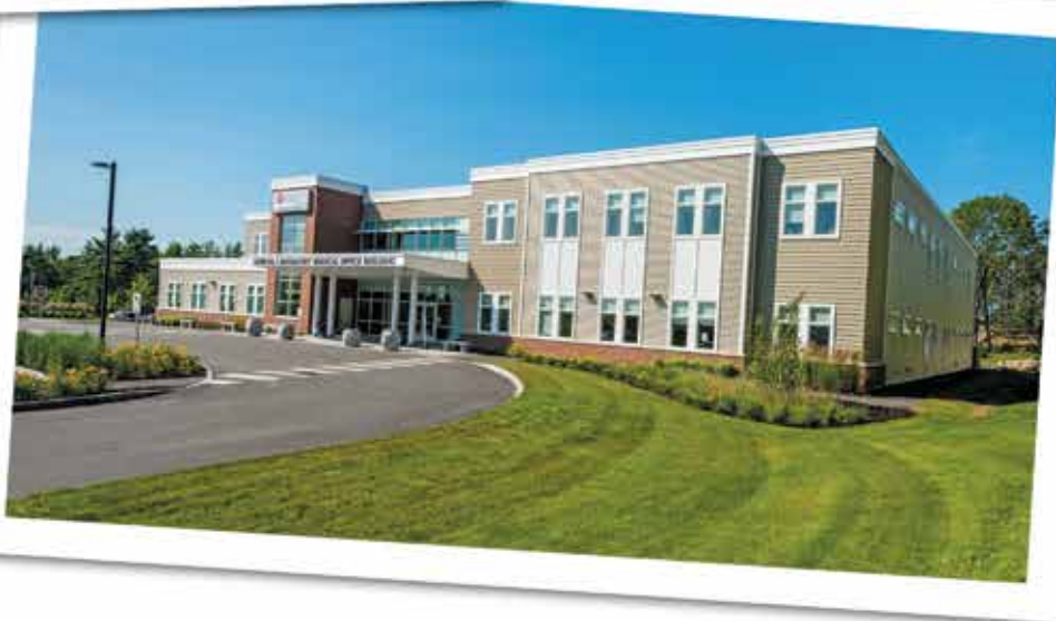
Figure 7 – A mix of 4,600 sq. ft. of double 7-in. polymer staggered Perfection shingles, 9,100 sq. ft. of vinyl panels, and 6,500 linear feet of decorative cellular PVC trim were specified to create the appropriate curb appeal for the building and surrounding neighborhood.

won't fade. There are literally hundreds of color, style, and texture combinations with which to play, and the affordability of these materials is tough to beat. Beyond curb appeal, the upkeep these materials require is minimal, requiring only occasional washing with soap and water.