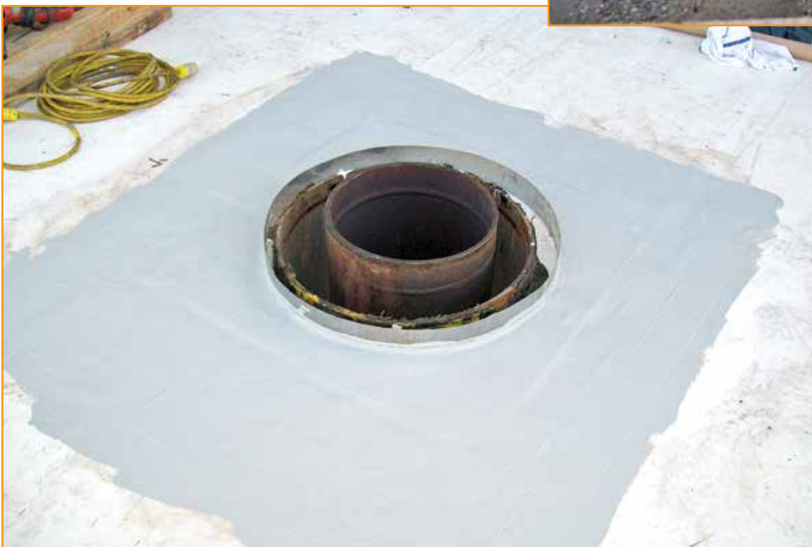
Figure 8 – Difficult flashing detail around an equipment exhaust penetration.