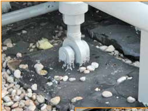
Figure 5 – Typical as-found roof penetration configuration.

Schedules often impact many design decisions. Due to safety concerns, some