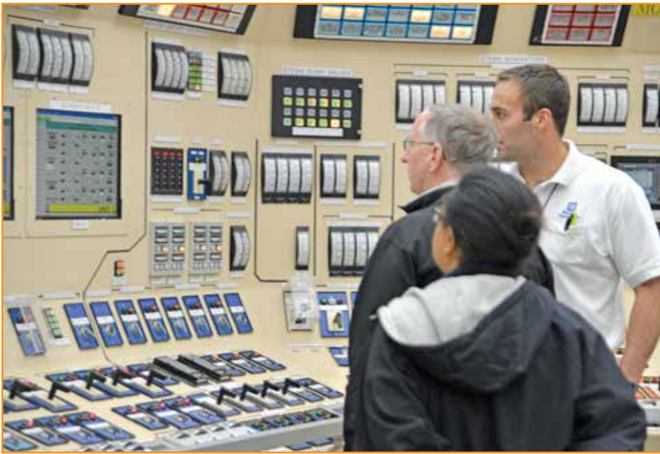
Figure 4 – NRC Commissioner Ostendorff tours Tennessee nuclear plant. (“Inspectors,” Nuclear Regulatory Commission, 15 Jan., 2014. Accessed 9 Oct., 2015.)

movement of operating plant machinery. When a plant is on-line, some of the steam-related piping can reach surface temperatures of 800°F (427°C). Temperatures inside some buildings exceed 120°F (49°C) year-round, while others are kept at sub-freezing conditions. This provides the designer not only with the obvious challenge of selecting materials compatible with the extreme surface temperatures, but when the reactor is taken offline for maintenance, there can be six inches or more of thermal movement as the pipe cools down that