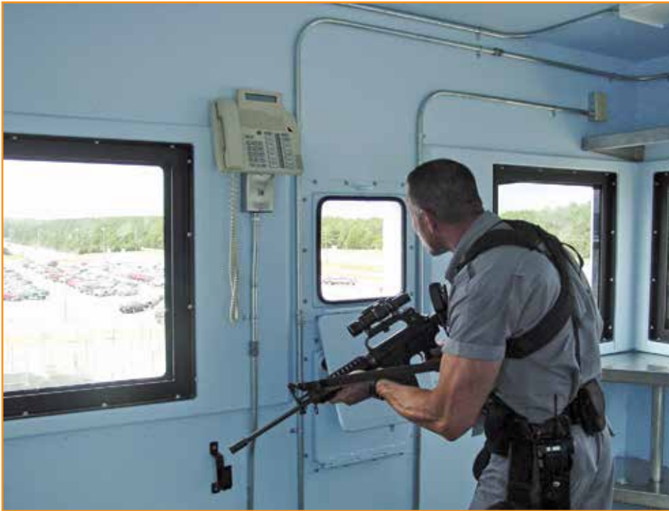
Figure 2 – Security officer on post at nuclear facility. (“Security,” Nuclear Regulatory Commission, Sept. 10, 2004. Accessed Oct. 9, 2015.)