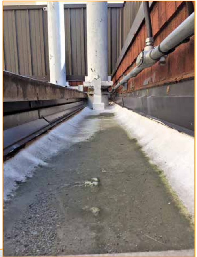
Figure 7 – Low flashing around a high-heat steam relief penetration.