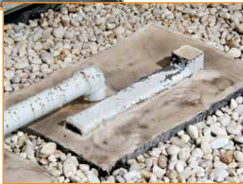
Figure 6 – Typical low-roof penetration configuration.