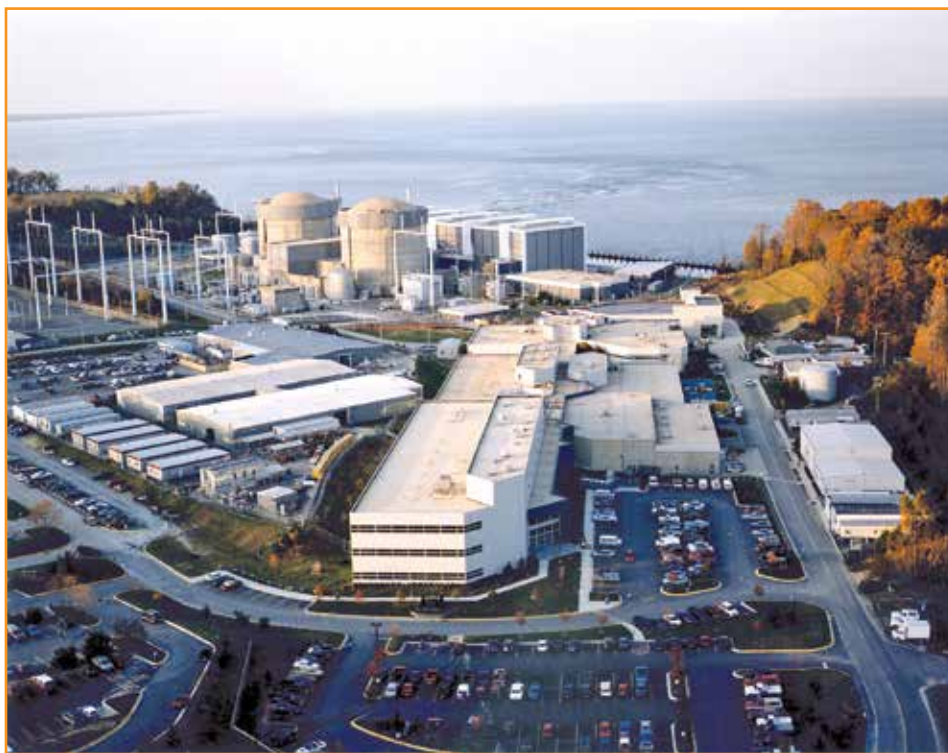
Figure 1 – Typical nuclear power generating facility. Calvert Cliffs Nuclear Power Plant, Units 1 and 2. (“Operating Nuclear Reactors,” Nuclear Regulatory Commission, Nov. 15, 2007. Accessed Oct. 9, 2015.)