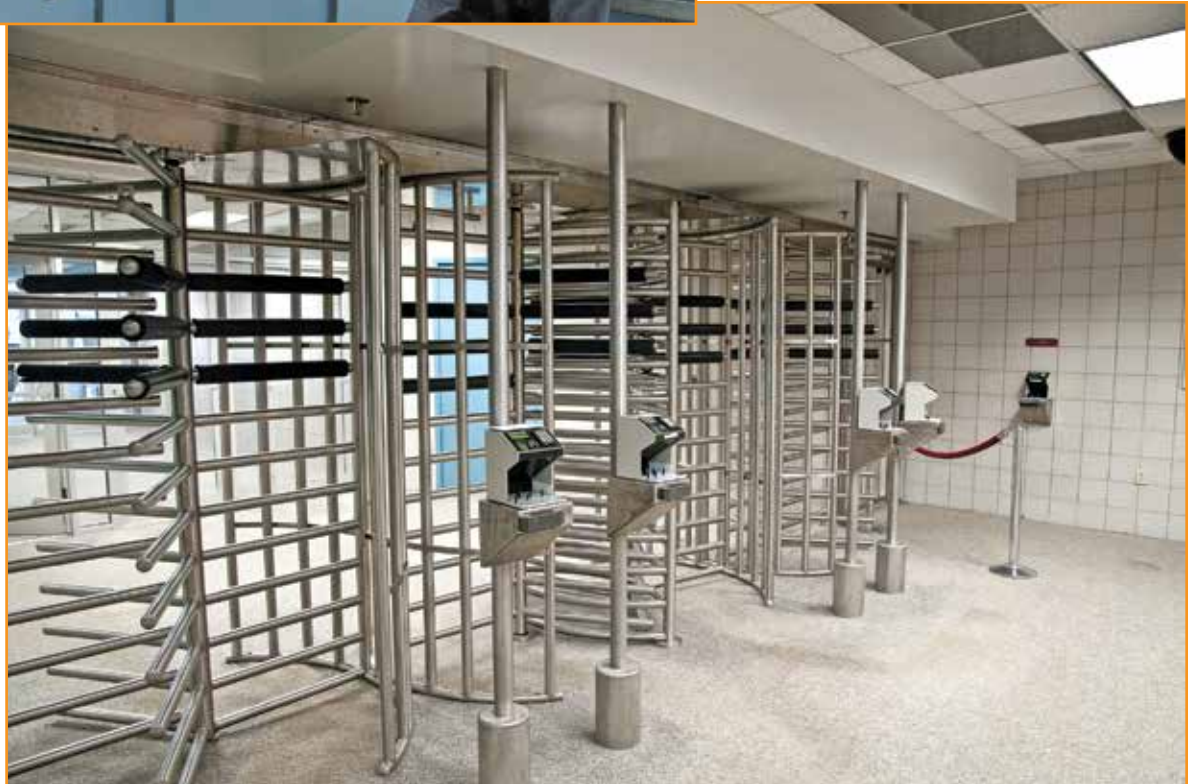
Figure 3 – Access control security gates provide another layer of protection. (“Nuclear Plant Security,” Nuclear Regulatory Commission, July 2013. Accessed Oct. 30, 2015.)

they are searched similarly to security at airports, and must pass through metal detectors and past explosives monitors and have their personal items run through X-ray machines (Figure 3). When exiting, workers also follow a process that scans them for radioactive contamination. The equipment used for this can be so sensitive that naturally occurring isotopes such as those found during summertime thunderstorms have caused a few roofers to lose various articles of clothing at the end of the day.