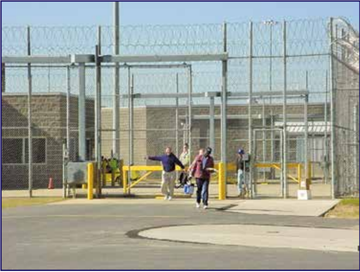
Figure 2 – Project team being successfully released from a supermax prison at the end of the workday.

for these situations. Upon leaving for the day, the same check-in process is repeated in reverse for checkout. All of the tools, materials, and supplies are verified and had better be accounted for. Do not leave anything behind, or it will take a very long time to resolve the issue and for you to get home; otherwise, you can plan on spending the night in a cell ( Figure 2 ).