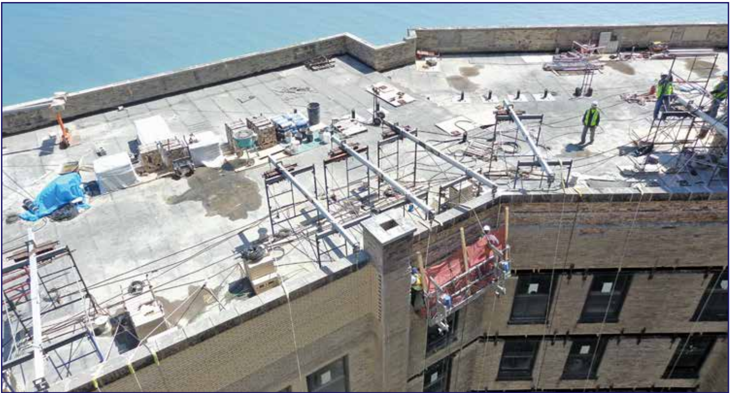
Figure 5 – Façade access equipment installed on a condominium roof where swing stages will pass directly in front of the unit windows.

finishes, travel paths, and routes. We have seen this taken to extreme requirements, such as removal of the temporary protection on a daily basis and reinstalling it daily so that it would appear in the evening hours as though no traffic took place that day at all. Protection of landscaping and grounds and repairs after the work is completed is another major consideration that can be a huge issue, depending on the circumstances and type of property.