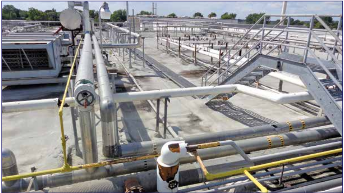
Figure 4 – Congested roof over a freezer building. The roof will be difficult to efficiently remove and replace.