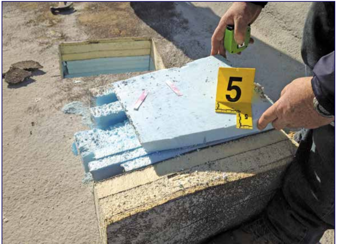
Figure 3 – The roof insulation at cold storage or freezer buildings can be extremely thick.

Food processing plants often function in 24/7 mode, in three shifts: two work shifts and one shift dedicated to clean-