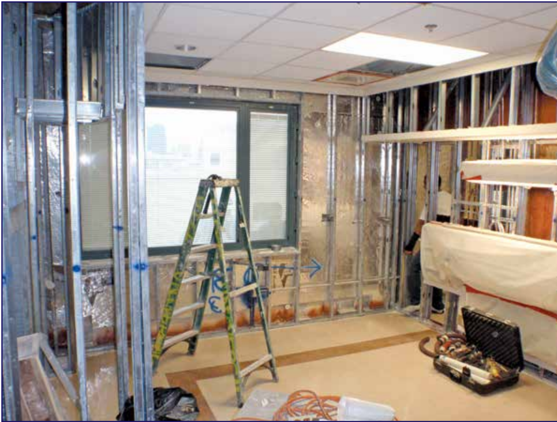
Figure 1 – Intensive care room with damaged interior gypsum finishes completely removed to address issues with the exterior wall cladding.