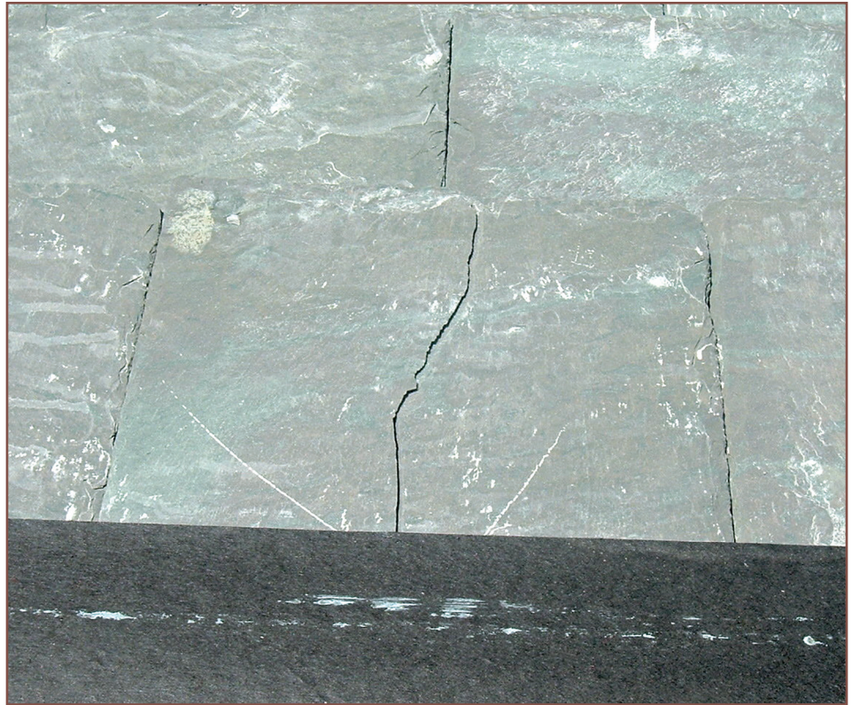
Figure 5 – Cracked slate.

If so, preservation briefs 2 and guidelines strongly recommend that the entire roof system be replaced. This recommendation is based on the fact that a roofing contractor will likely traffic the majority of the roof system to replace individual shingles. When the roof is trafficked, there is a strong possibility that additional cracked shingles will occur and not be observed or replaced. Also, if the building is experiencing defects and most of the slate is from the same installation period, it is likely that the roof system may have reached its useful service life. Removing a large section of the slate could result in improper tie-ins to render the area watertight.