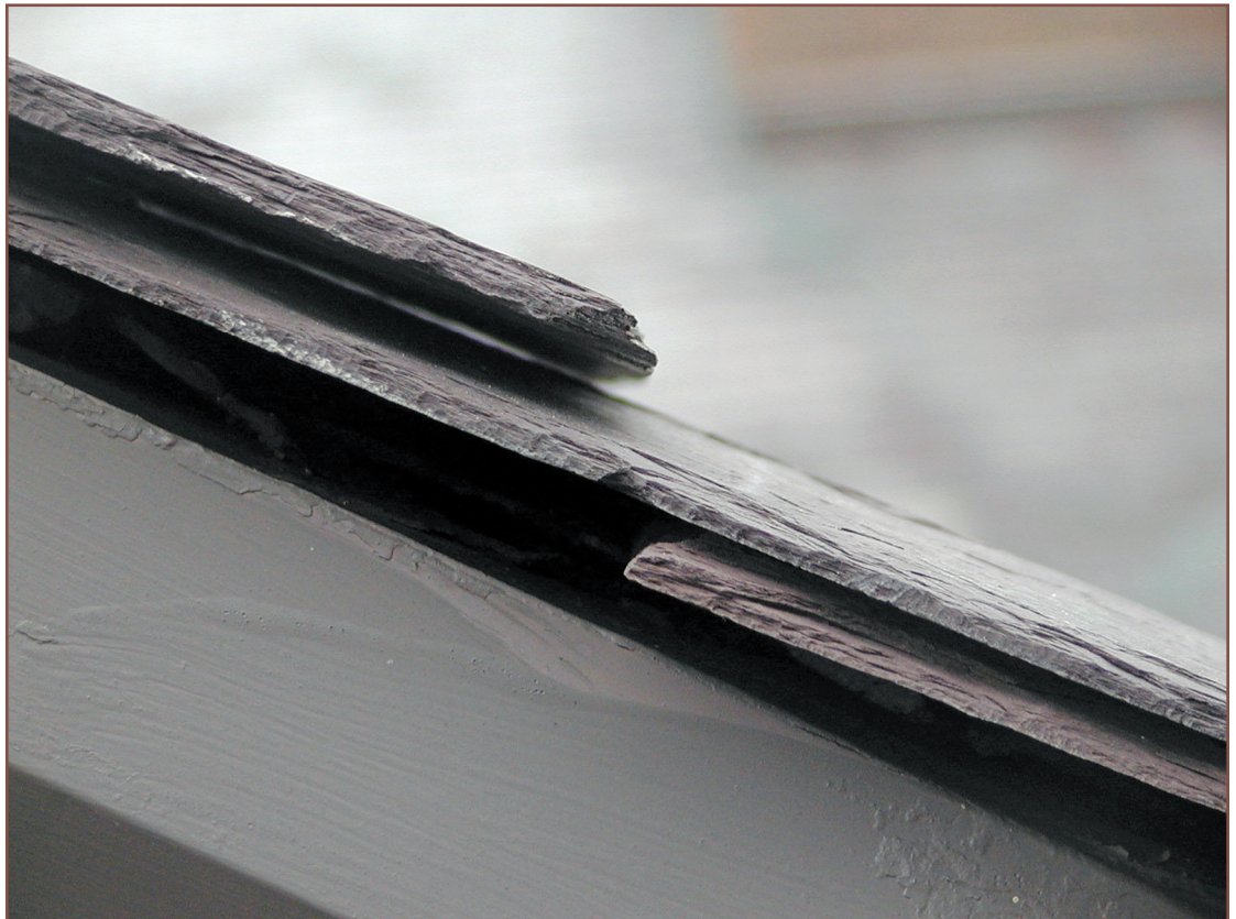
Figure 3 – Improper head laps.