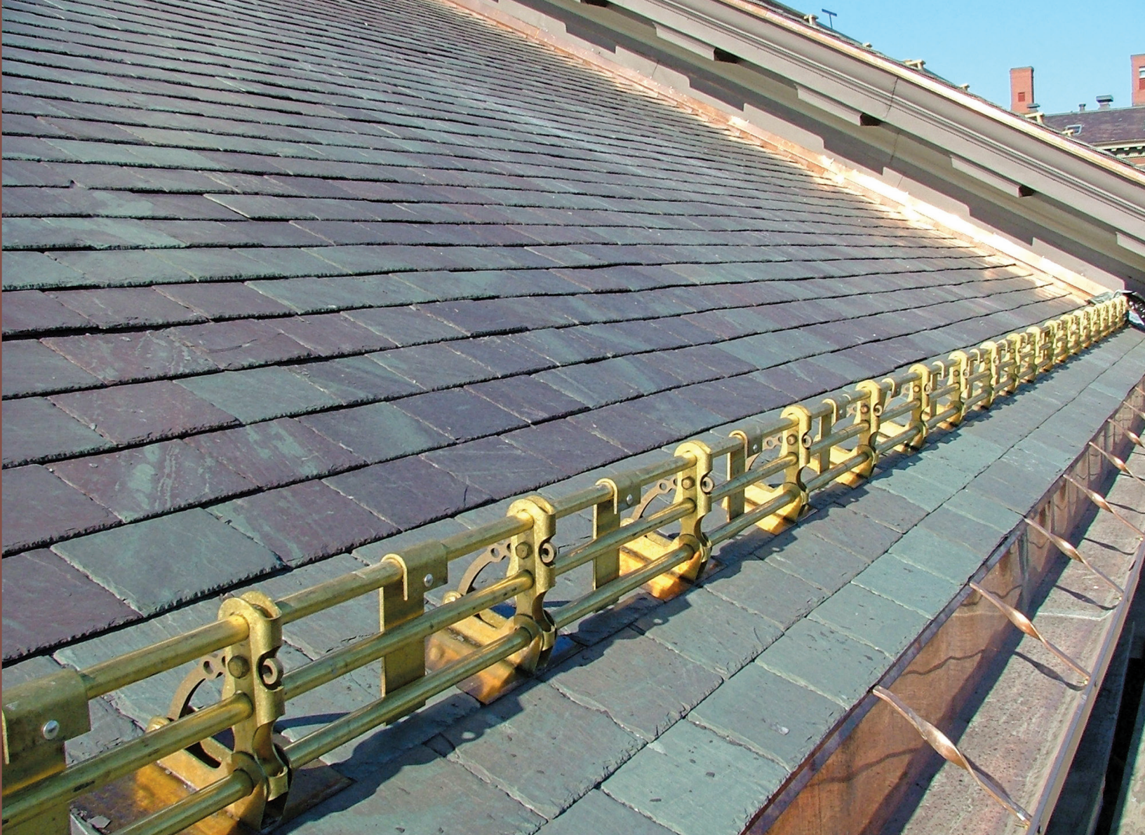
Figure 7 – The final product.

building codes for storm drainage. Snow guard types and placements (Figure 6) are critical to address snow slide to other roof areas and site features such as walkways, parking areas, and access locations.