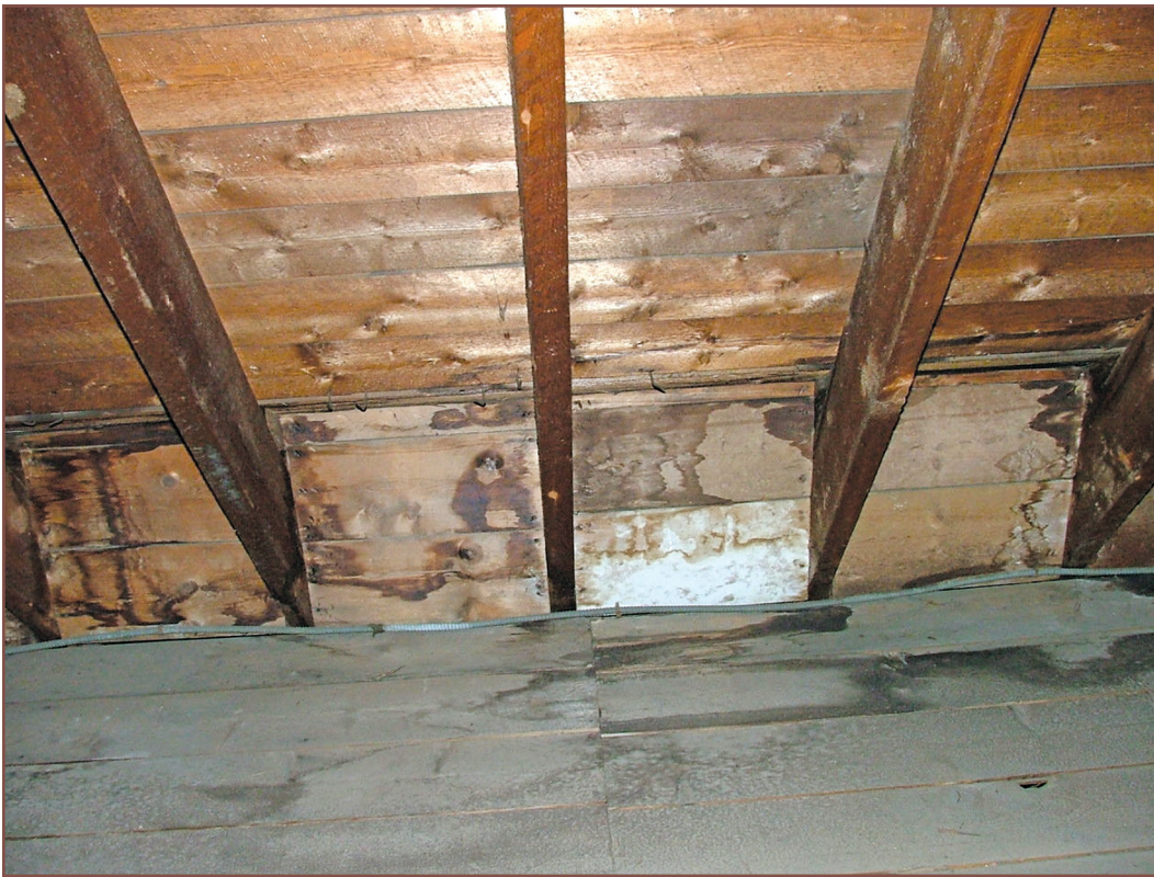
Figure 4 – Staining under roof deck and on floor.

or nationally registered structure is critical to the design and construction efforts, as this will affect the overall recommendations if replacement is required. It is possible to determine the building's historical value by asking the client, researching photos/plaques within the building, or visiting the various websites that list local and nationally registered buildings.