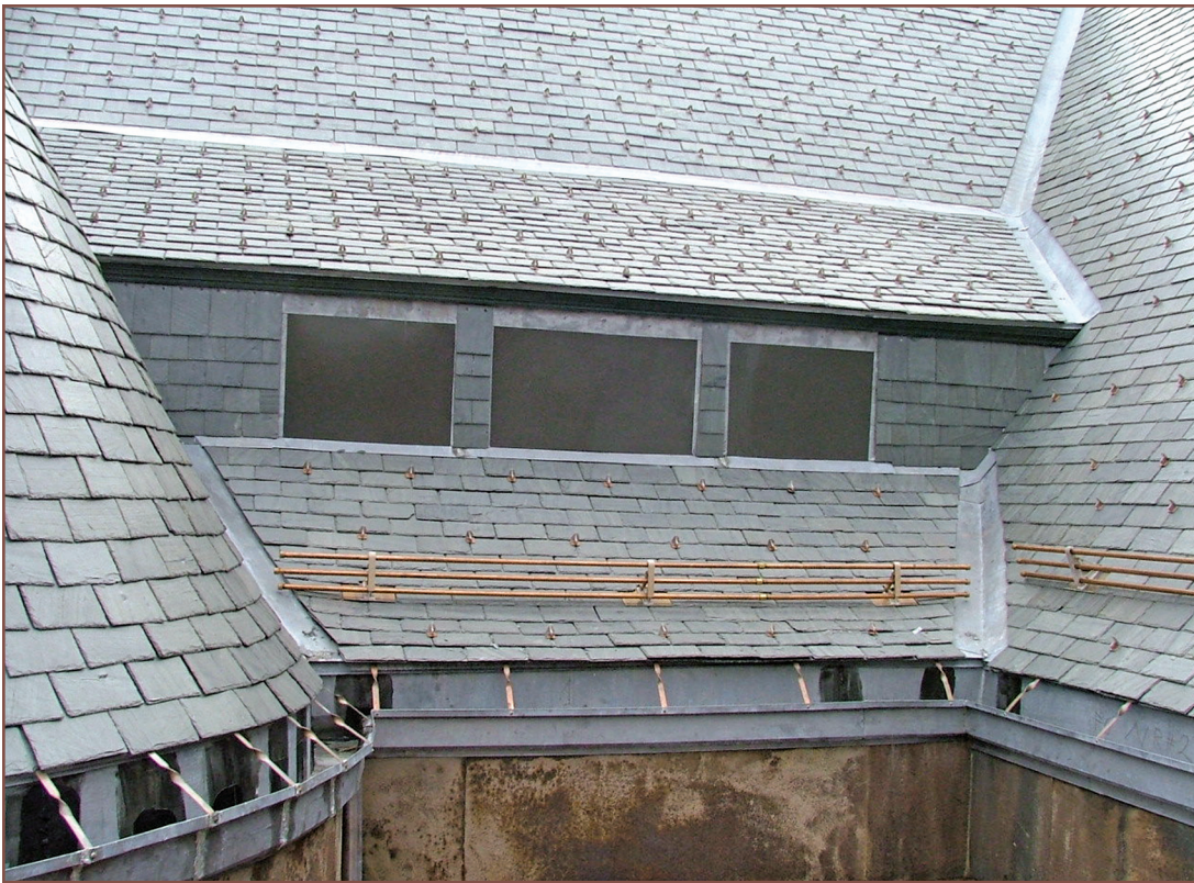
Figure 6 – Snow guard installation.