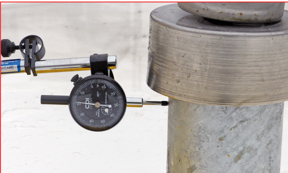
Figure 6 – Dial deflection gauge with gradations of 0.001 inch.

It should be noted that most guidelines refer to recommended testing forces in pounds. However, testing equipment typically provides pressure measurements in pounds per square inch (psi). As such, testing personnel converted tension forces to pressure measurements, based on the effective area of the pull cylinder used, prior to performing tests. Alternatively, a load cell