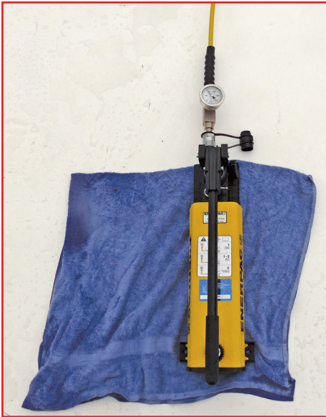
Figure 5 – Hydraulic hand pump and pressure gauge.