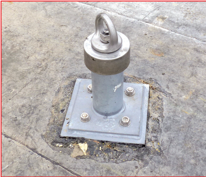
Figure 1 – Proprietary stanchion with a top eyebolt attached to concrete roof deck with adhesive anchors.

refers to façade access equipment as any equipment involving suspended platforms that is used to access the façade of the building. It indicates testing may be performed when systems are initially installed, when significant modifications or repairs are performed, or if use and/or exposure have led to concerns regarding the integrity of structural elements that cannot be easily inspected. Testing may be required when, in the judgment of the engineer responsible for the evaluation, it is necessary to confirm that the system conforms to the minimum OSHA strength requirements. ASCE Façade Access Equipment also clar-