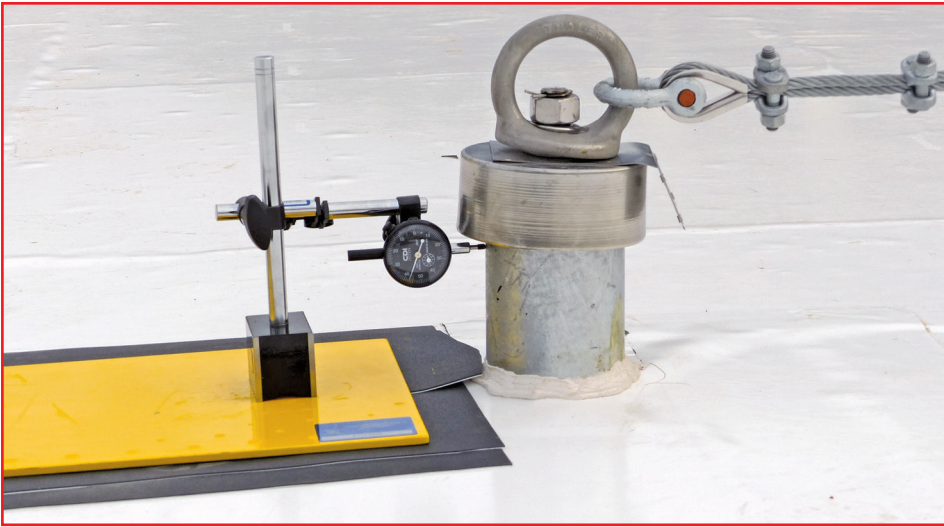
Figure 7 – Dial deflection gauge attached to adjustable stand and magnetic base fastened to a steel plate.

load was applied. Noting that some anchorages were installed over 120-mil-thick vapor retarder membrane, while other anchorages were installed directly on the concrete roof deck, the initial large deflections observed were determined to be due to crushing of the membrane under the anchorages. It was concluded that the large deflections were not due to deficiencies of the fall arrest anchorages because deflections remained constant after load application and under increased tension forces. Since restricting anchorage deflections to 0.04 inch is not mandatory and they had sufficient strength, it was the authors' opinion that the fall arrest anchorages were acceptable. As such, no modifications to the installed anchorages were needed.