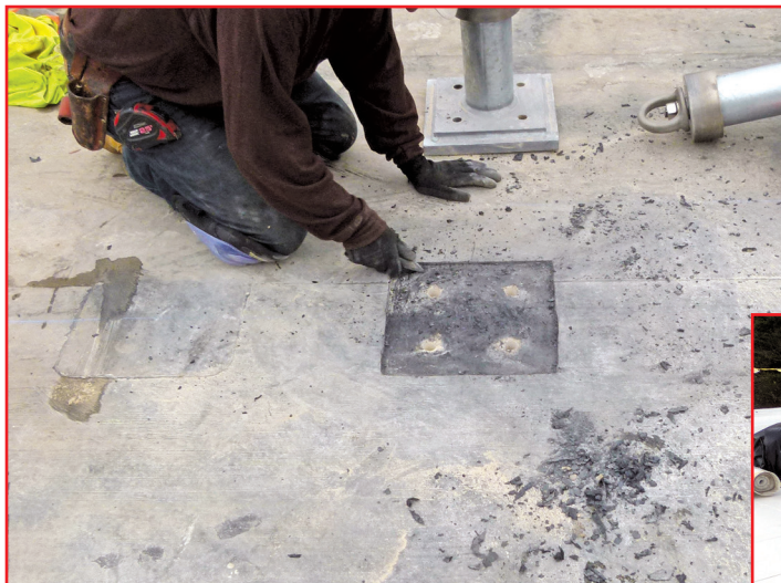
Figure 3 – Vapor retarder removal for fall arrest anchorage directly to concrete roof deck.

various configurations that would subject it to load from multiple directions, several tests on a single anchorage may be necessary to replicate potential anchor tension of in-use conditions. Due to existing conditions, some fall arrest anchorages may be difficult to test in multiple directions. Testing could entail hanging weights over the side of a building in order to simulate actual loading. Alternatively, applying loads in multiple directions to anchorages will develop maximum tension in different anchors (Figures 2A, 2B, and 2C). Applying loads in opposite directions may be required to test each anchor's maximum tension.