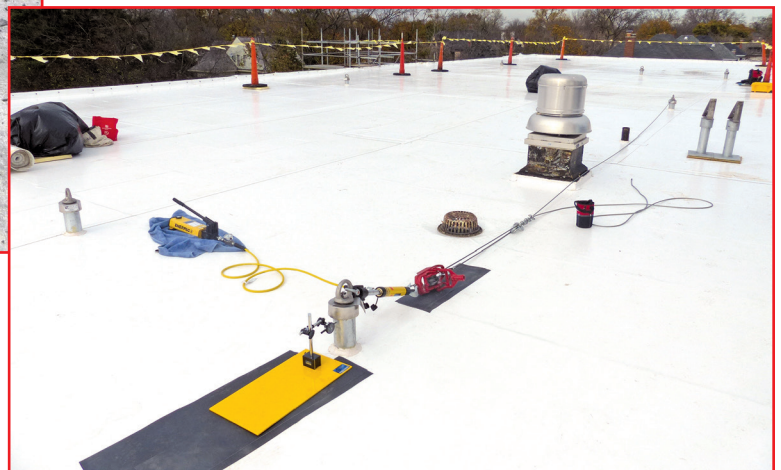
Figure 4 – Testing equipment for fall arrest anchorage.

In the authors' opinions, predicting how each anchor will be used in the future and testing it in all foreseeable directions is not practical. Consequently, a method should be developed to ensure anchors are tested in various configurations that replicate maximum load combinations on each anchor used to attach the anchorage to the structure.