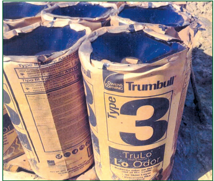
Figure 3 – Asphalt is also non-Newtonian. Some of the material may deform and flow from the carton sides, depending on ambient temperature.