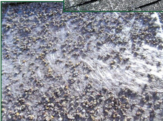
Figures 5A, 5B, and 5C – Attempting to repair these shingles would be futile. Yet it would be inaccurate to characterize them as brittle. They are instead highly weathered, impractical to repair, and should be in a landfill.