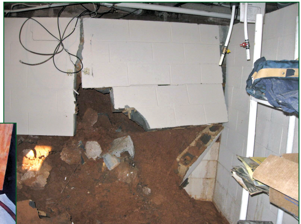
Figure 2 – Wet soil is not a Newtonian fluid. Following inward wall collapse from hydrostatic pressure, all of the soil does not self-level; a portion of it remains in a somewhat undisturbed position.