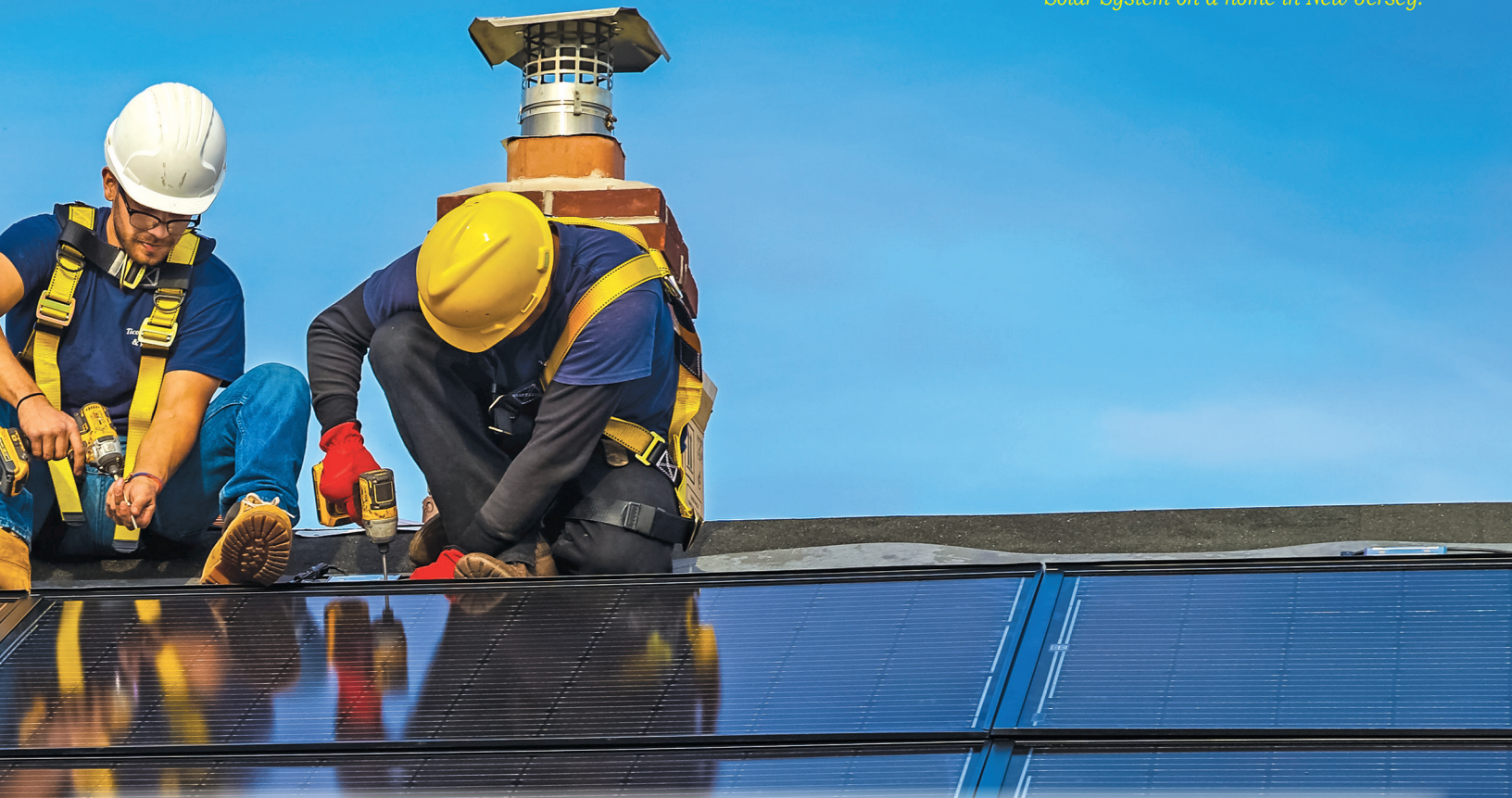
Figure 1 – Installers using personal protective equipment while installing GAF's DecoTech™ Solar System on a home in New Jersey.

Based on the complexity of the project, the permit drawings should be stamped by a structural and/or electrical engineer after review. The permit design should comply with all applicable codes and also get approval from the local authority having jurisdiction (and may require the local fire marshal's approval) before construction begins.