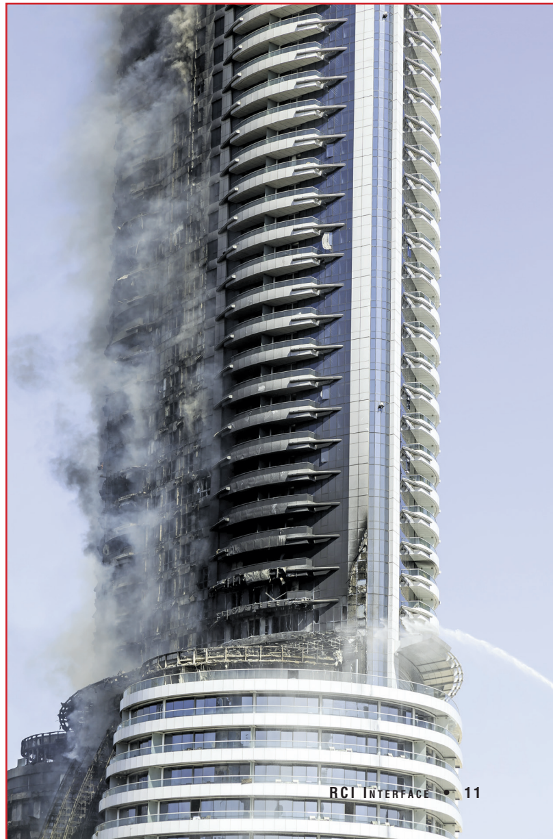
Figure 2 – The Address Downtown Dubai fire, January 1, 2016.

Initial reports and rumors suggested that the fire may have been triggered by fireworks displays nearby. Concerns and discussions of potential terrorism or foul play soon followed. However, it was not long before building industry professionals began looking at the building’s exterior cladding system as contributing to the rapid fire spread along the exterior curtainwall system. What reportedly started as an electrical short on the 14th floor of a terrace eventually engulfed a significant portion of the building’s exterior. The fire