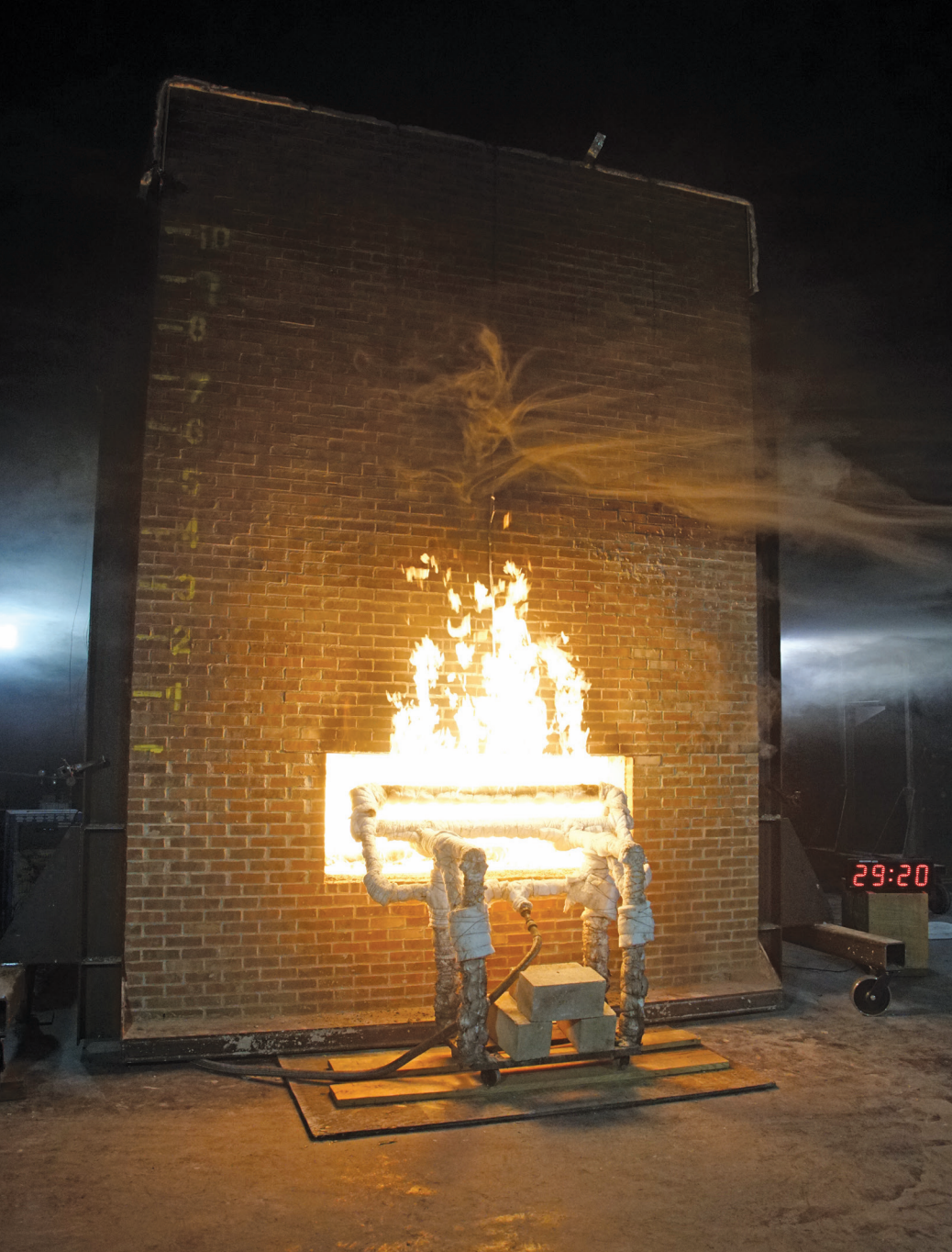
Figure 5 – NFPA 285 test in operation.

to those in Table 602 of the IBC, which is summarized in Figure 4. These ratings are intended to prevent fire from spreading from building to building, and are predicated on building separation distance, anticipated fuel load, and occupancy (use) group hazard classification.