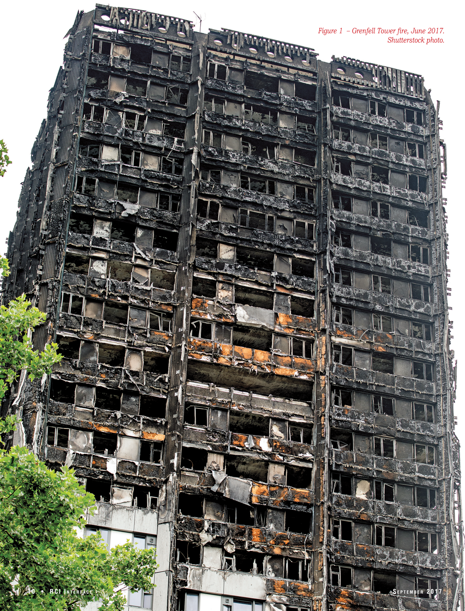
Figure 1 – Grenfell Tower fire, June 2017.