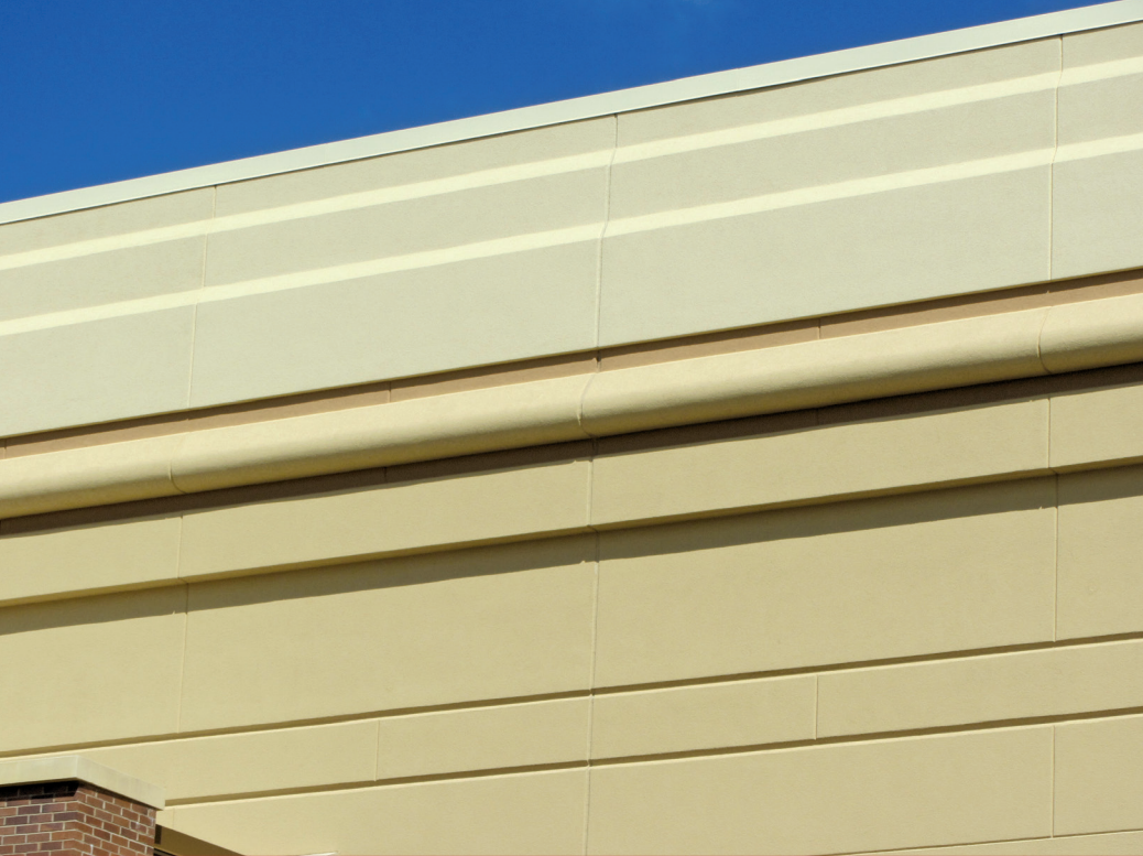
Figure 6 – Large foam shapes.

more popular over the past several years, do not contribute to the flammability or combustibility of veneer systems.