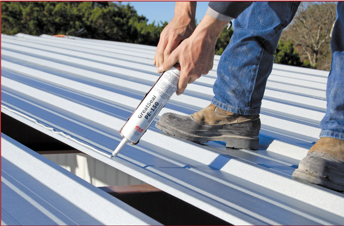
Figure 1 – Metal roofs have many prep steps prior to recoating. Check for the compatibility of sealants and patching materials prior to coating application.

Cohesion is a failure within the coating itself. Cohesion failures are usually attributed to product quality from the point of manufacture or product degradation due to improper storage. These circumstances can lead to a change in product chemistry that can affect the product as a whole. Cohesive failure can also be within the layers of the coating system. Potentially, this could be categorized as adhesion, but since the multiple layers of primer, base coat, and finish coat have been conceivably engineered to bond to each other, we will call this a cohesive failure. Violation of successive coating windows is typically to blame for this sort of failure. Many primers and base coats need to be coated within hours—not days or weeks—to ensure bonding of successive layers. Consult product and system application guides to make sure everyone is on the same page for the work effort required on the roof. Application beyond product shelf life can also be a cohesive failure issue, but should it have been applied in the first place? Please be cognizant of this easy-to-conclude reason for product exclusion or rejection at the jobsite.