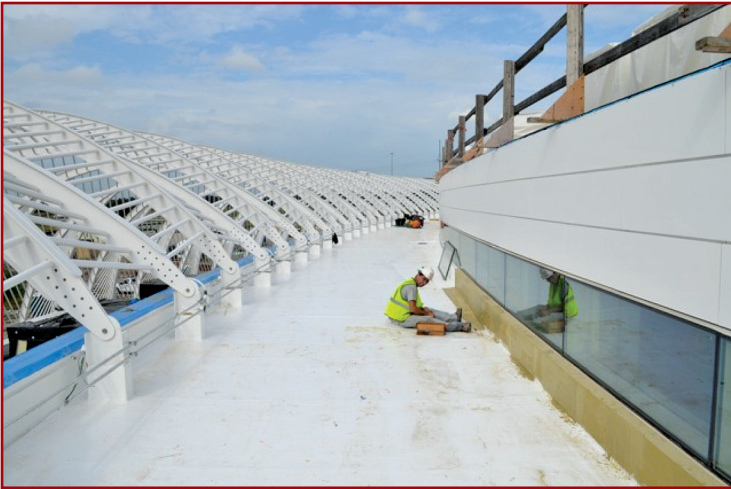
Figure 4 – Manual labor is an essential element of substrate preparation. Do not underestimate the effort.

to the application rate—which is always different than the final coating, so you need to get back on it while it is tacky.” A contractor focused on spraying advised, “Multiple thin coats work better than one thick coat.”