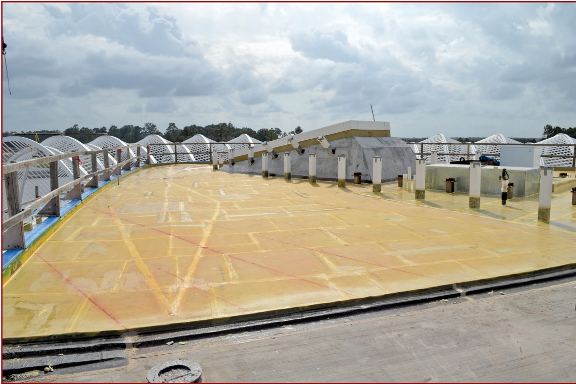
Figure 3 – Check the cover board joint treatment requirements for the coating system to be installed to reduce reflective cracking.

area and make a shade structure to keep reactive or two-part products out of direct sunlight. That led into a conversation on substrate temperatures and application temperatures. So many products in the roofing industry have a “sweet spot” for application, and 50° to 80°F (10° to 27°C) is the “prime time” for roof coatings. Cooler temperatures cause coatings to take longer to set up, and hotter temperatures and hotter substrates tend to create rapid cure times that make hand-applied material difficult, necessitating a sprayer.