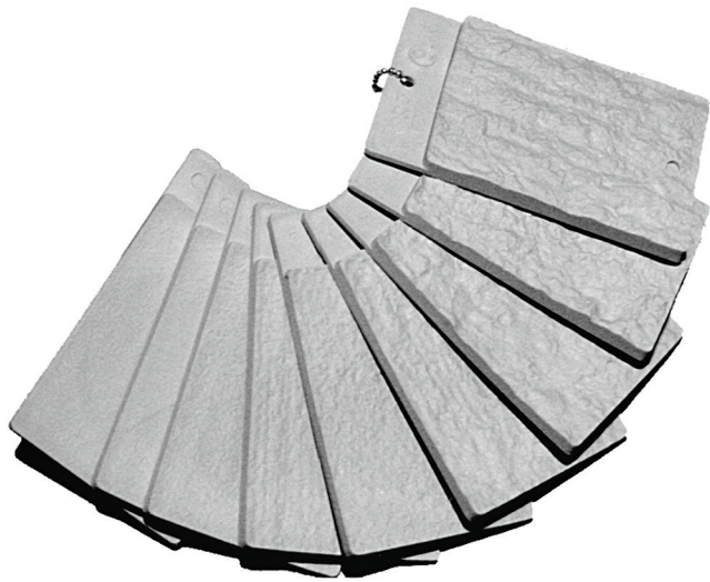
Figure 2 – Concrete surface preparation can be achieved by many forms of scarification. Refer to ICRI Surface Profiles for proper roughness.

preference should be given to mechanical means of surface preparation over water blasting. Compressed air is one of the most effective methods for freeing and removing loose materials from the roof surface. Compressed air does not introduce moisture. Compressed air can get a lot of work done very quickly. Used with a stiff bristle broom or even a rotary power broom, a lot of the surface dirt can be removed as well. Even using a leaf blower is a decent substitute for an air compressor.