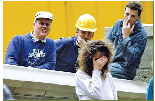
Figure 3 – Credit: The Niall Boylan Show

Women don't have as much access to male bosses in casual settings. Think about when those important, developmental conversations happen with your male employees. In our experience, they are just as likely to happen in the hallway or when you're golfing or watching football, as they are in the office. A woman looking for a casual opportunity to complain to or query her boss for more overtime may find fewer opportunities to have this conversation. Considering that she may already feel uncomfortable because she sees the subject of such a conversation as poten-