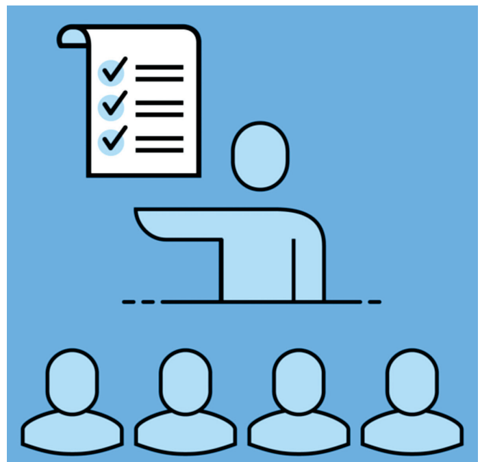
Figure 2 – Millennials are uncomfortable with ambiguity and appreciate clear direction and instruction.

Once we have more women in the ranks, our next task is to keep them. Women’s dif-