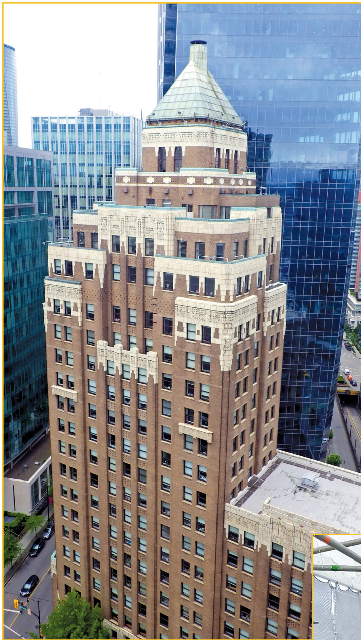
Figure 2 – The Marine Building, located in downtown Vancouver, British Columbia, Canada. When the Marine Building opened in 1930, it was the tallest building in the British Empire. The Marine Building is an exemplar of the Art Deco style.

preservation, rehabilitation, restoration, or a combination of these actions or processes. 5