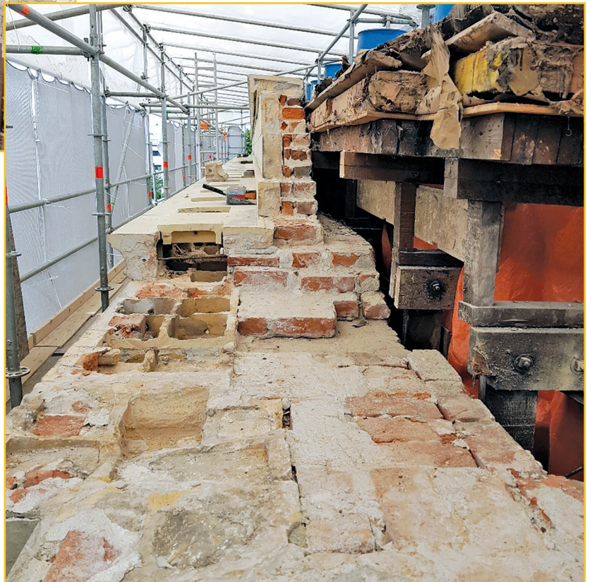
Figure 3 – Reconstruction of a terra cotta cornice, including upgrades to the structural support as part of a conservation activity. The cornice is a character-defining element of the historic building.

To understand the significance of a given historic building, it is necessary to begin with research. Is the building simply old (“historical”), or is the building in fact a recognized historic place or historic property? During an initial research phase of the building, we can discover information that helps focus the scope of the proposed conservation activities: