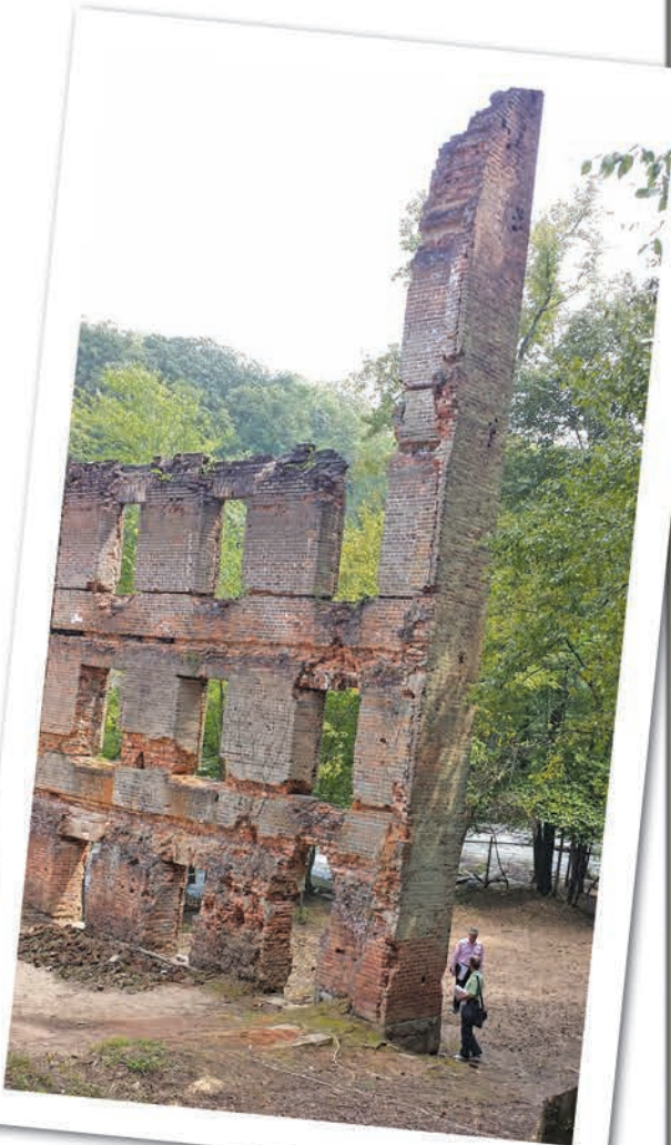
Photo 2 – View of five-story brick masonry piers, three stories of which are free-standing.