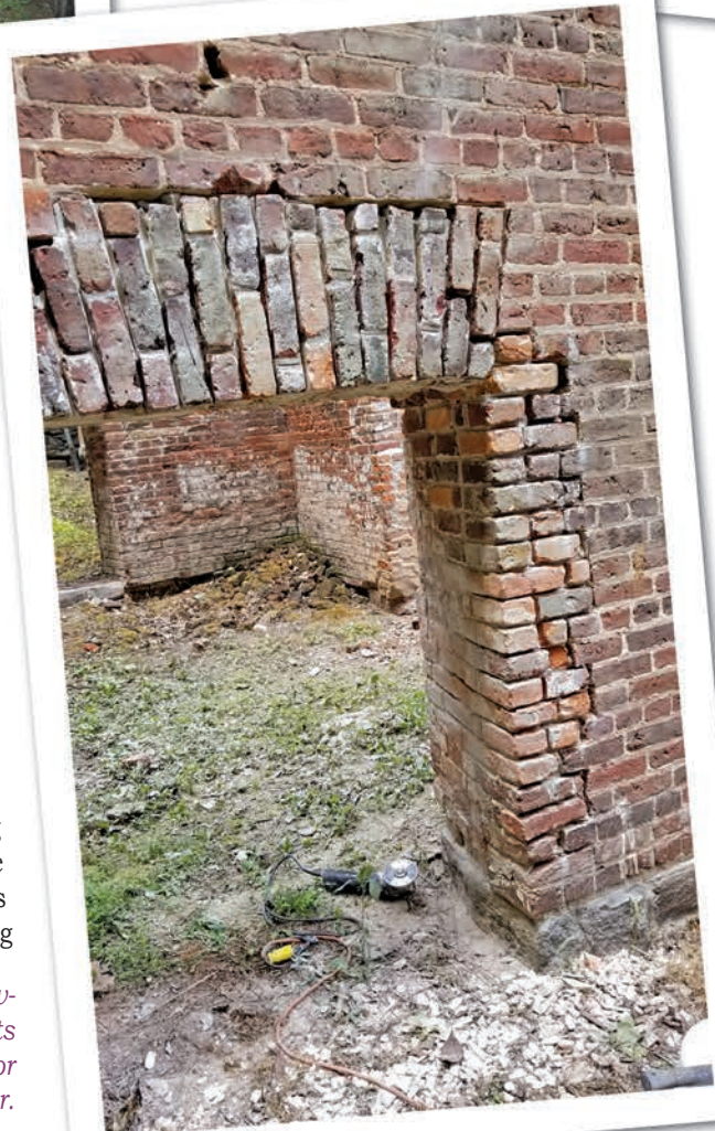
Photo 10 – Saw-cut mortar joints in preparation for tuckpointing mortar.

We discussed the scope with GDNR and agreed upon the following repair work, which was then presented to bidding contractors in the form of specifications and drawings. A quantity of the original brick units were salvaged and utilized to perform repairs. This included removing and rebuilding unstable brick units exhibiting advanced deterioration. A sloped, low-profile, generally moisture-resistant concrete cap was placed on horizontal surfaces to alleviate standing water (Photo 5). Other repair areas included