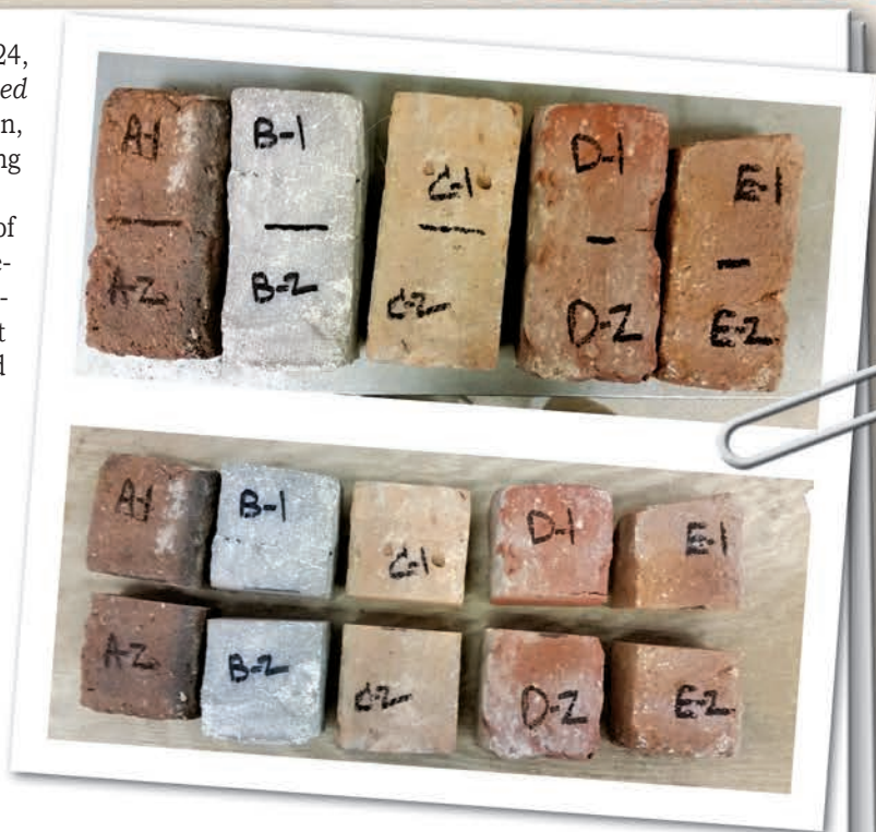
Photo 4 – Brick samples collected and analyzed per ASTM C67, Standard Test Method for Sampling and Testing Brick.

The tested absorptive qualities of the brick reflected percent absorptions ranging from 9.7% to 22.1%. Results beyond 20% are considered high and will likely affect the long-term performance of the brick. U.S. Heritage Group assisted with testing and analysis. One brick sample tested exceeded 20% absorption.