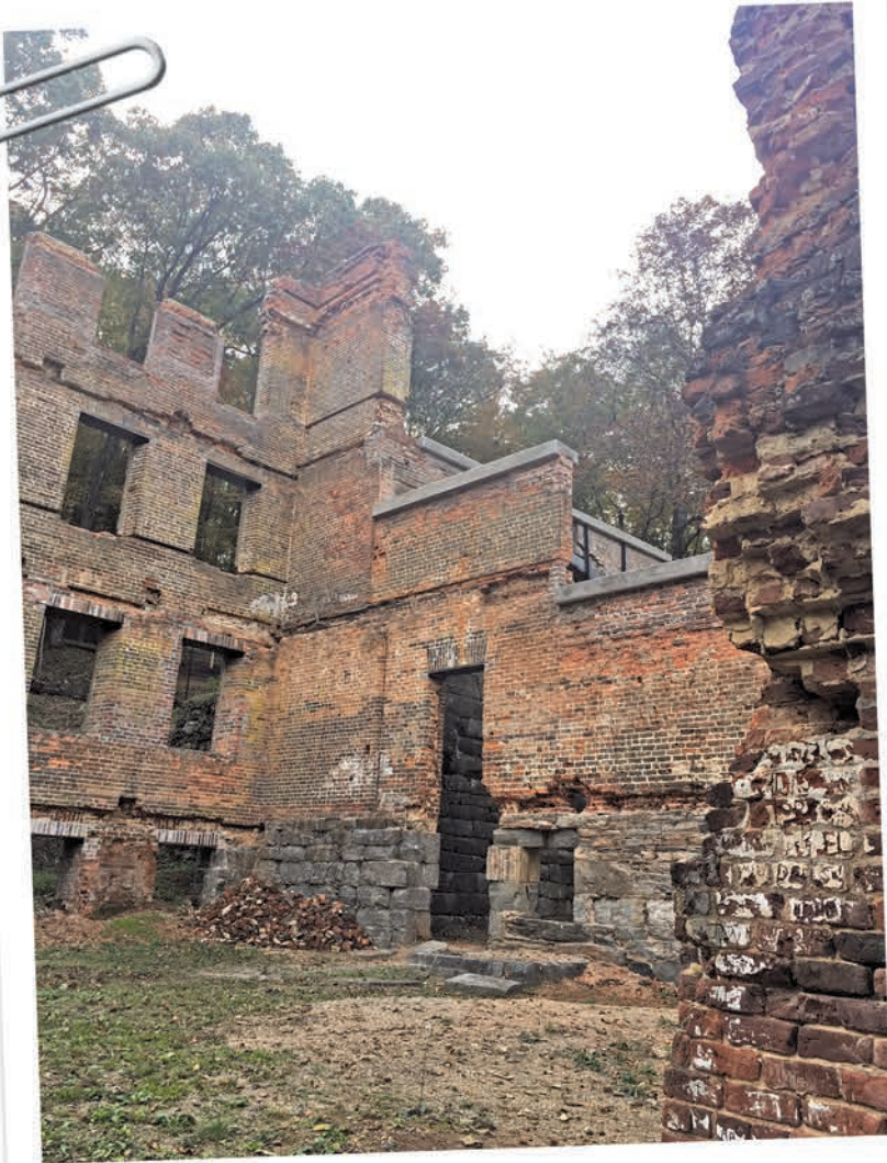
Photo 5 – Sloped concrete caps installed to protect walls and shed standing water.