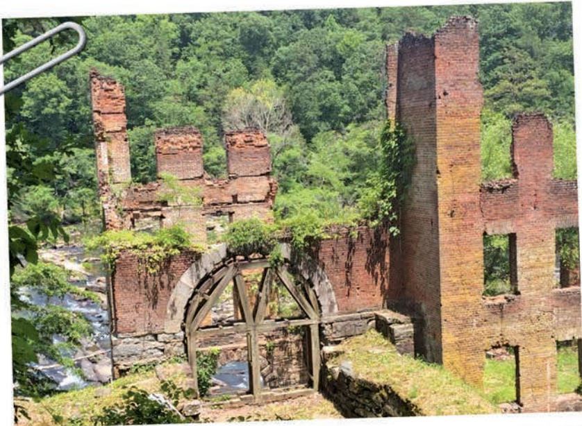
Photo 1 – View of original water-powered mill archway before timber framing removal.