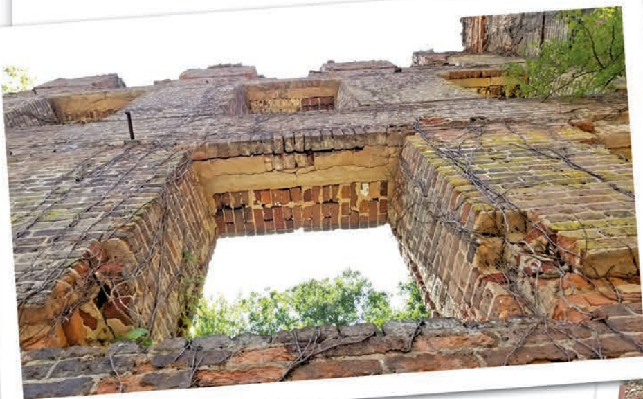
Photos 6 and 7 – Window openings with brick masonry repairs and steel plate lintels.

The mortar appears to exhibit various forms of weathering, although joint cracks were rare. While we could not closely inspect the higher regions of the wall, some of the joints appear to be recessing because of water likely cascading from the upper horizontal surfaces of the standing walls. Stresses, such as settling, have resulted in vertical cracks that extend through the masonry. These cracks were located higher up on the walls than we could access. Transmission of the cracks was not visible on the opposite face of the walls.