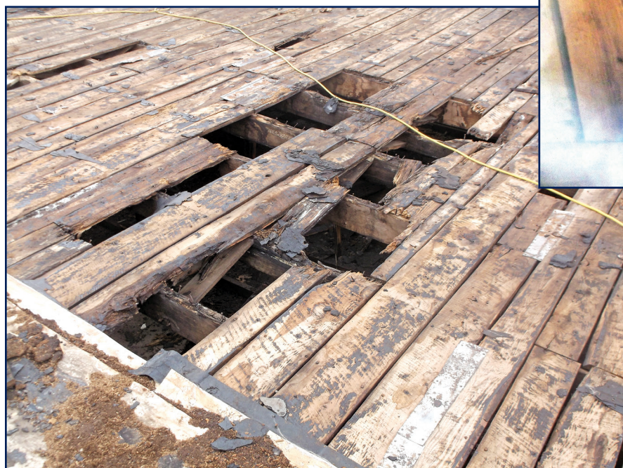
Figure 7 – This newer roof had been installed with little thought given to proper deck repairs.