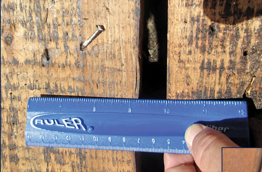
Figure 8 – Wide decking gaps are problematic for reroofing projects. Usually occurring in older structures, the gaps can create fastening problems (i.e., greater likelihood for nails to occur in the plank joints).