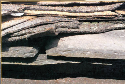
Figure 3 – This old slate roof was later topped with two layers of shingles; an old plank deck lurks below this mass of roof materials (evidently, the pneumatic nail guns were working well). Other bizarre combinations of materials can also be encountered.