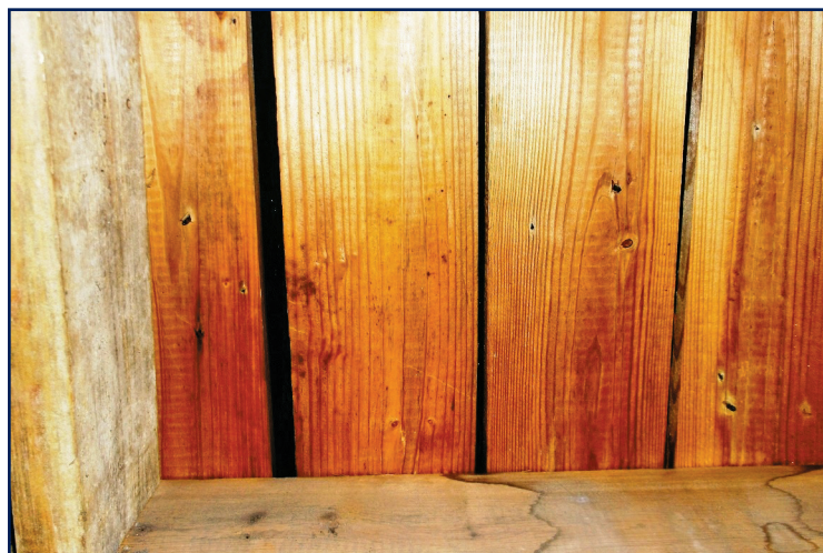
Figure 10 – Note that shrinkage of planks is seldom uniform. This occurrence will require a judgment call regarding the proper course of action.

When individual planks are replaced, it is advised that the new members be situated across several supports. Just as with plywood or OSB, board sheathing provides some lateral stability for the framing, and small plank fractions are not as sturdy as longer elements that span multiple supports. Figure 7 depicts a newer roof that had been installed with little thought given to proper deck repairs; this merely postpones a correct remedy for the next roofing team.