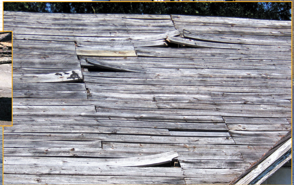
Figure 2 – Left exposed for much longer than appropriate, this deck has distorted in response to cycles of wetting and drying. Now, much of it will require repair before a covering can be applied.