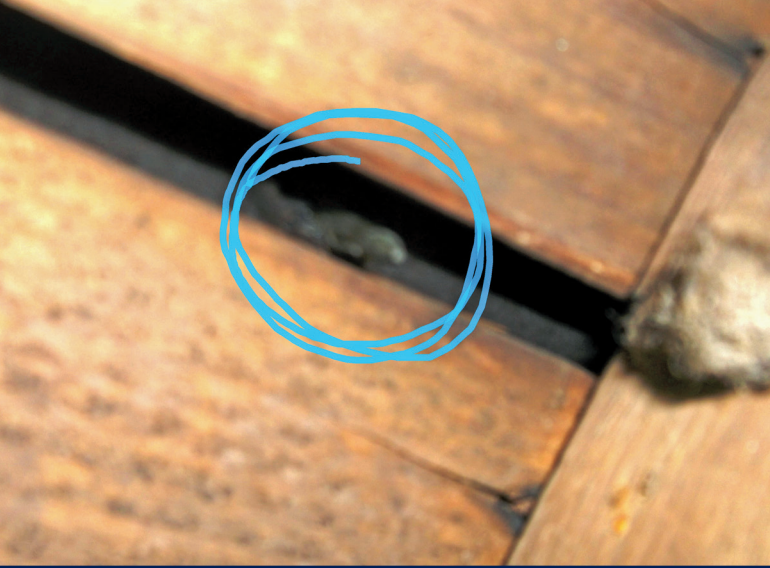
Figure 11 – If deck planks are 6 in. wide and a 1/8-in. gap is present between planks, there is a 9.4% chance that any random nail will occur in a joint opening. Where joints are 3/4 in. wide, there is an 11.1% chance for wayward nails.

of wayward nails for the new roof covering.