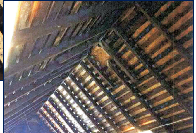
Figure 5 – This spaced decking on an old church was later topped with OSB sheathing. Only when attic access was gained did the skip sheathing become recognized.

Elsewhere, the author has encountered two layers of shingles installed over original wood shakes, as well as other bizarre combinations; an old wood plank deck usually lurks below this mass of materials. As more layers of roofing are added, there is an increasingly remote chance for water to percolate its way through to the roof deck. This can give the false impression that the roof is performing adequately. Stacking roof layers in this manner is a departure from rational thinking—and very likely a code deviation unless there has been formal approval by petitioning for a variance consideration.