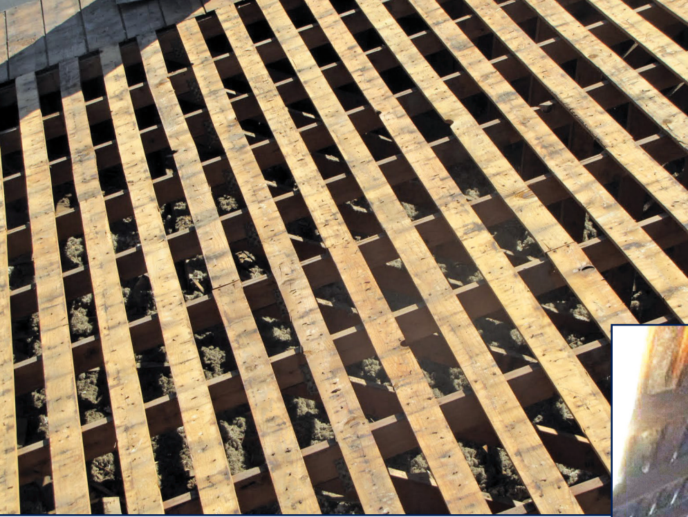
Figure 4 – Spaced decking (also known as skip sheathing) may be found below wood shakes, slate, and tile.