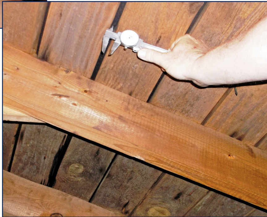
Figure 9 – Fastening that does not engage the plank sharply reduces wind resistance, frustrates the installing mechanic, and reduces rooftop production. Shingle manufacturers are aware, and a figure of ¼ in. is the increasingly familiar limit for gaps in order for warranties to be honored.

OSB. Although topside fastening is mostly “blind,” some care can be taken to find support joists and engage new sheathing edges to the supports. Figure 5 depicts spaced decking on an old church that was later topped with OSB sheathing. Only when under-deck access was finally gained did the original skip sheathing become known (the attic door opening was very small, with few individuals ever attempting entry). With the deck overlay alternative discussed here, there may sometimes be a structural loading consideration. This will hinge on matters of rafter/support type and spacing, slope, potential for rooftop snowdrifts, etc. Accordingly, the decision to overlay should include proper scrutiny of likely loading scenarios.