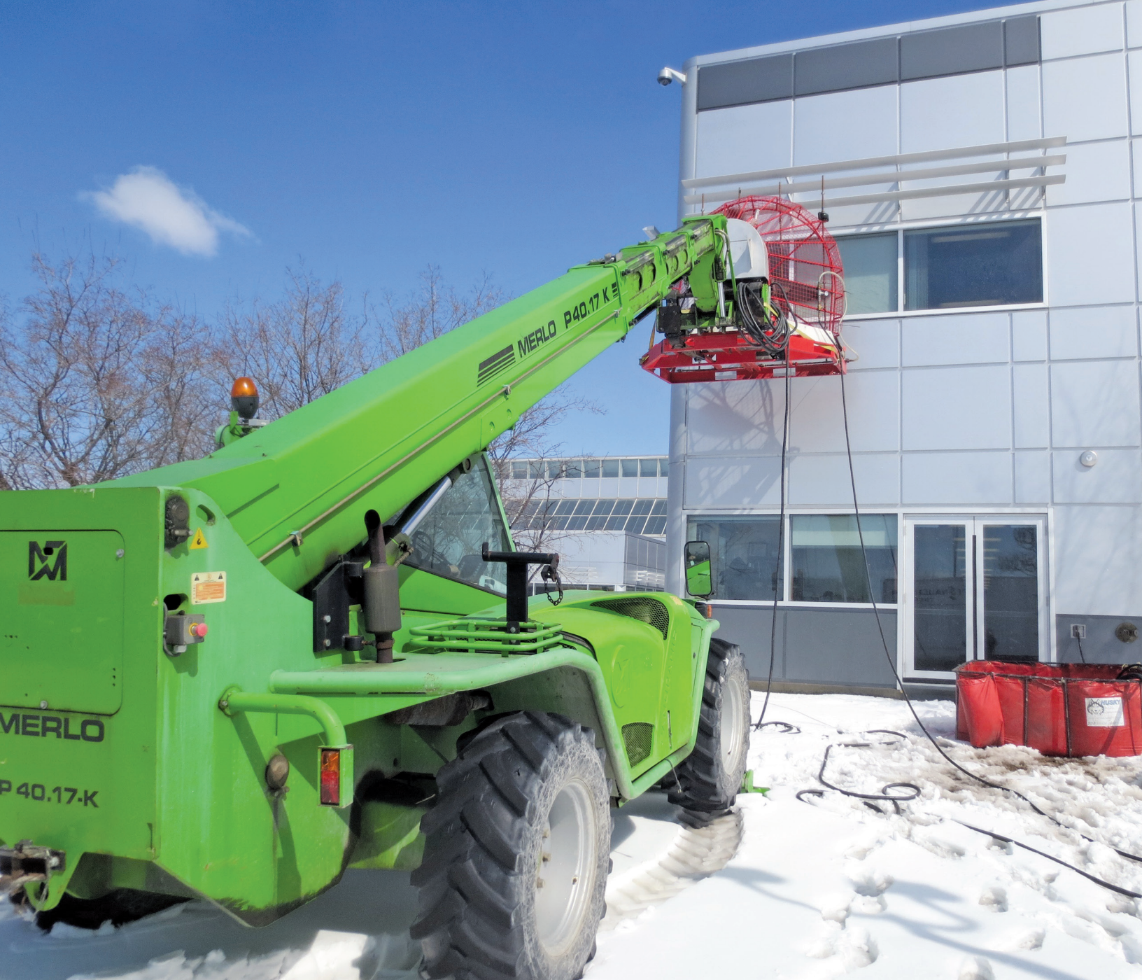
Figure 5 – Dynamic water penetration field test as per AAMA 501.1.

to function as an integrated system, while identifying sources of problems and providing information on how to mitigate or remediate those problems. It also helps to provide assurance for the building owners, contractors, and architects that the products perform after they have been installed. So, when considering field testing, it is important to identify the areas that are most representative of the building design, as well as including critical interface connections of fenestration products with the building envelope wall assembly. It should also be considered that field testing can be conducted at different stages of construction, or even years after in-service use.