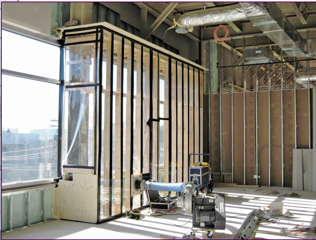
Figure 6 – Interior chamber for field test.

tion of water penetration of installed exterior windows, curtainwalls, and doors.