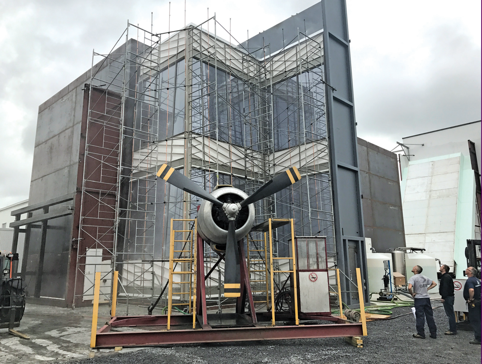
Figure 4 – Mock-up test conducted at laboratory.

Skylights – Outlines simplified methods for calculating minimum performance levels for resistance to water penetration, wind loads, and snow loads for fenestration products on buildings in Canada, and must be used in conjunction with NAFS above.