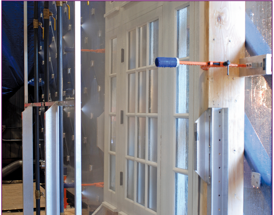
Figure 3 – Water penetration lab test per ASTM E547.

CSA A440S1: Canadian Supplement to AAMA/WDMA/CSA 101/I.S.2/A440, NAFS – North American Fenestration Standard/Specification for Windows, Doors, and